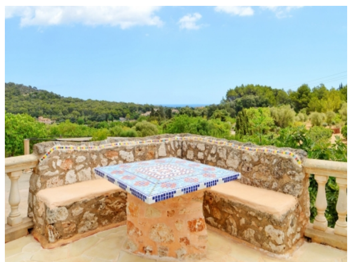
Terarce with sea viws