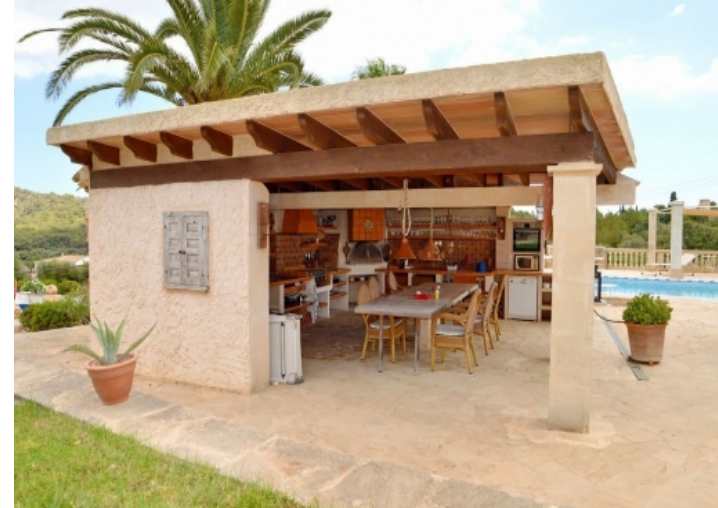
Bbq house Pool area