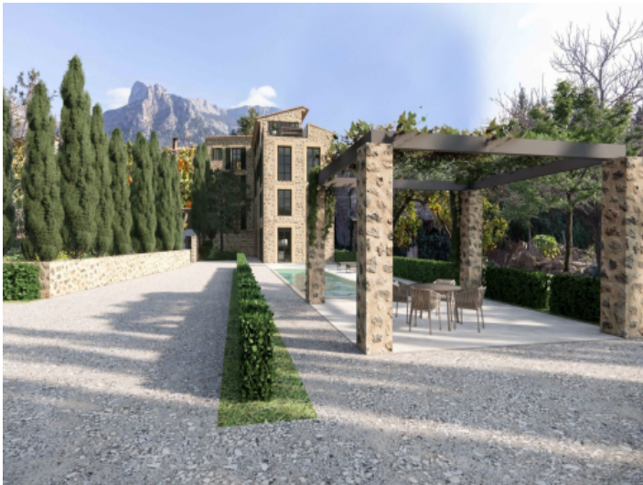
Pool and outdoor area