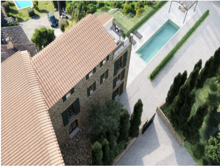
Pool and outdoor area