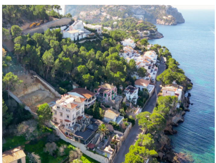
View oft the plot