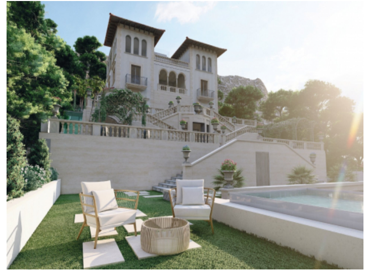
Exterior view and pool