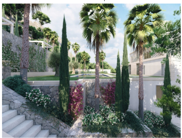
View of the garden