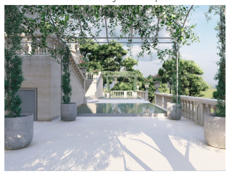
Terrace and pool area