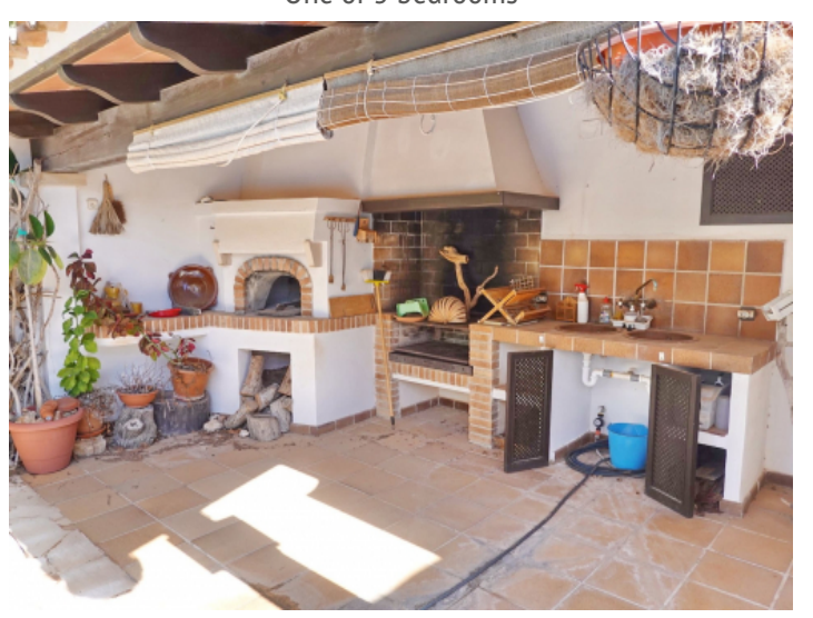
Rustic outdoor bbq area