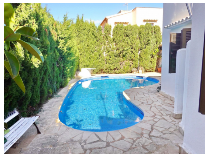
Beautiful sea views Hidden pool area