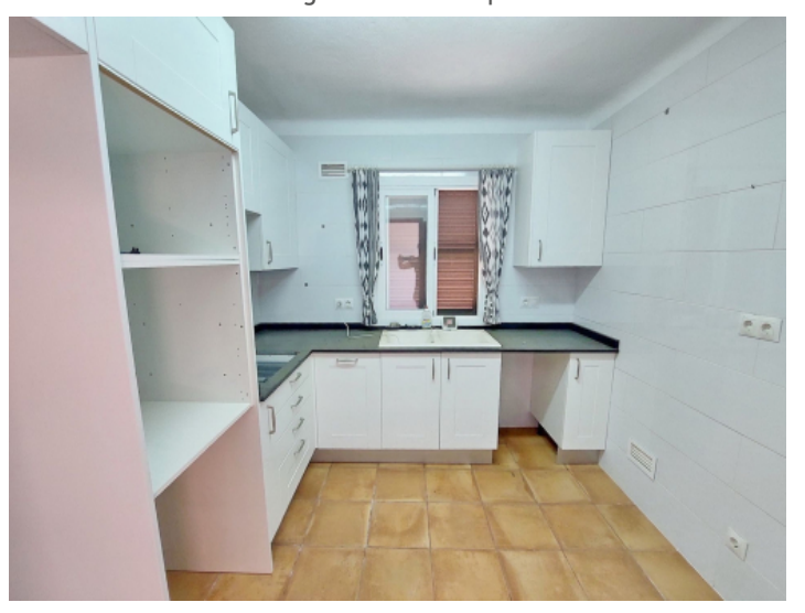
Kitchen in need of renovation