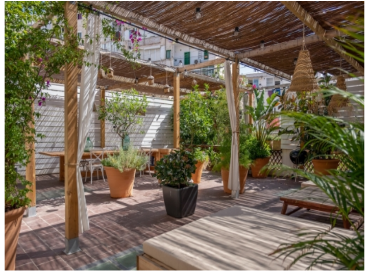
Terrace on the upper floor