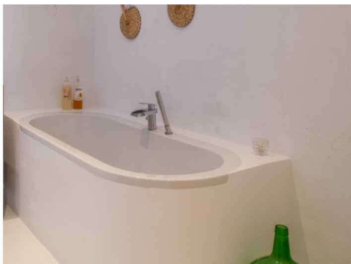
Bathroom with bath tub