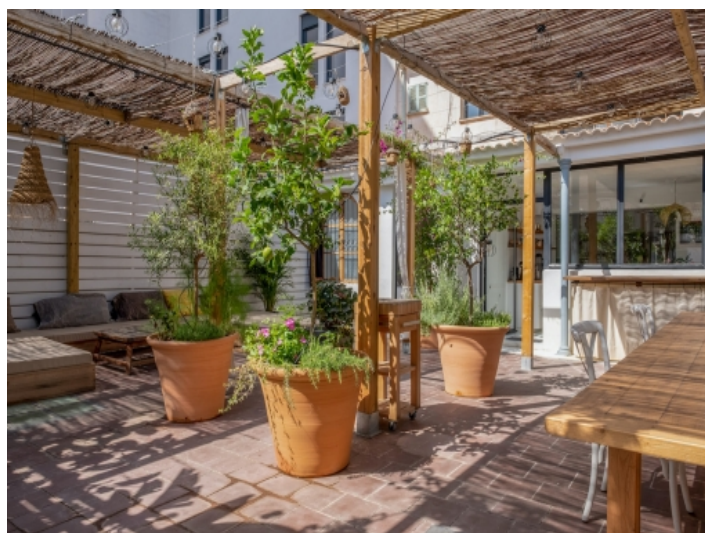
Green terrace with dining area