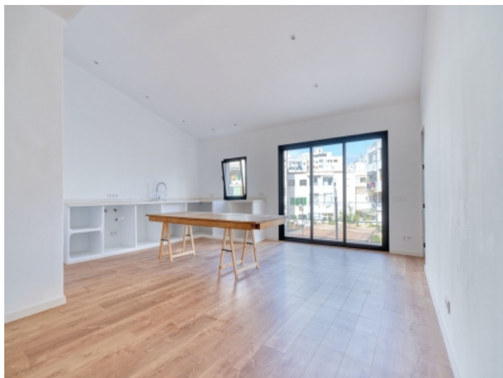
Living and dining area on the upper floor