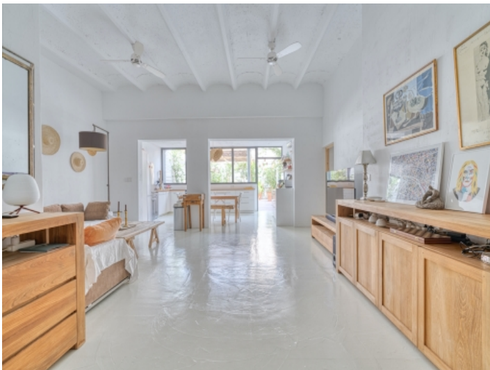
Open living and dining area of 1st floor