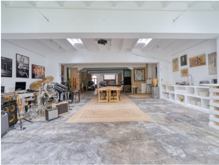
Spacious garage and hobby room