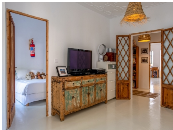
View to the bedroom