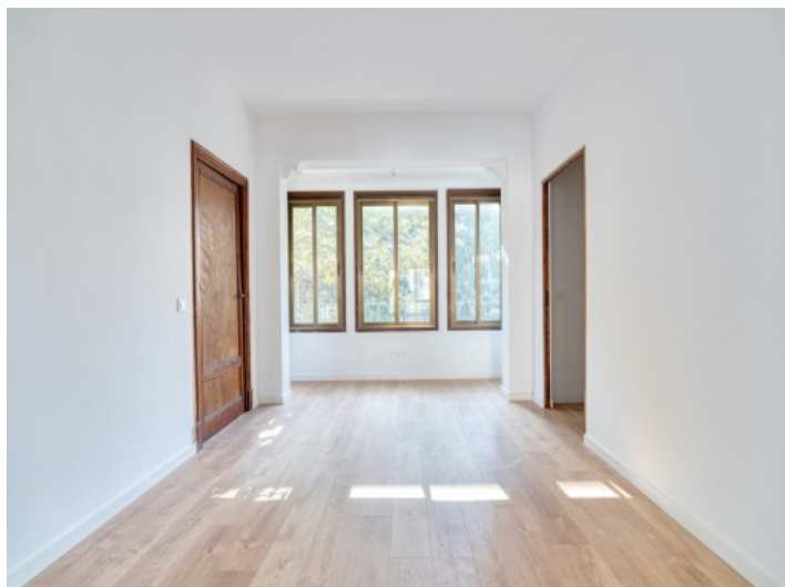
Access to the bedroom