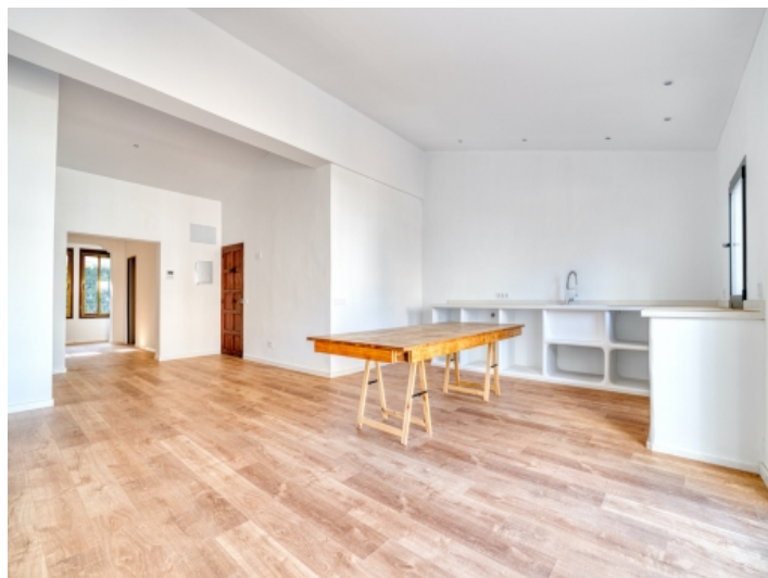
Living and dining area on the upper floor