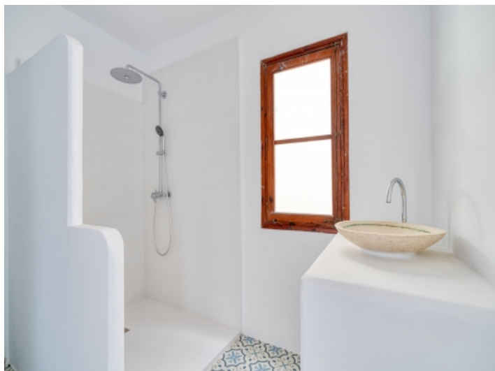
Bathroom with shower