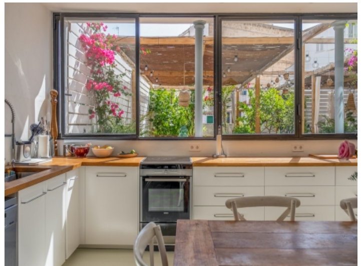
Kitchen with views to the terrace