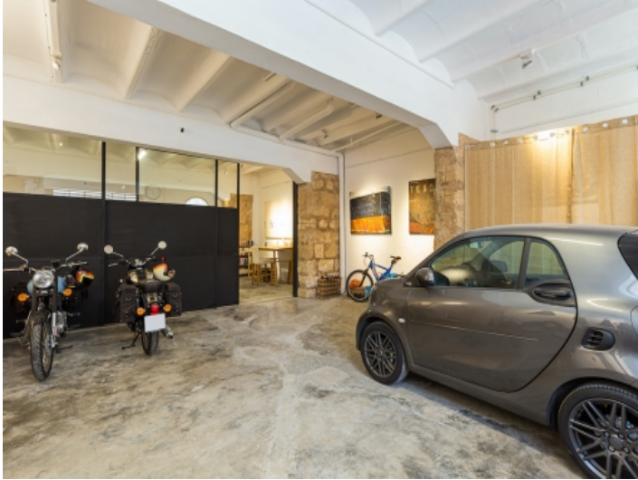
Alternative view of the garage