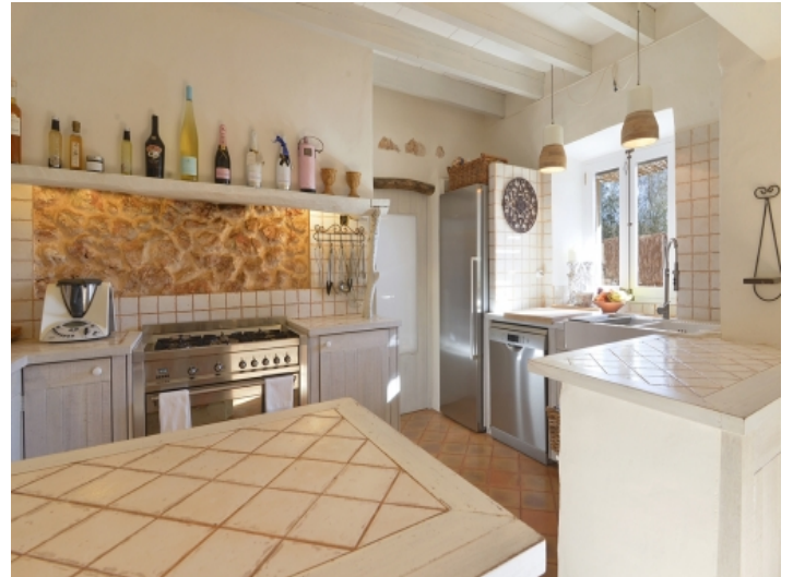
Cooking island of the kitchen