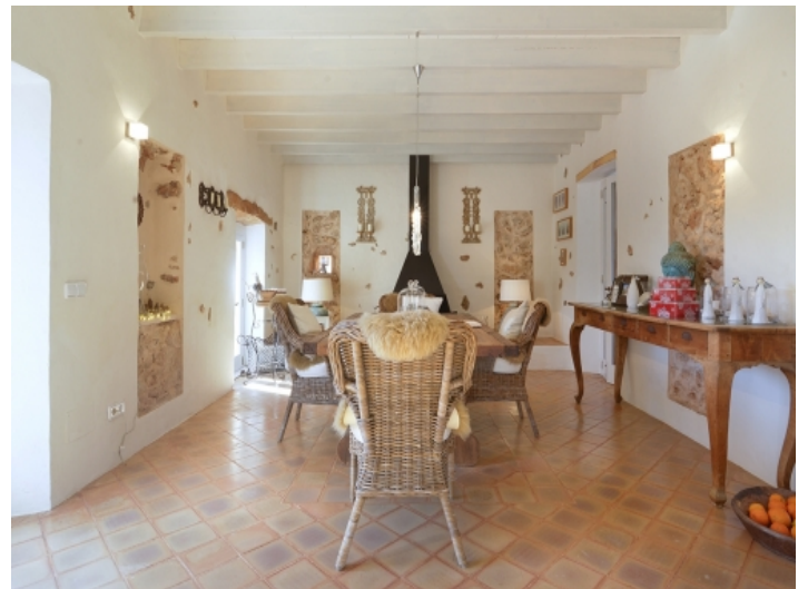
Alternative view of the dining area