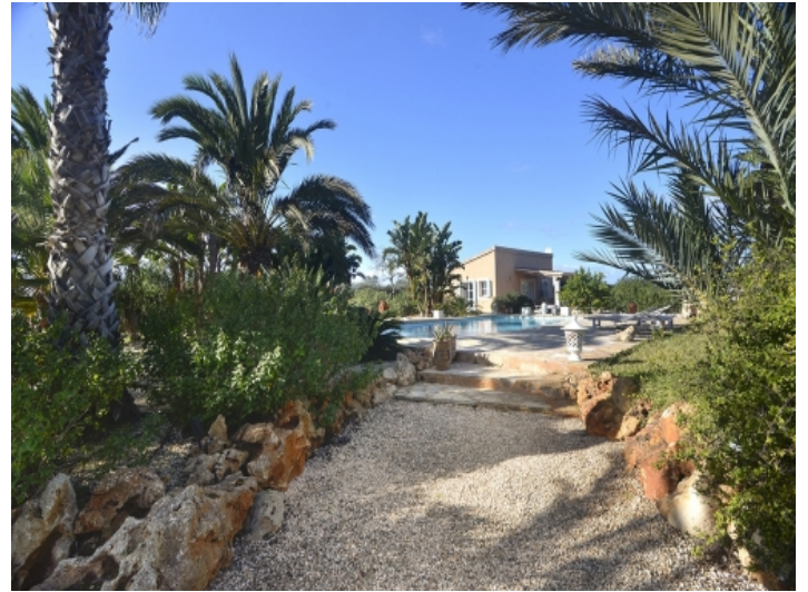
Access to the pool