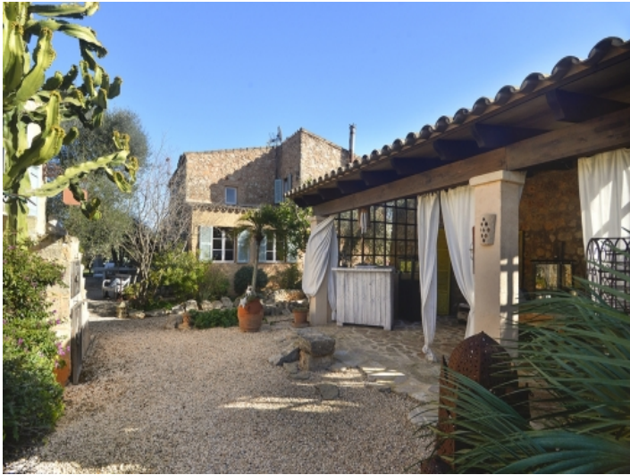
Covered terrace and dining area