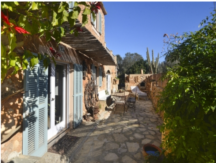
Small side terrace