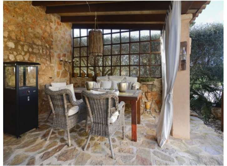
Alternative view of this dining area