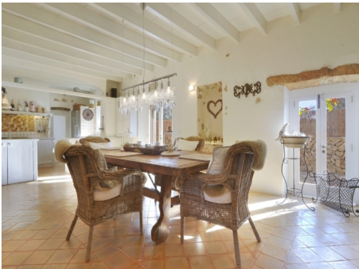
Dining area by the kitchen