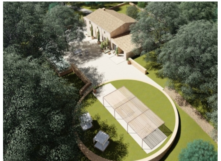
Bird's eye view