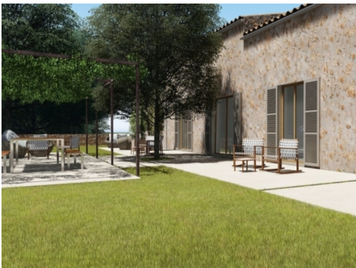
Terrace and garden