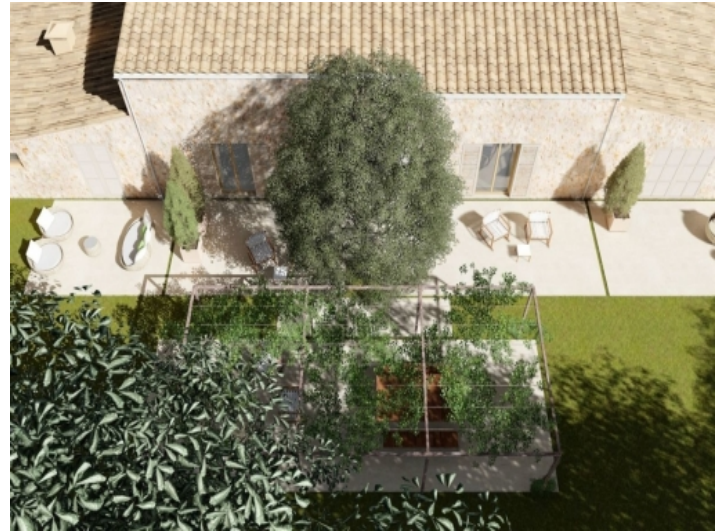
Terrace and garden