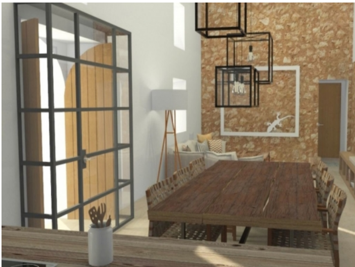
Entrance and dining area