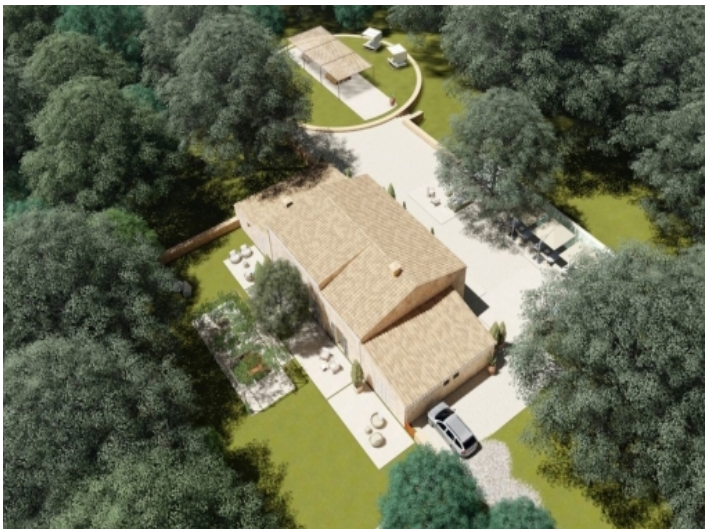
Bird's eye view