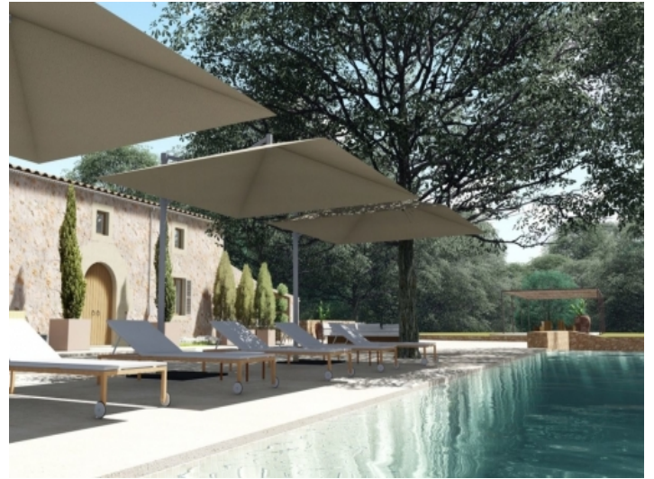
Pool and terrace