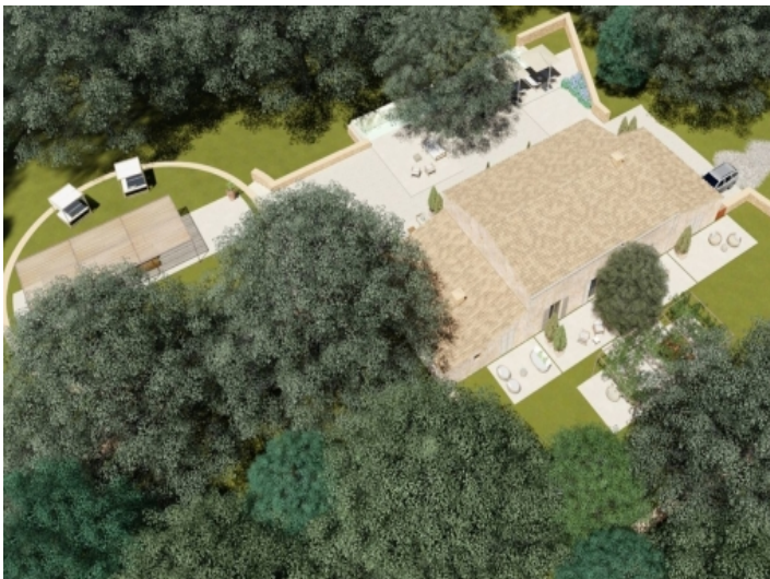
Bird's eye view