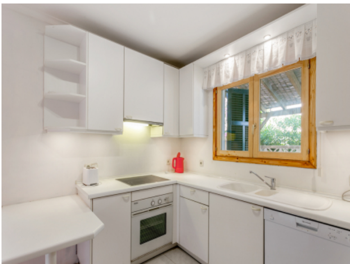
Fully fitted kitchen