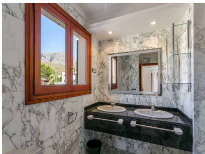
One of 3 bathrooms