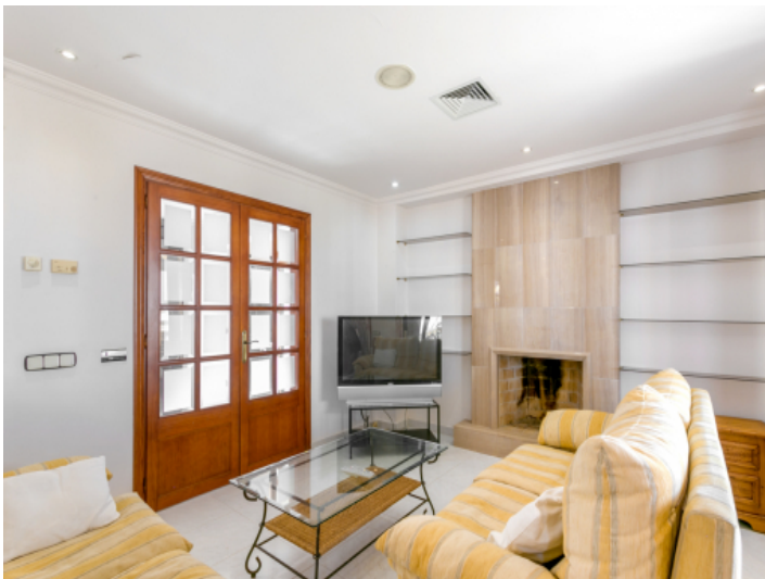
Living area with fireplace