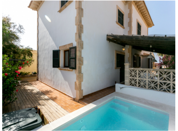
Terrace with small pool