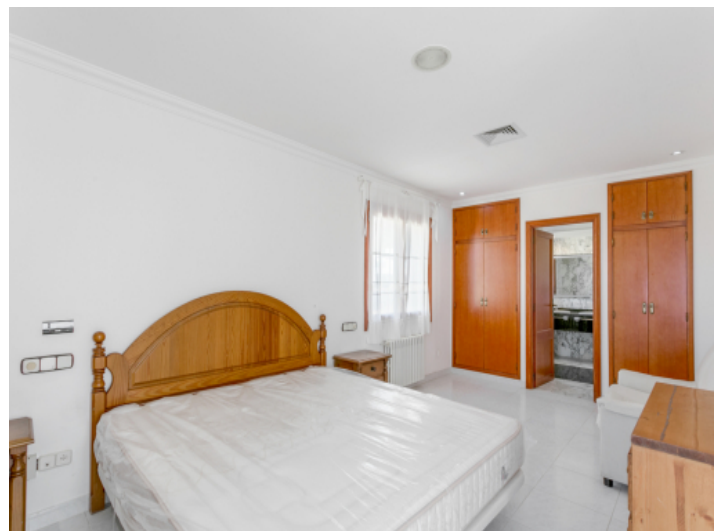
Double bedroom with bathroom en suite