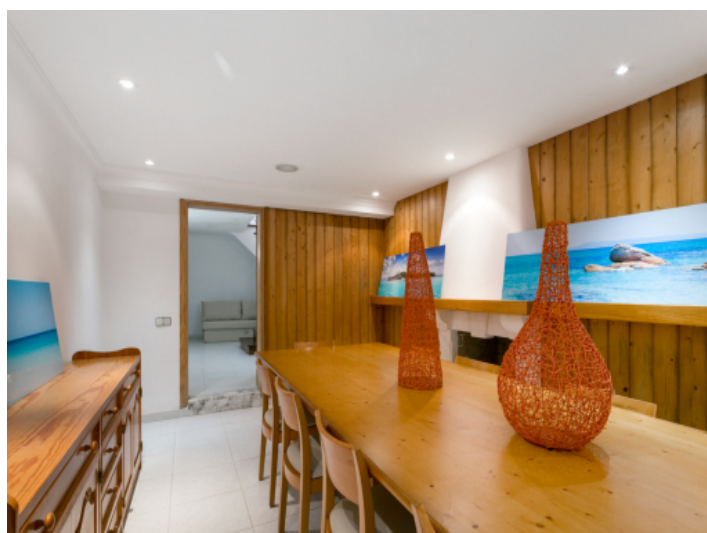
Large dining area in the basement