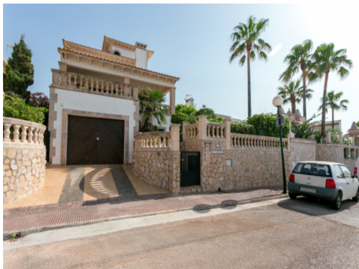
Exterior view of the villa