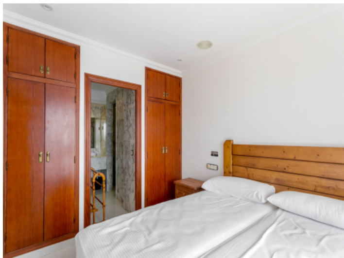
Further bedroom with built-in wardrobes