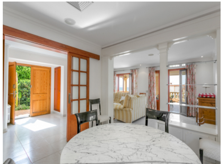
Spacious living and dining area