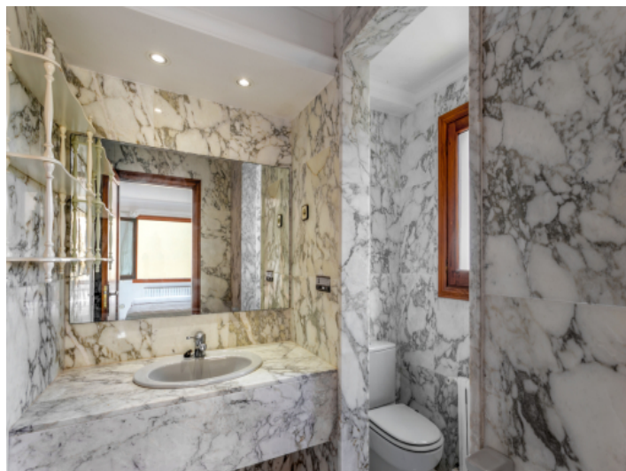
One of 3 bathrooms