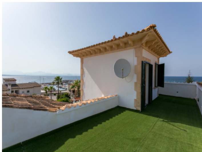
Roof terrace with fantastic sea views