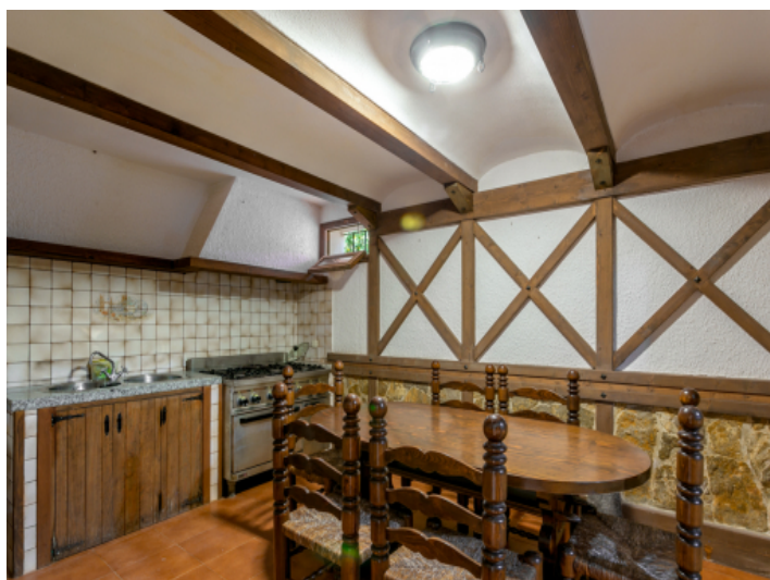
Rustic kitchen in the basement