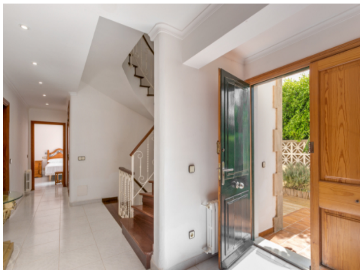
Entrance to the villa