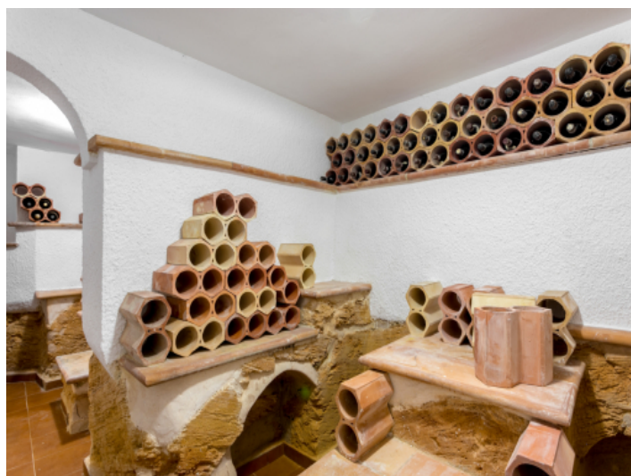
Own wine cellar