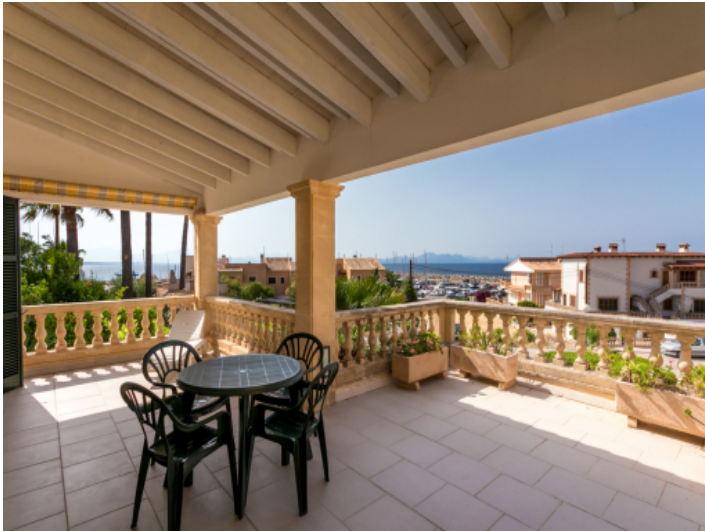
Large, covered terrace with sea views