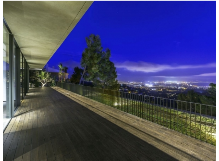
Upper terrace with fantastic views