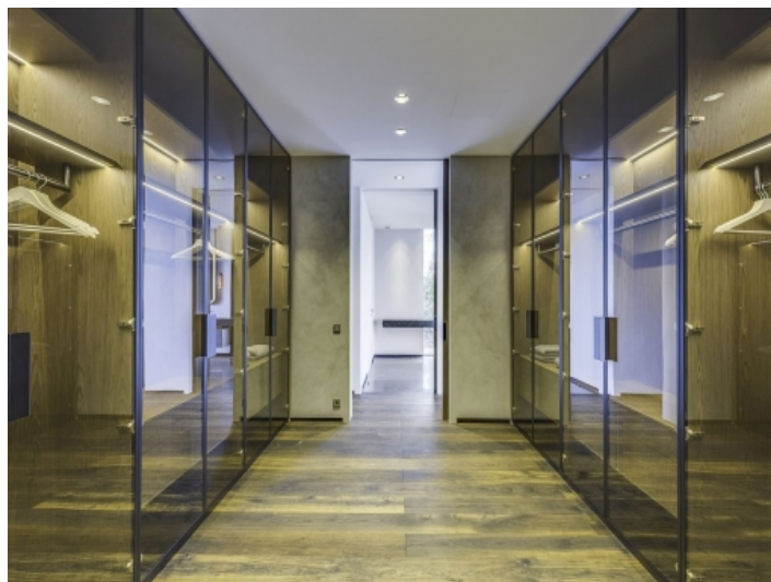
Large dressing room