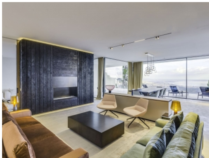
Generous living area