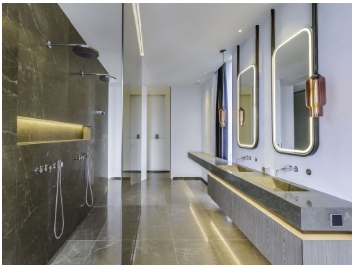
One of 6 noble bathroom