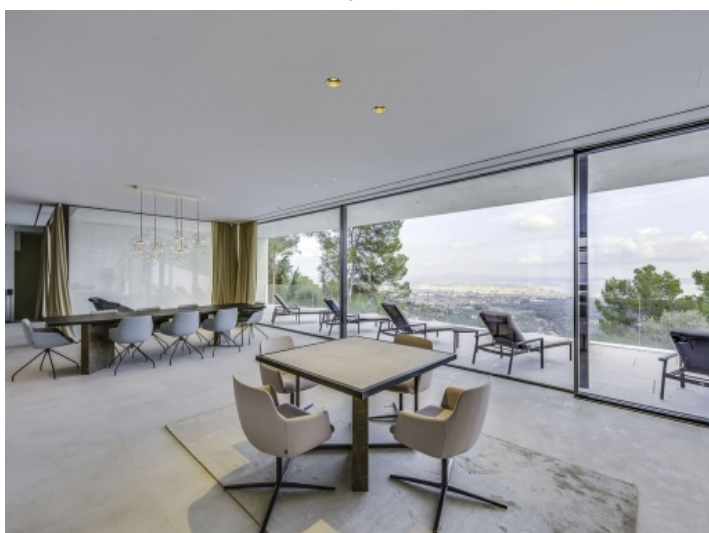
Living area with large panoramic windows