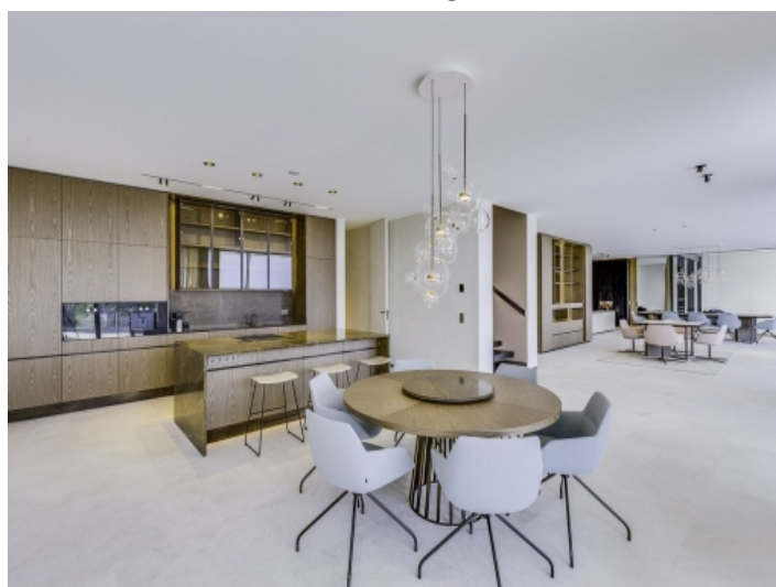
Luxurious living area with kitchen