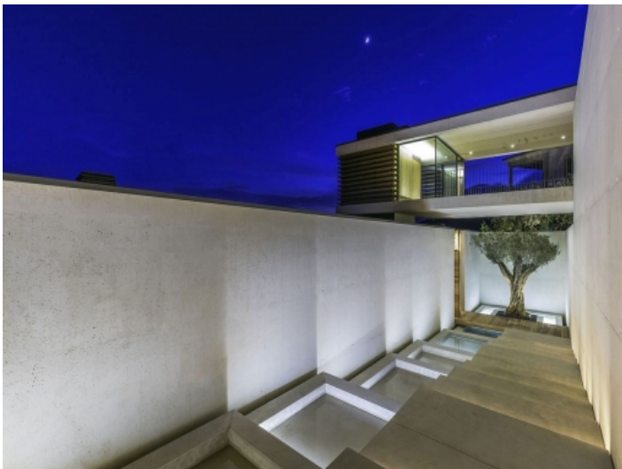
Access to the villa