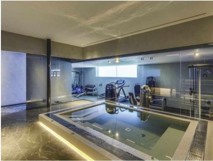
Wellness- and fitness area