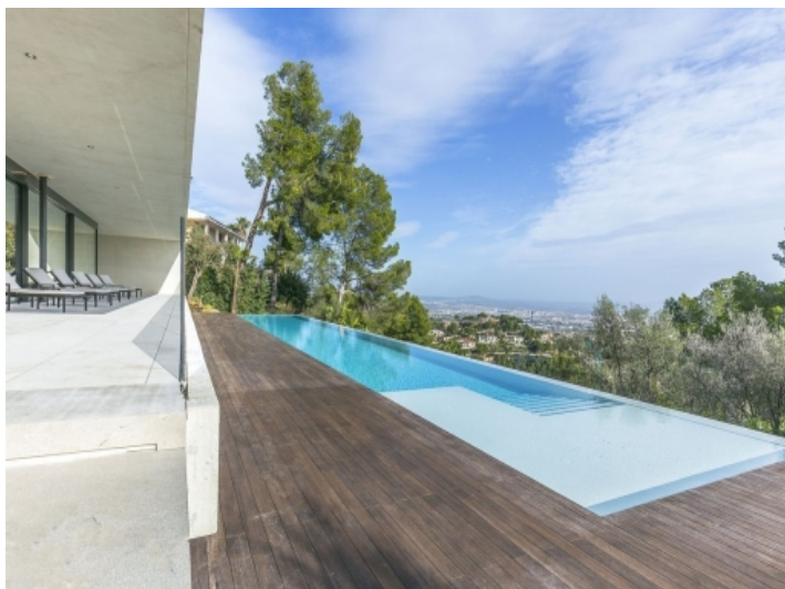
Pool with impressive views