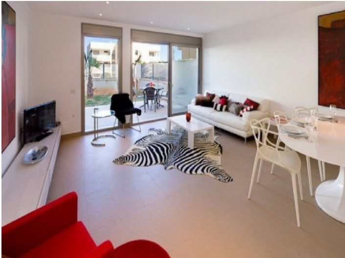
Living and dining area with garden access