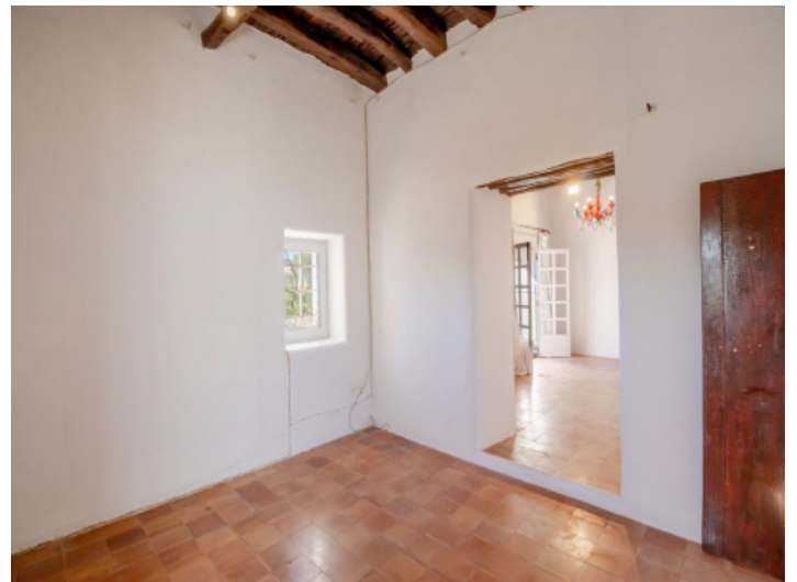
Bedroom on the first floor