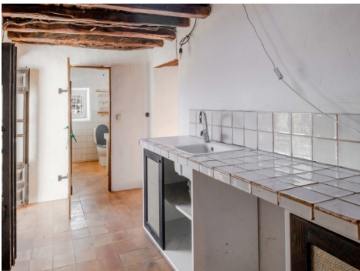
Kitchen on the first floor