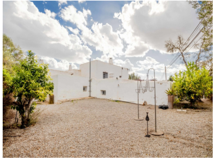
Private parking space