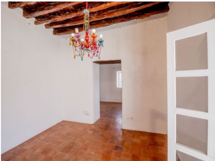
Living area on the first floor