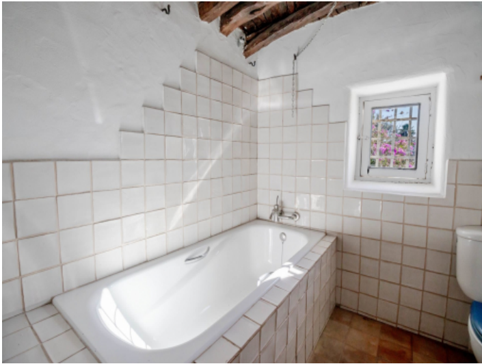
Bathroom on the first floor