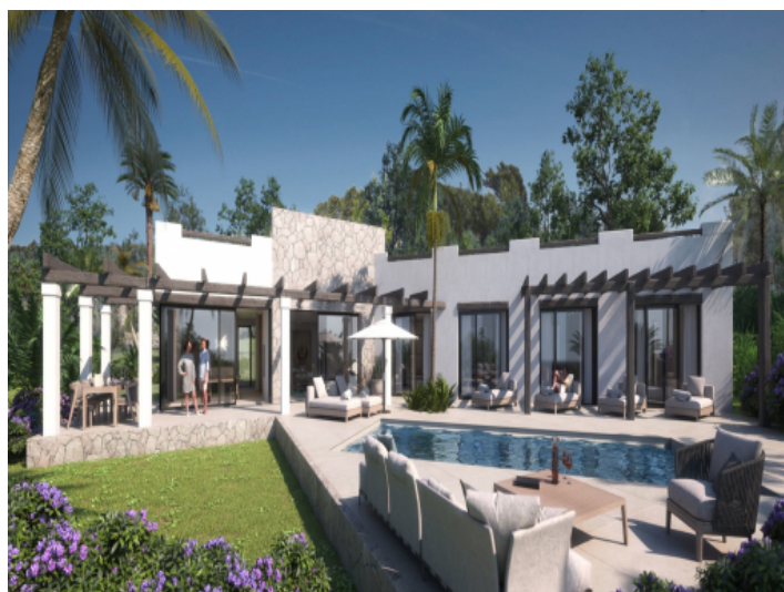
View to the property