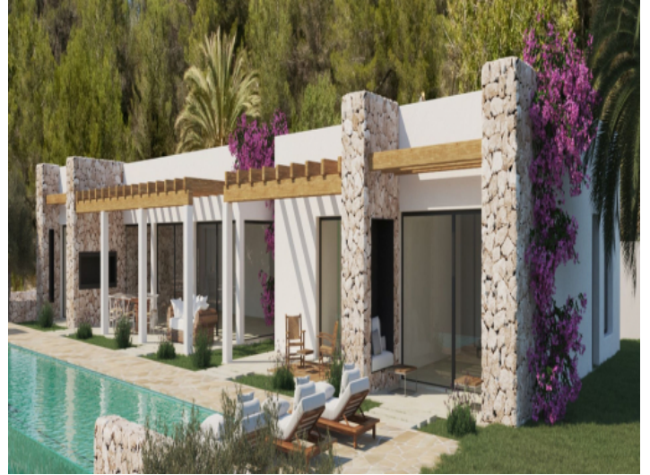
High quality construction