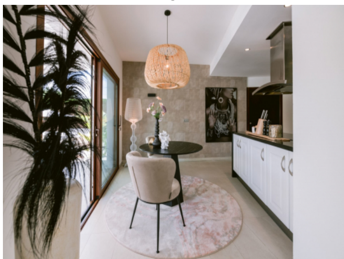
Dining area close to the kitchen