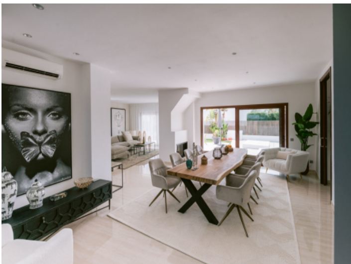
Living and dining room