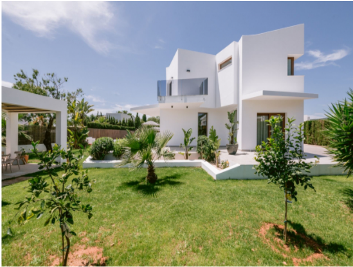
View to the villa