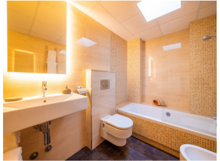
One of 4 bathrooms