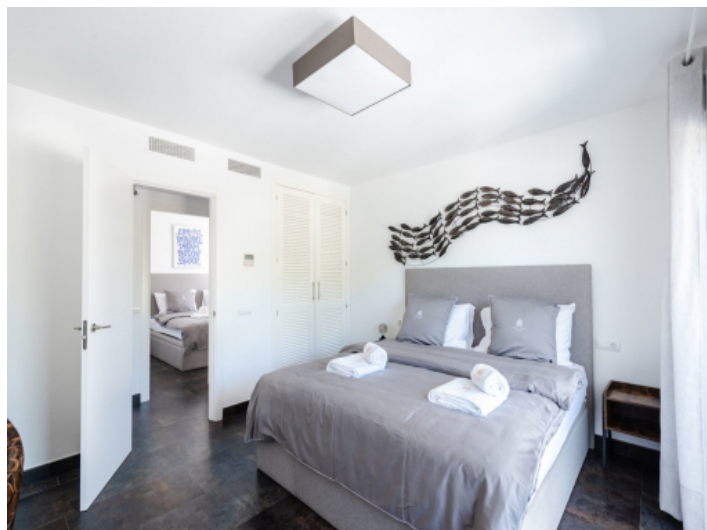
On eof 5 bedrooms