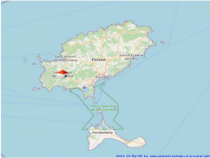
Sant Josep de sa Talaia