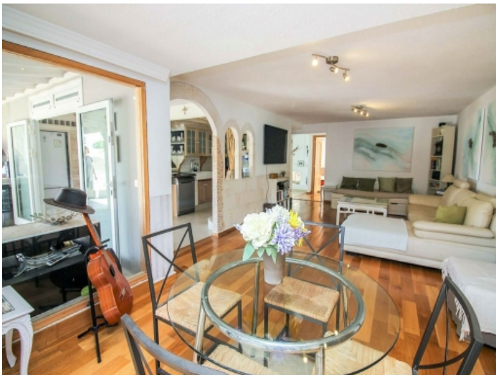
Cozy living and dining area