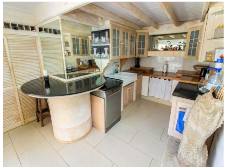
Kitchen with wooden fronts