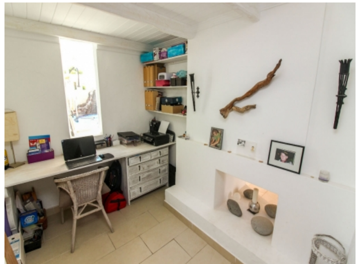
Bright study room