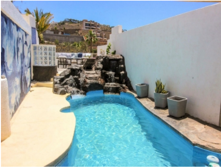
Private pool with small waterfall