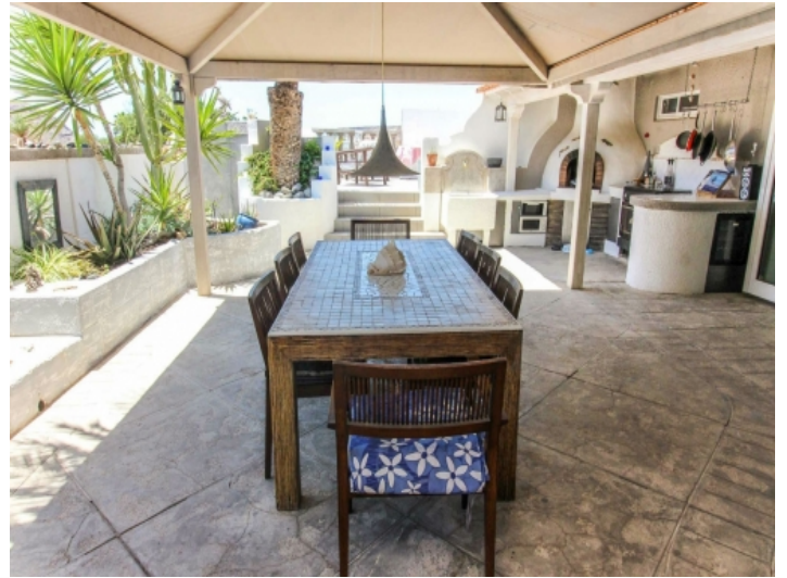
Covered terrace with barbecue area