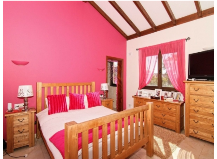
Bedroom with bathroom en-suite