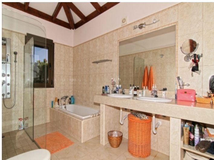
One out of 3 bathrooms