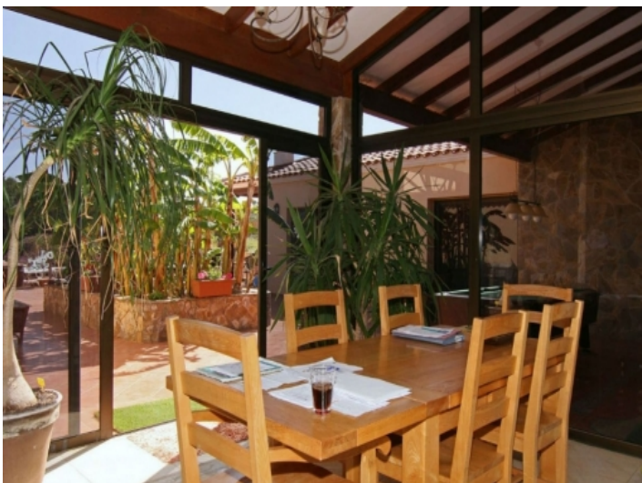
Separate dining area