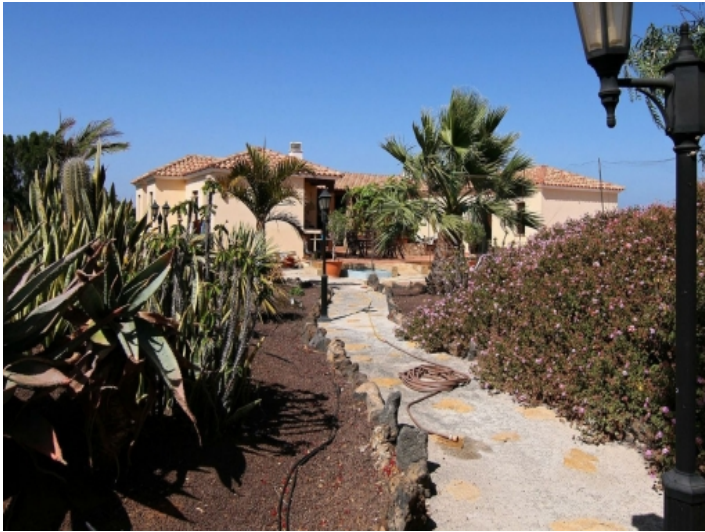
Front view of the property