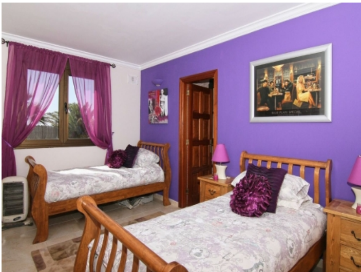
Bedroom with two single beds