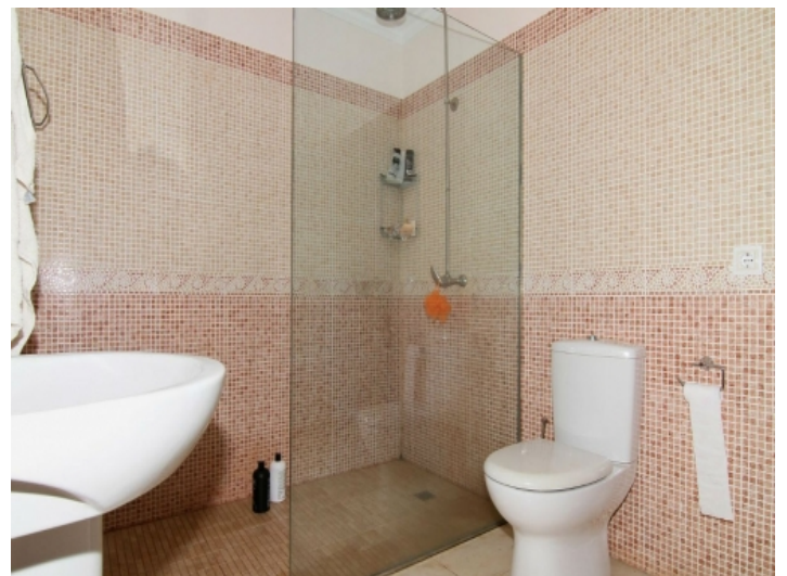
One out of 3 bathrooms