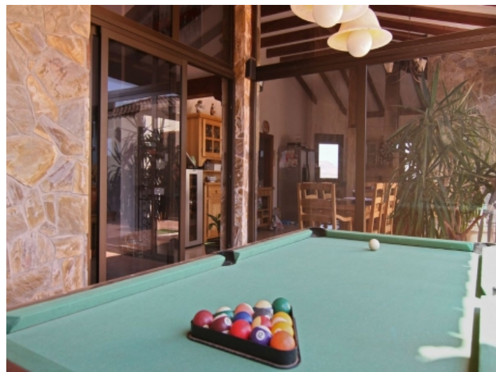
Terrace with billard table