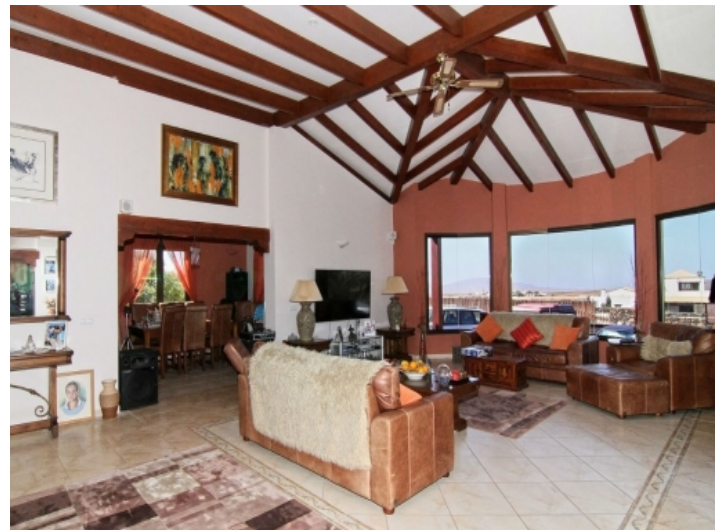
Living area and access to the dining area