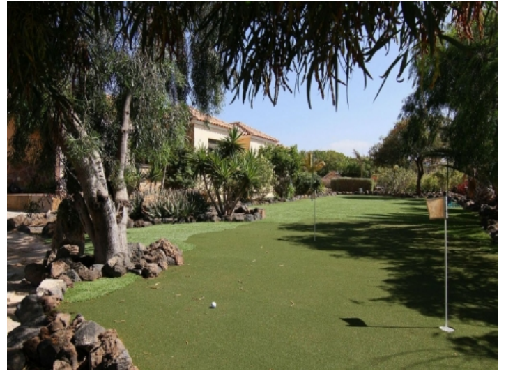
Private golf court