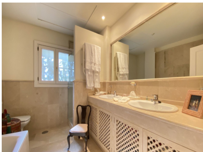
Full equipped bathroom