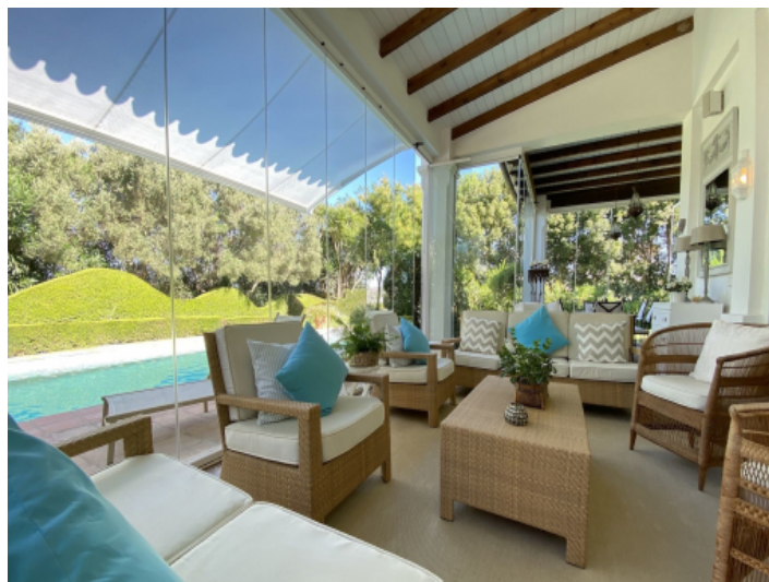
Enjoy Sotogrande lifestyle