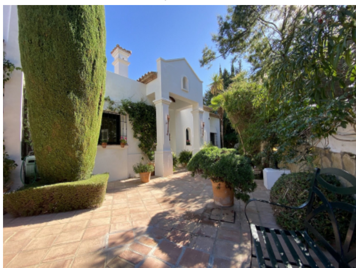
Front garden in Moorish style