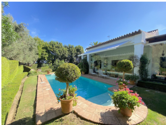
View of this lovely villa