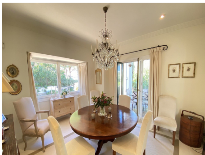
Separate dining area