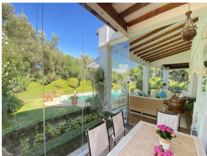
Beautiful porched terrace