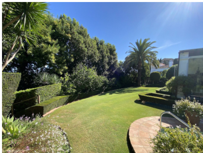
Garden in excellent condition