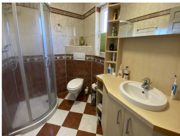
One of 5 bathrooms