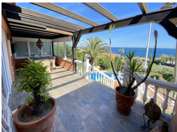
Partially covered terrace