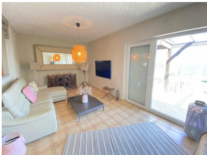
Living area with access to a terrace