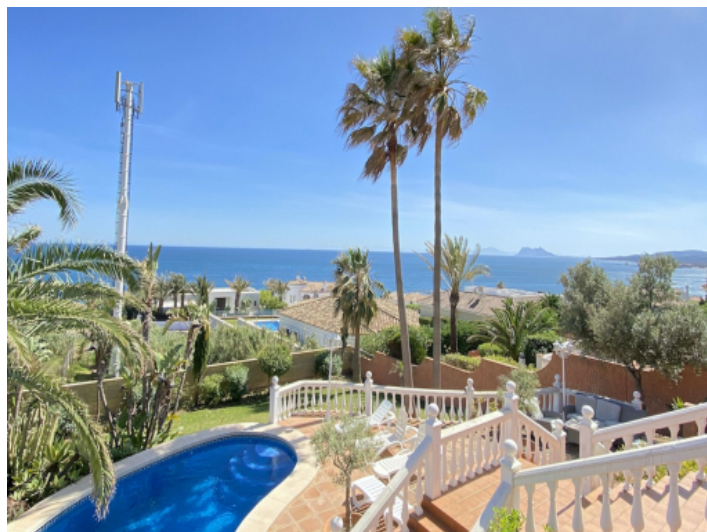
Beautiful pool area