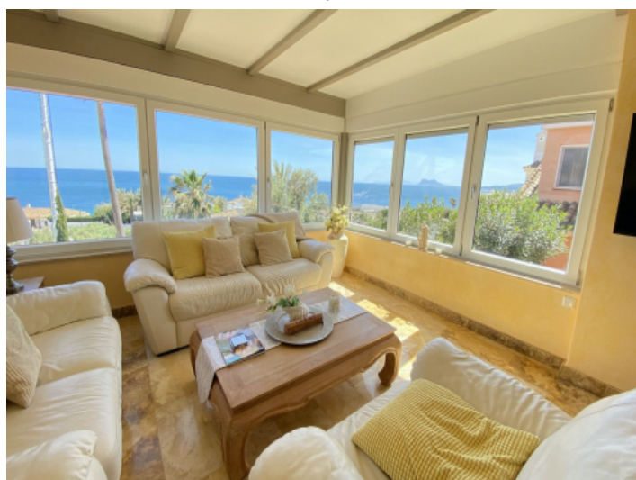
Bright living area