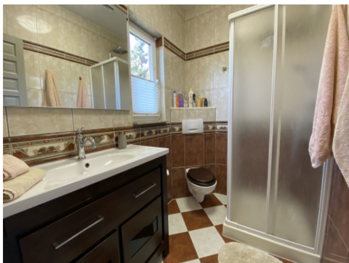
One of 5 bathrooms