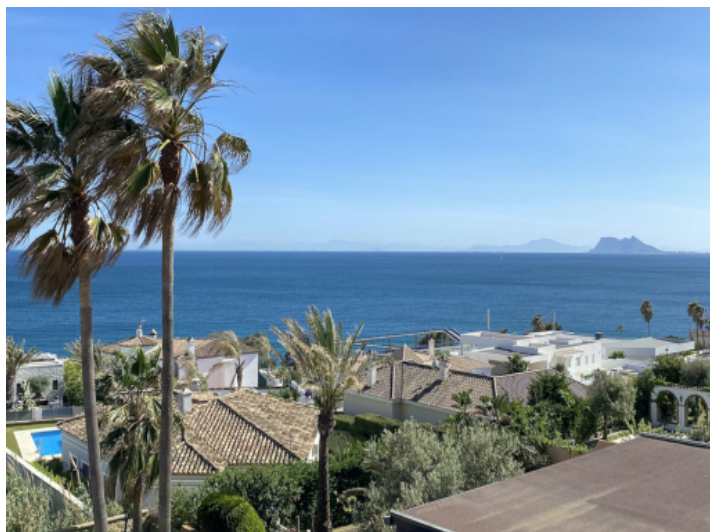
Fantastic sea views