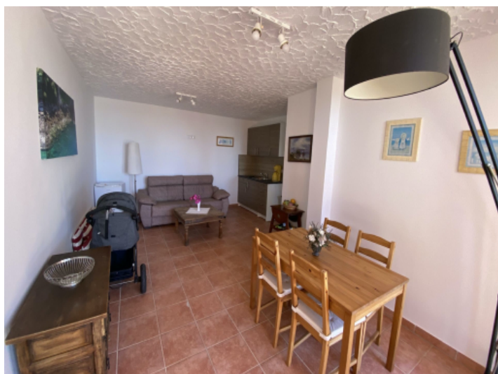
Living and dining area with a kitchenette