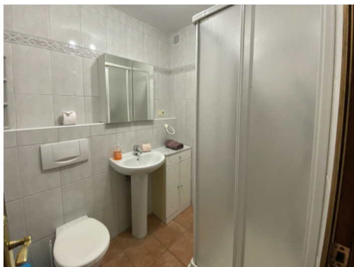
One of 5 bathrooms