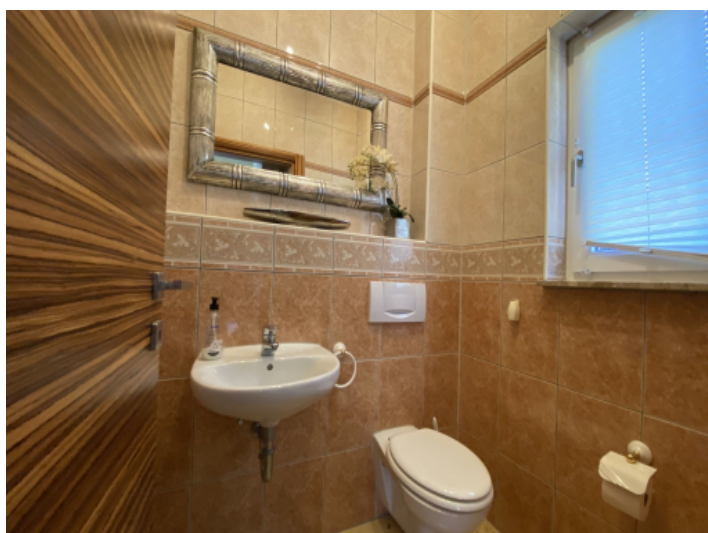
One of 5 bathrooms