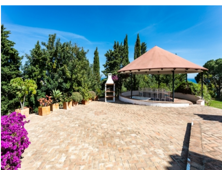
Spacious outdoor area with pavilion and sea views