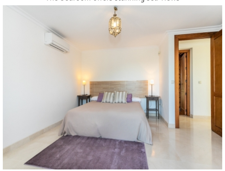
Another comfortable bedroom