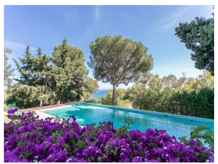
Pool area with impressive sea views