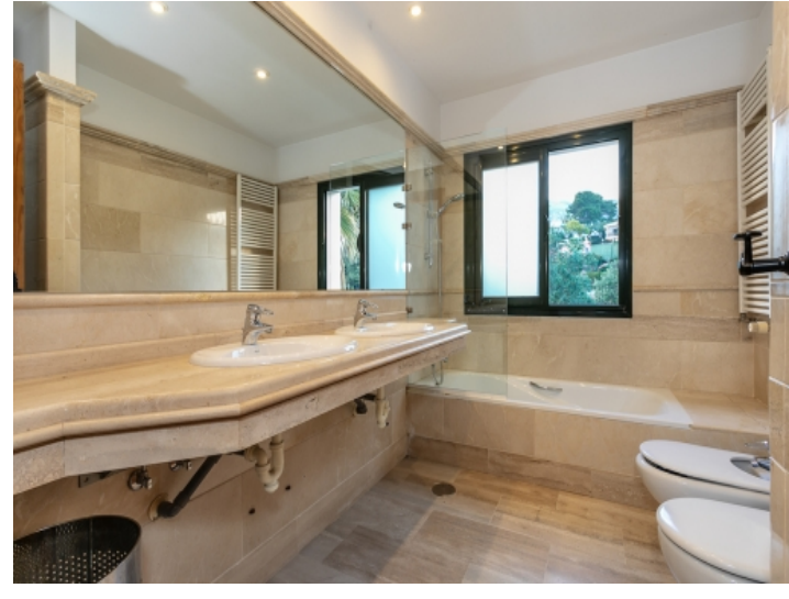
Another bathroom with bathtub