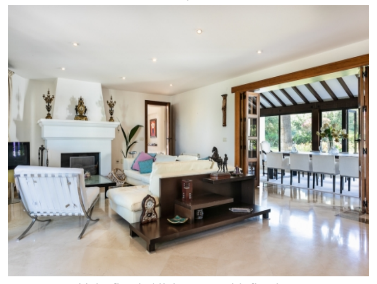
Light-flooded living area with fireplace