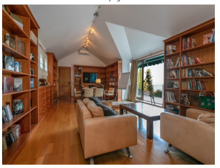
Reading room with access to the terrace