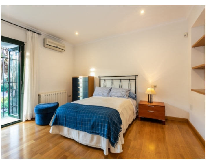
Bedroom with french balcony