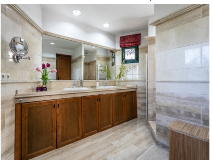
Bathroom with daylight and shower