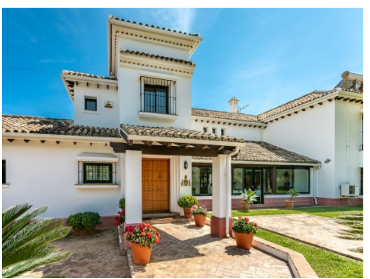
Front view and entrance area of the villa