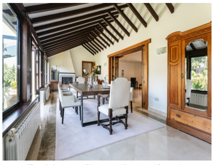
The dining area offers space for up to 10 people