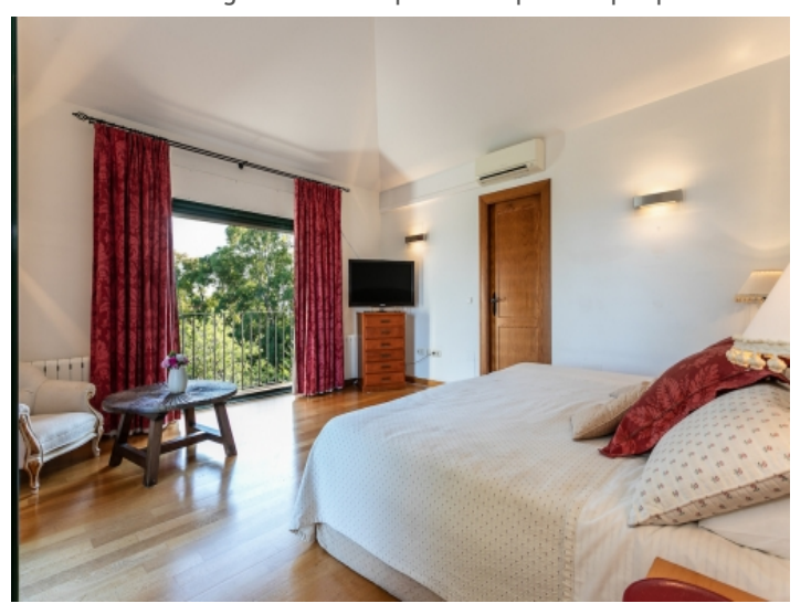
Cosy bedroom with double bed