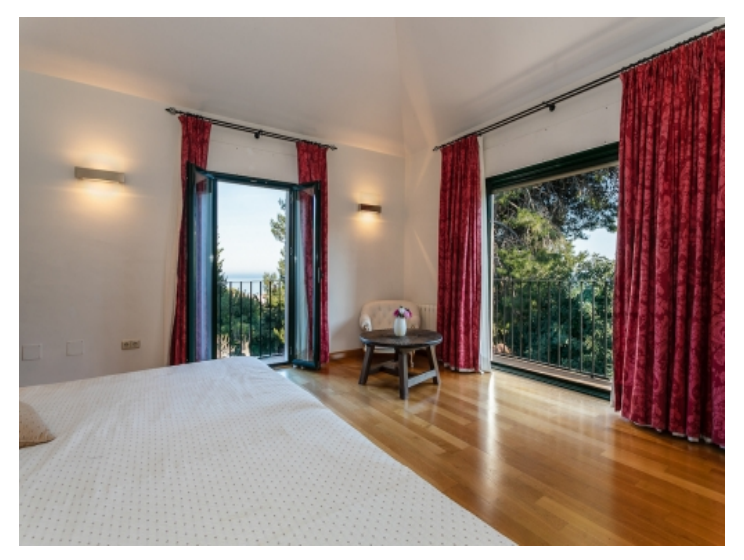
The bedroom offers stunning sea views