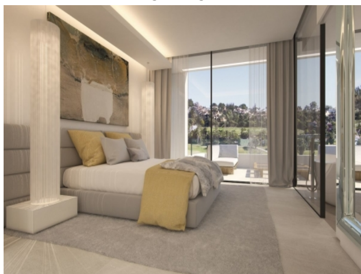
Elegant master bedroom