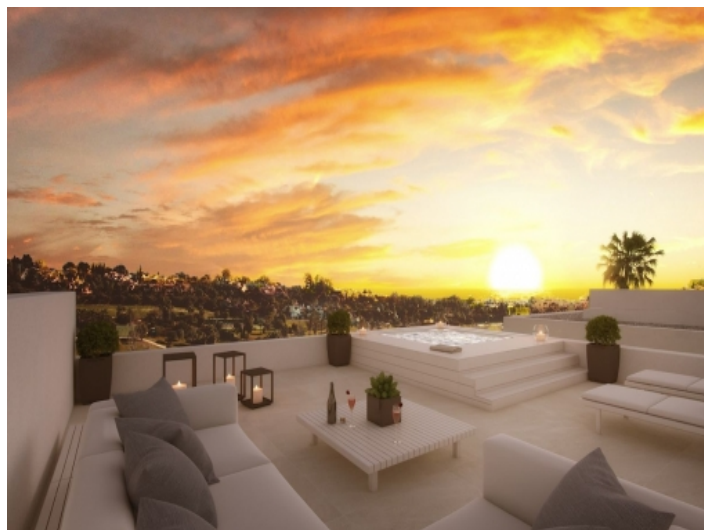
Roof top terrace at night