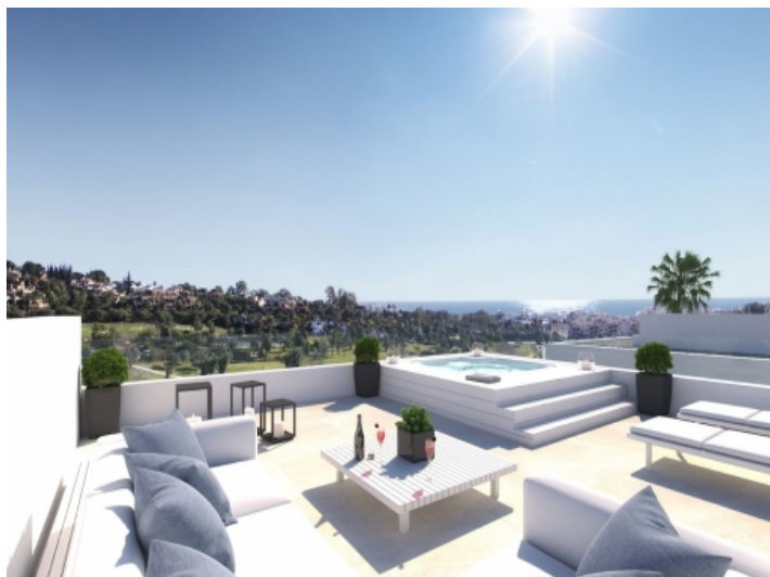
Impressive views of the roof top terrace