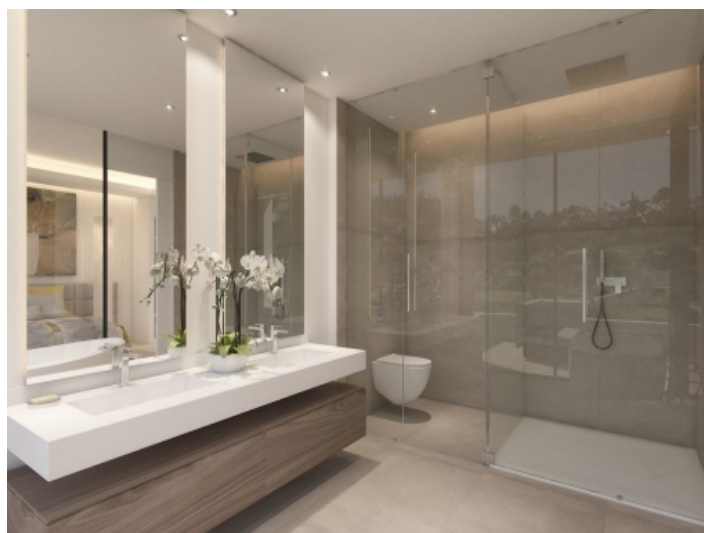
Bathroom with walk-in shower