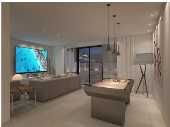
Seperate games room