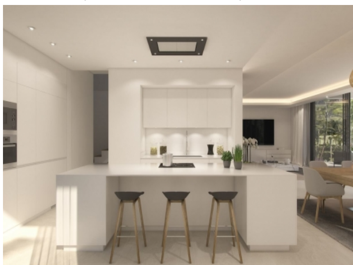
Modern, fully equipped kitchen