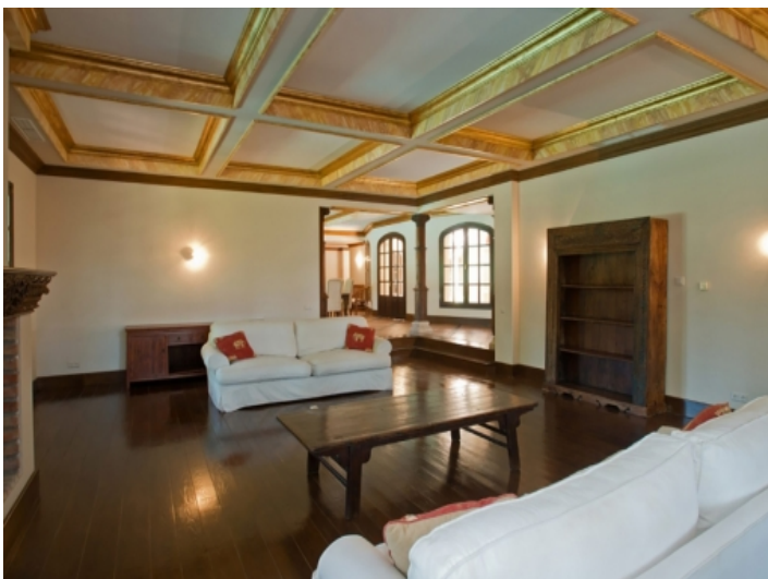
Cosy living area with wooden table