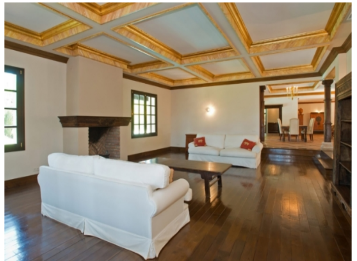
Alternative views with wooden flooring and cupboard