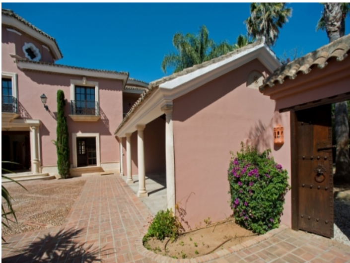
Court with access to the garden