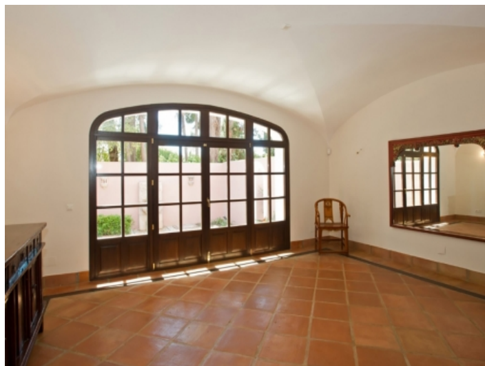
Living area with large mirror