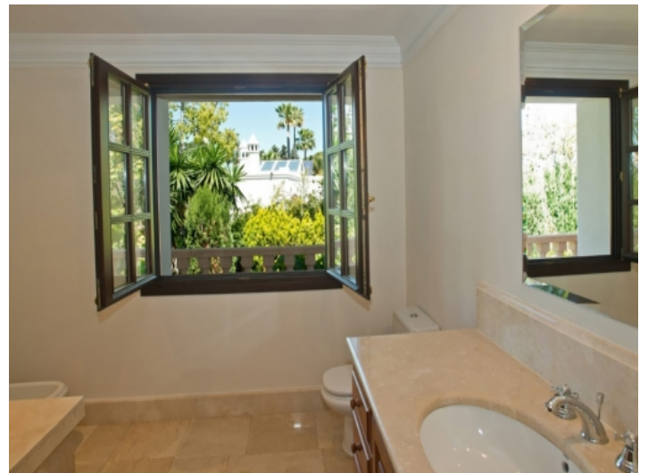
Bathroom with marble elements