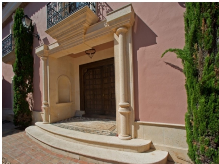
Main entrance with wooden door