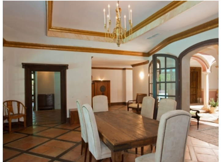
Dining area with chandelier