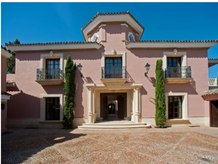
Villa offers many beautiful windows