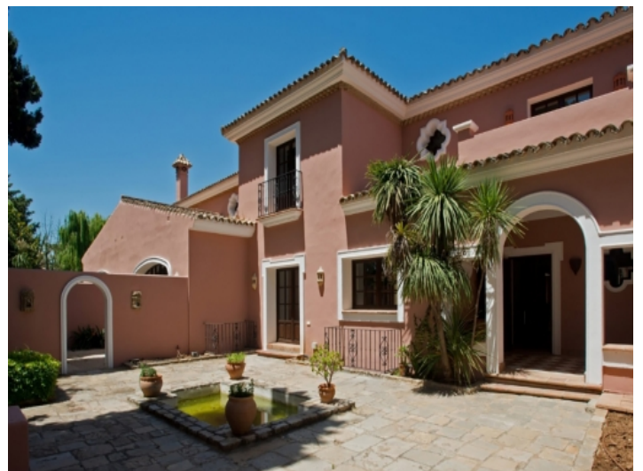
Garden with pond