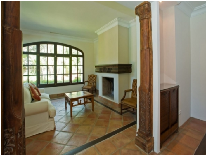
Lounge with fire place and couch