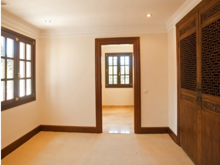
Alternative views of the living area