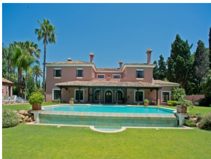
Pool area with garden