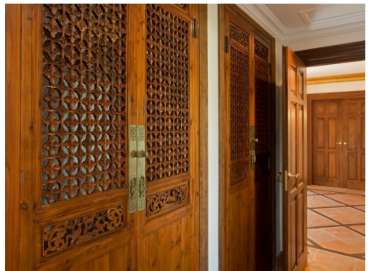
Corridor with access to the living areas