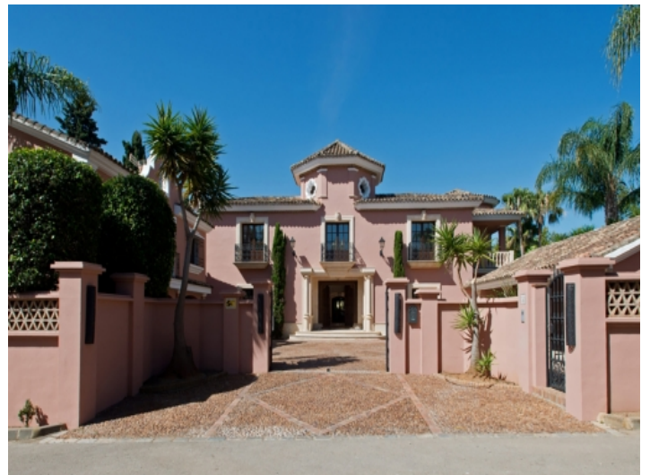
Alternative street views with entry