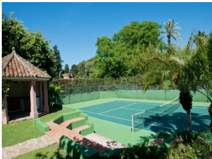
Tennis court with bench