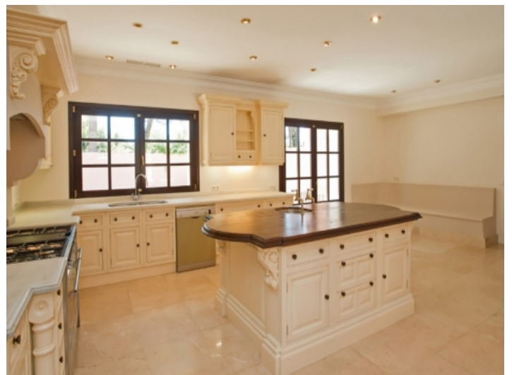
Kitchen with gas stove