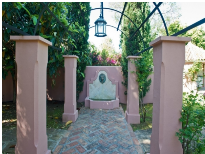
Footpath with fountain