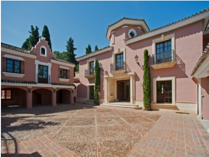
Wonderful villa with pool area in Guadalmina baja