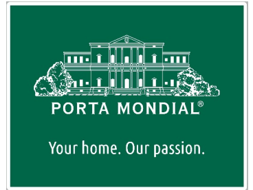
House views with balcony