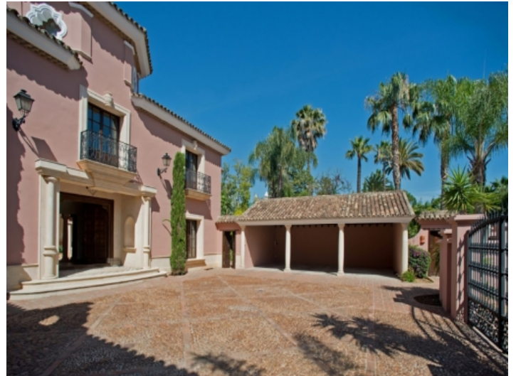
Court with garage