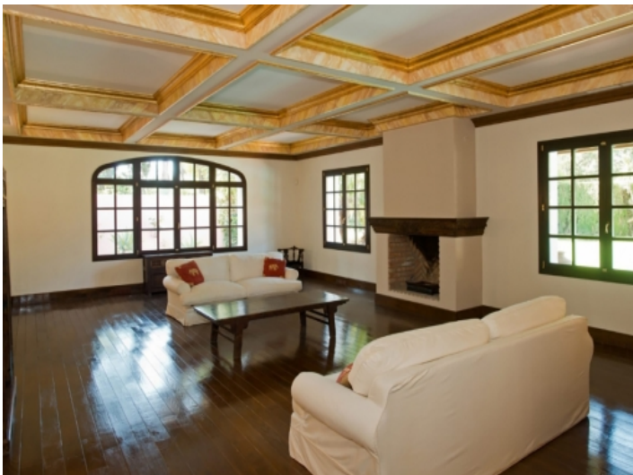
Living area with chimney