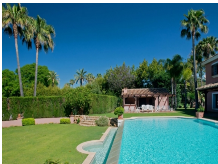
Pool area with access to the garden house