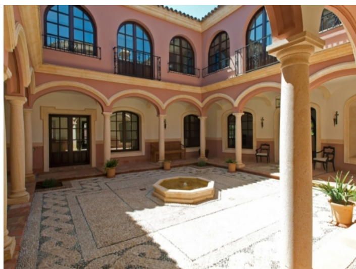
Patio with fountain