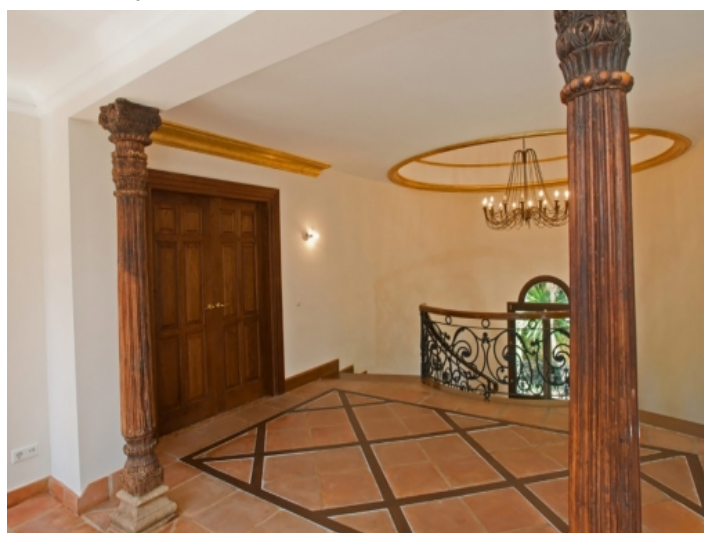
Wooden beams with access to the living areas