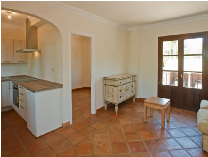
Living area with high ceiling