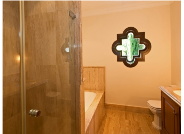
Bathroom with shower and bathtub