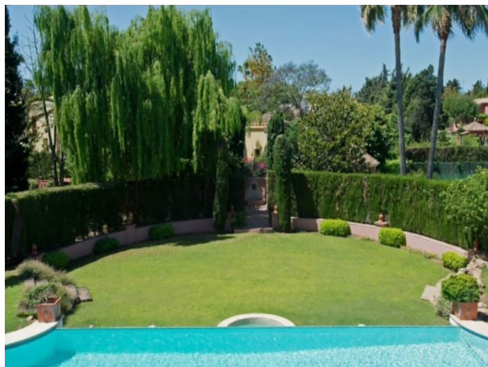
Views of the plot