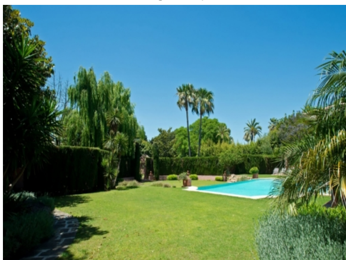
Exterior area with palms