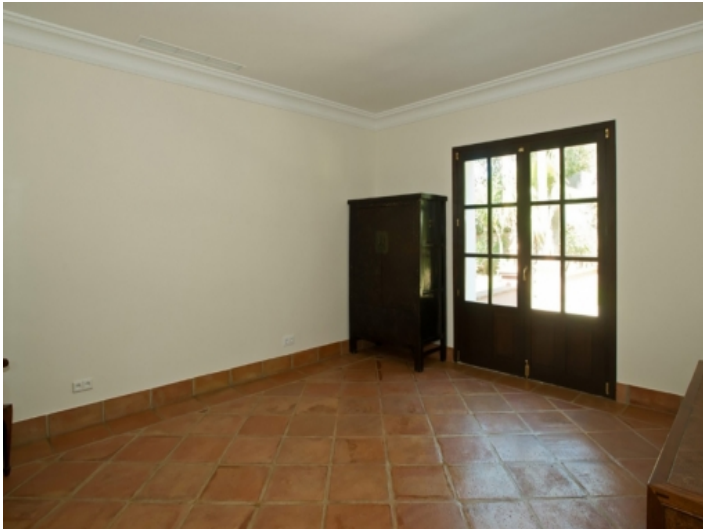
Living area with access to the garden