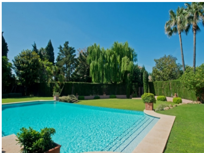
Pool edge with plants