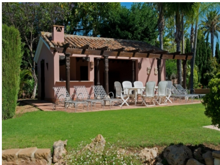
Garden house with sunbeds and wooden beams