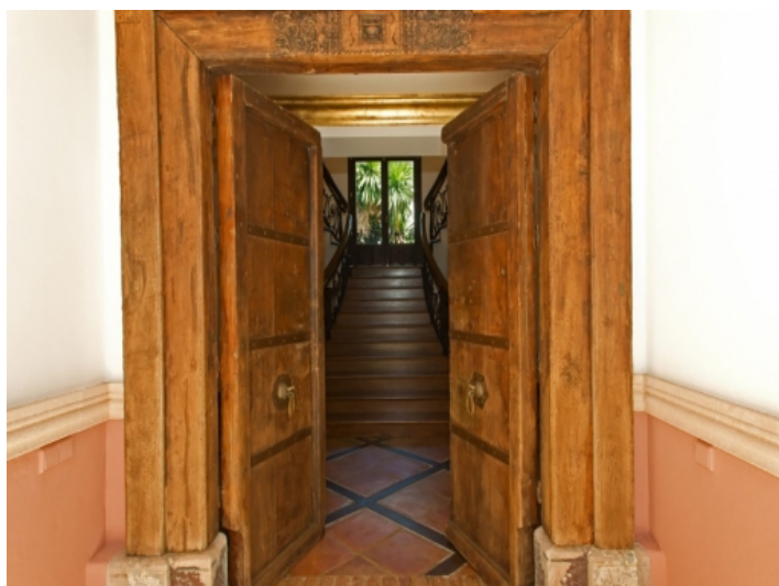
Wooden door with staircase