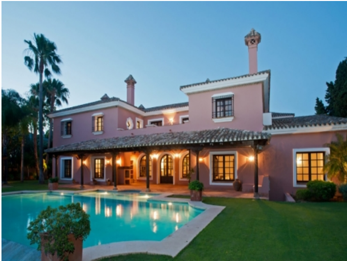
Garden house with garden furniture