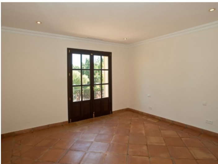
Living area with balcony