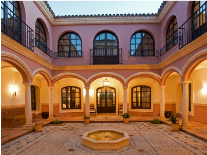
Patio with fountain