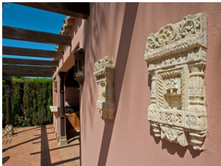
Garden house with tiled floor