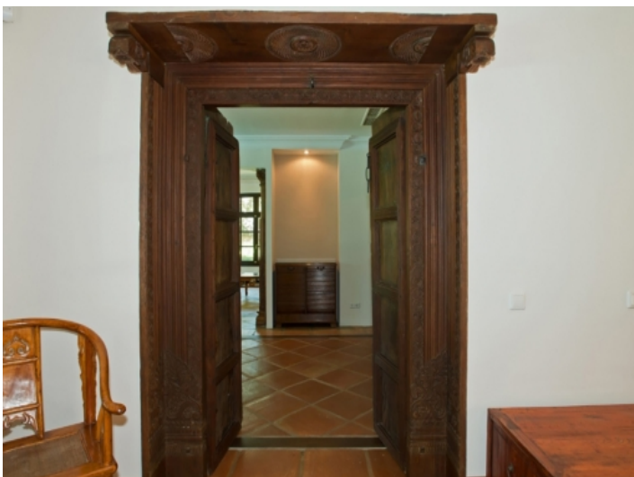
Chair with commode