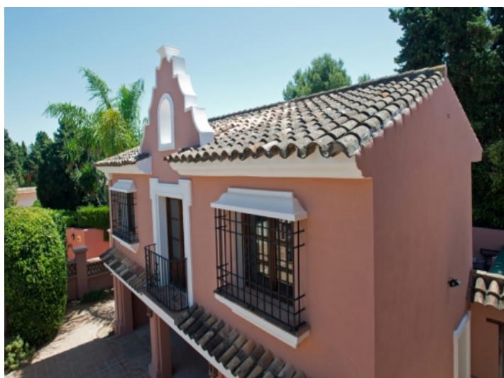
House views with balcony