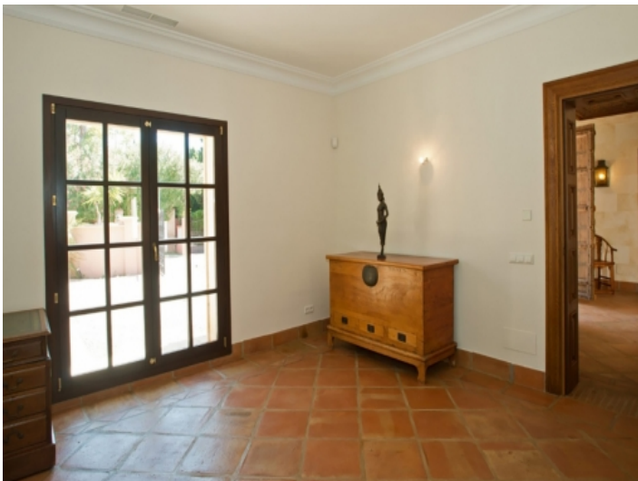
Bedroom with access to the garden