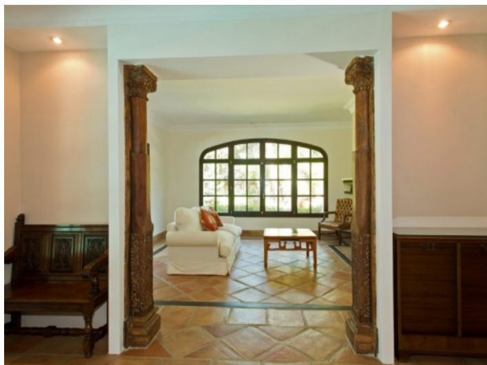
Wooden bench with access to the lounge