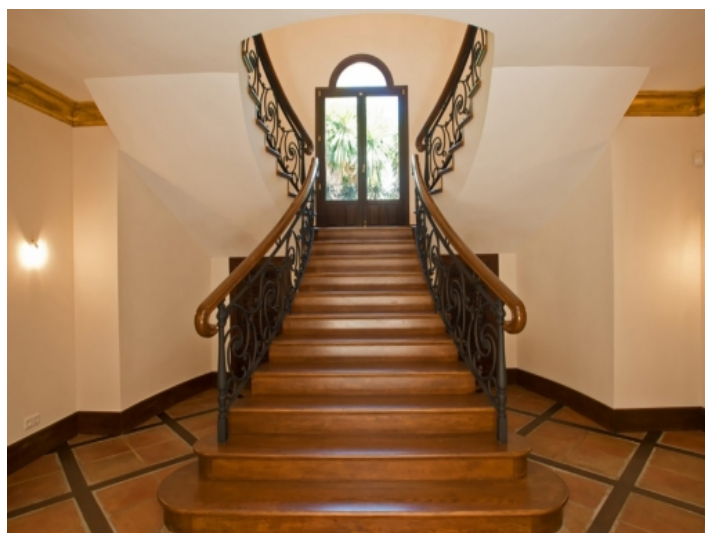
Staircase with wooden steps