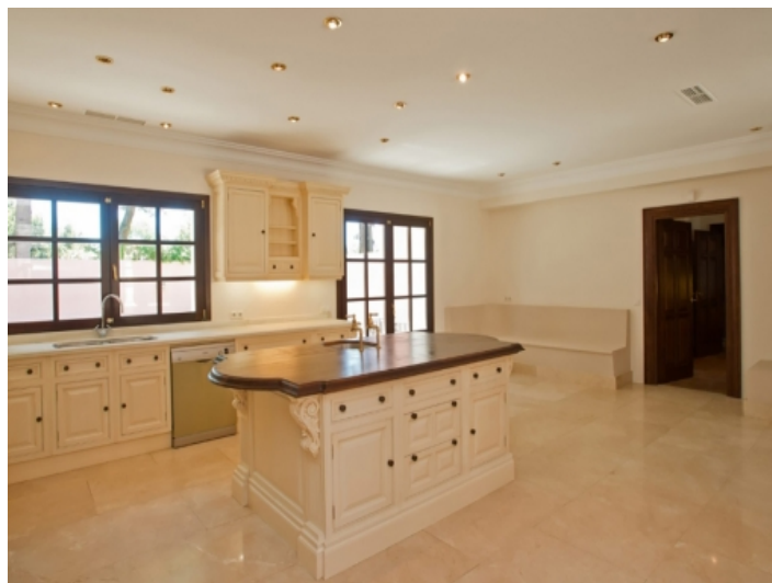
Fully fitted with new microwave and dishwasher