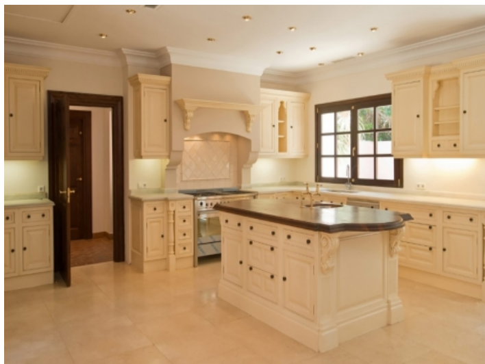
Wooden worktop with oven