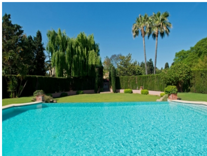
Views of the pool area with garden