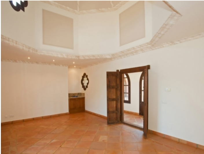
Living area with marble cover