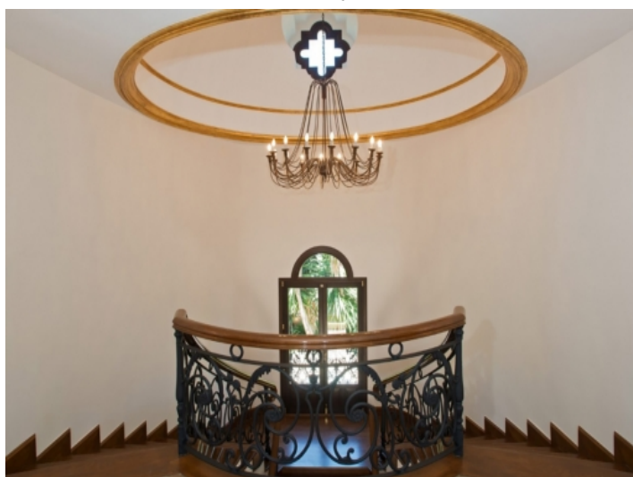
Gorgeous staircase with access to the garden