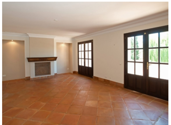
One of 2 bedroom apartments