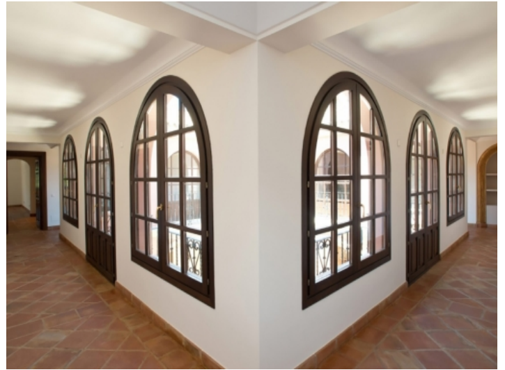
Corridor with large windows