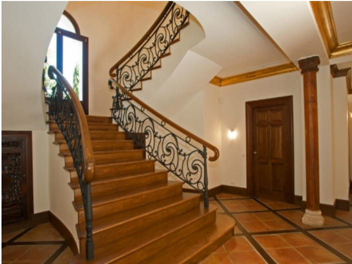
Staircase with storage room