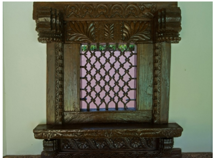
Window with traditional ornaments