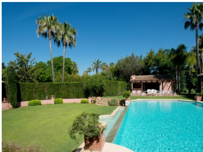
Lawn area with hedge