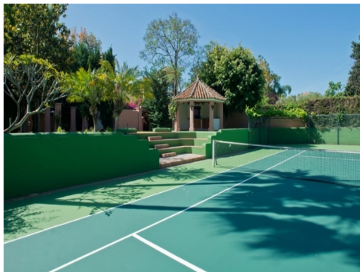
Alternative views of the tennis court