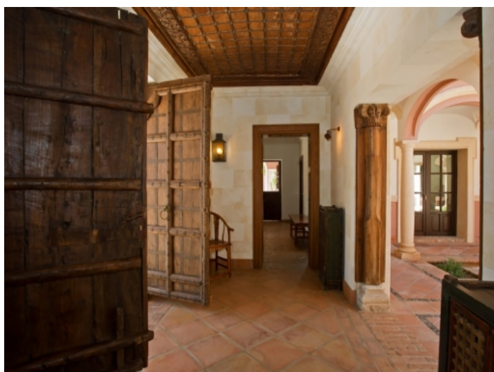
Main entrance with wooden elements