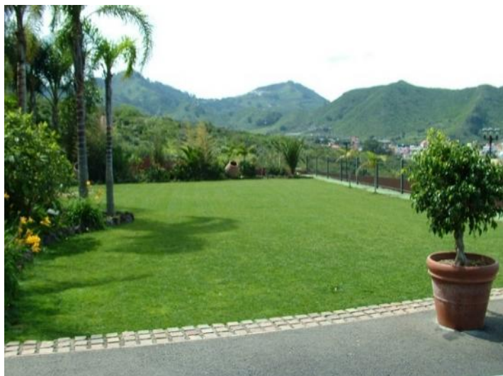
Spacious outdoor area with green space