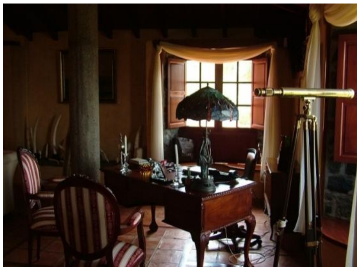
Traditional Canarian study