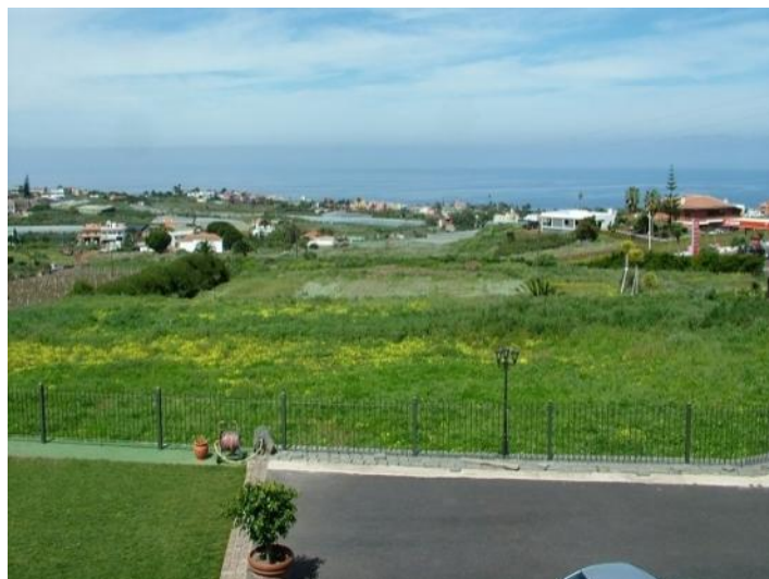
Impressive view of the sea