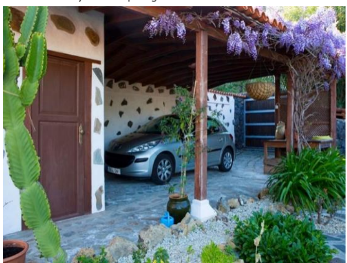
Covered parking in front of the house