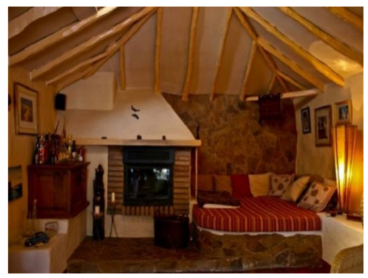
Cozy living room with fireplace