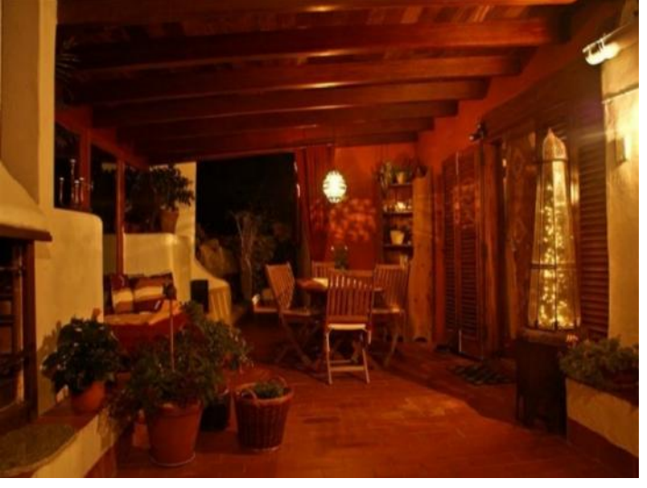
Living room in Canarian style