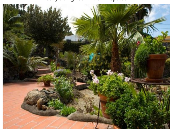
Garden with palm trees and plants