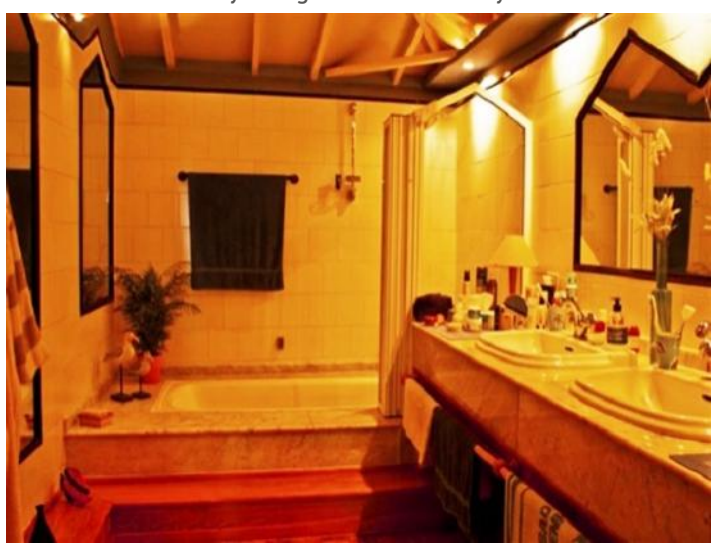
Bathroom with stylish bathtub