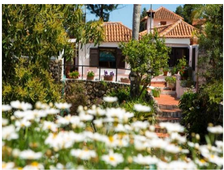
Beautifully landscaped garden with a view of the house