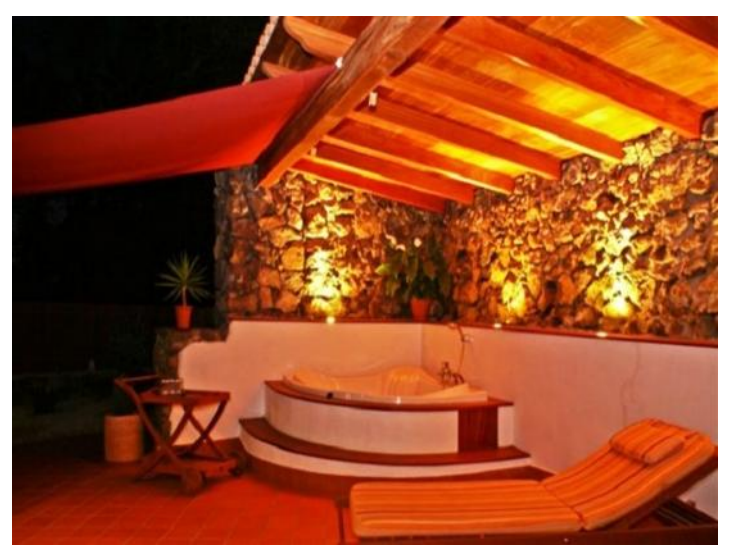
Elegant Jacuzzi on the terrace