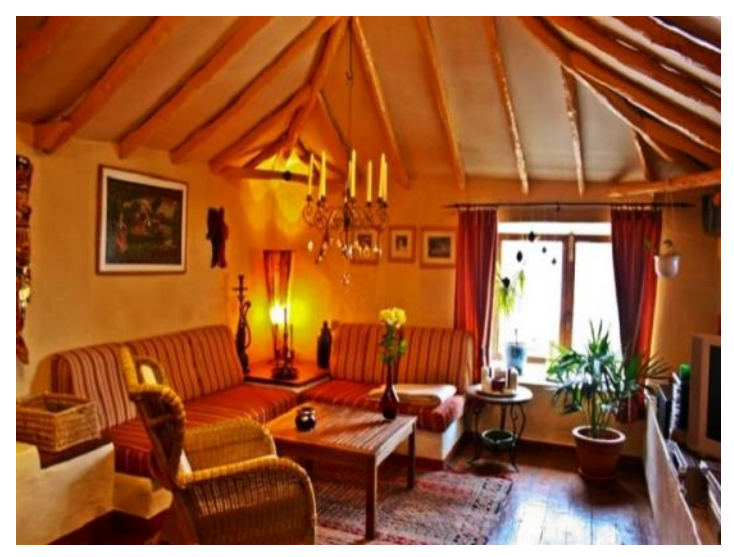
Cozy living room in rustic style