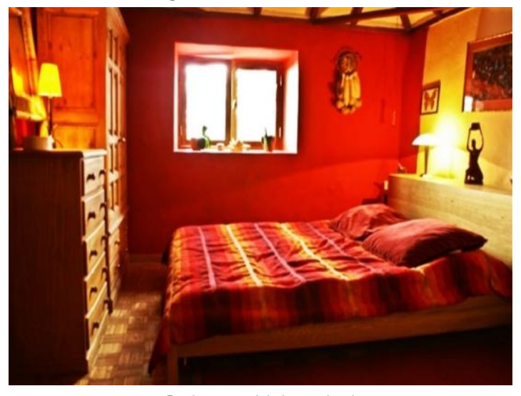
Bedroom with large bed