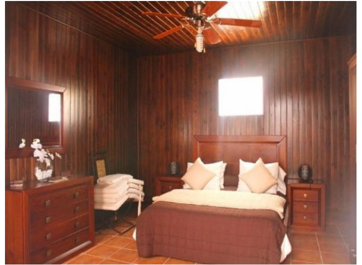
One of the romantic bedrooms