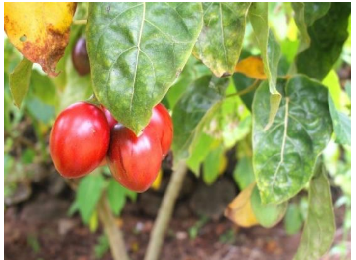
A tropical tomato tree (Tamarillo)