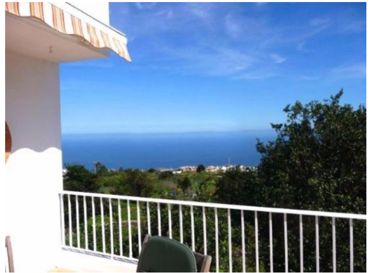
The sea view