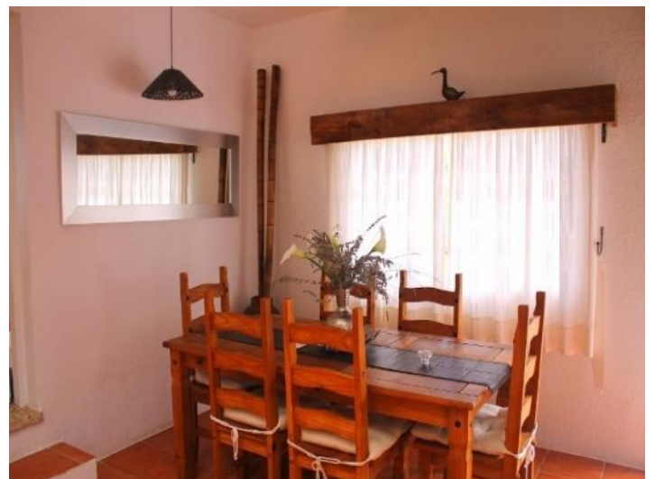
The dining table in the living room