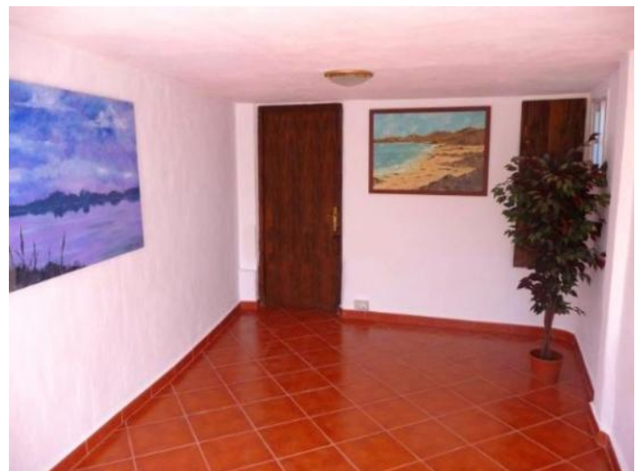
The room from another angle