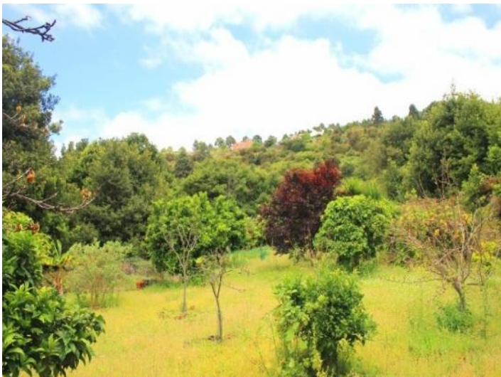
The other part of the garden with fruit trees