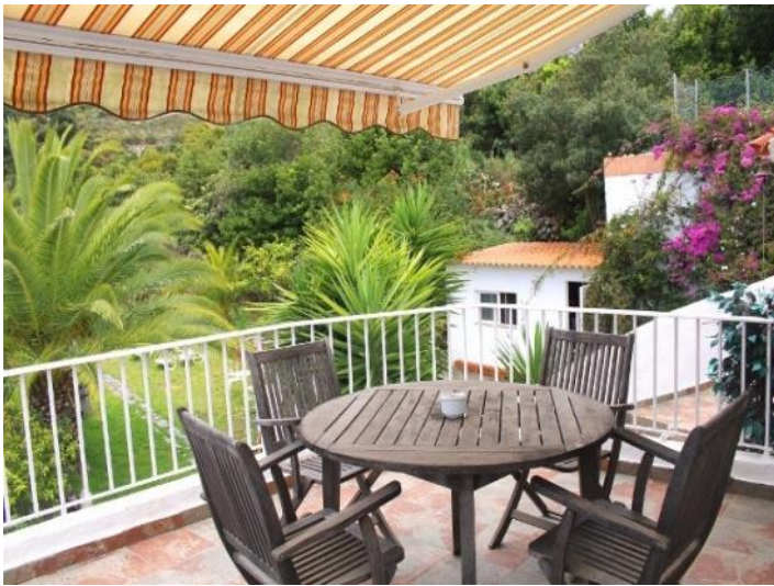
The cozy terraceThe sea view