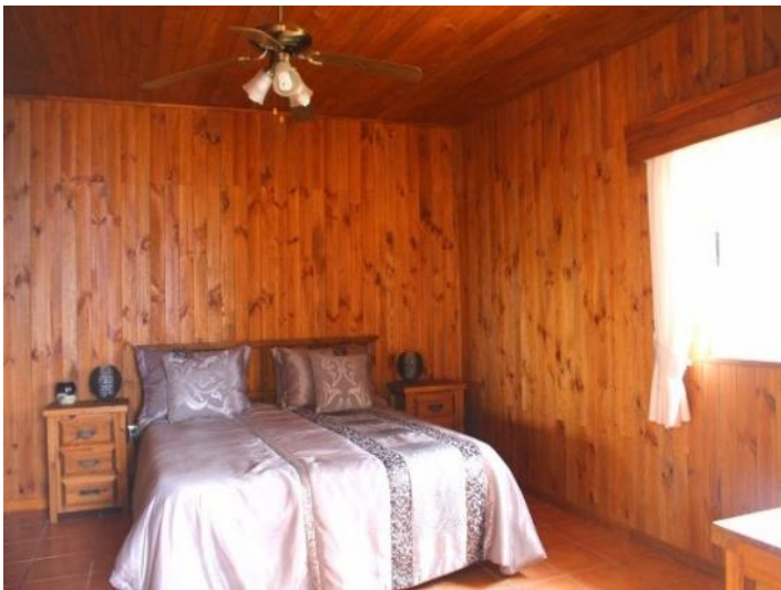
Another romantic bedroom