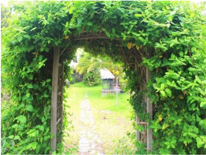
The archway in the garden