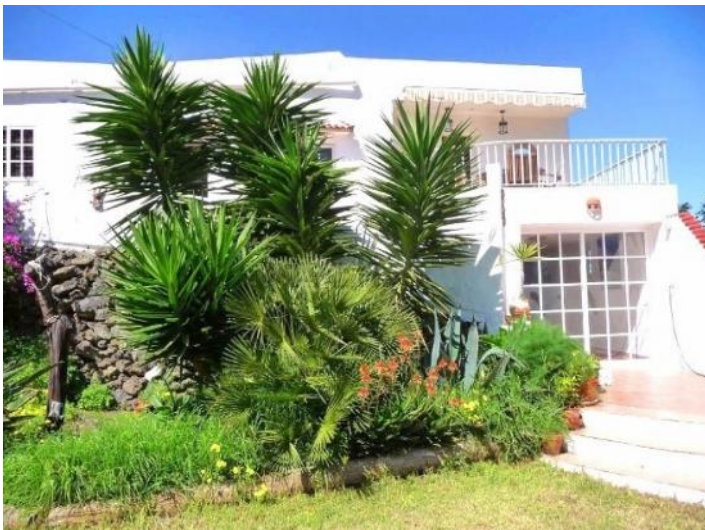
The house from the outside