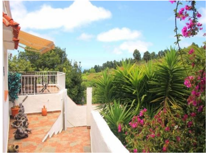
The way to the garden