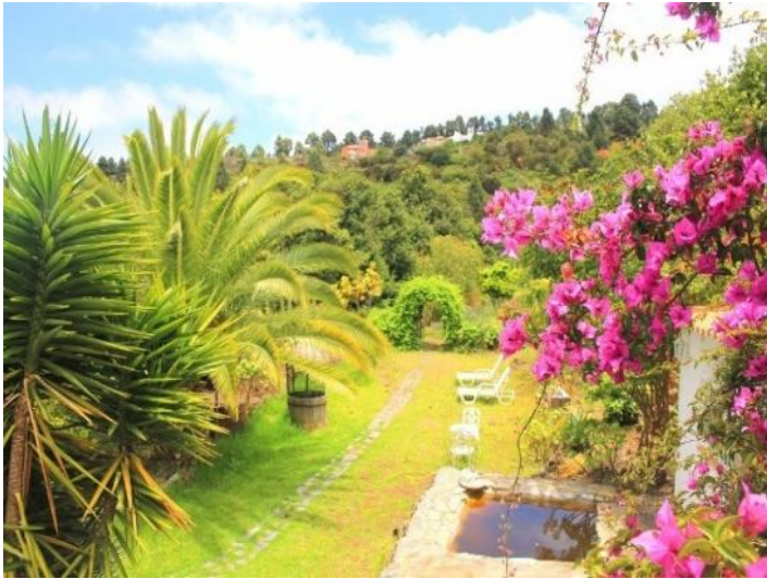
The beautiful garden