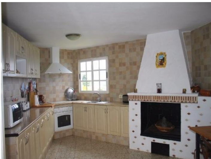
The ample kitchen