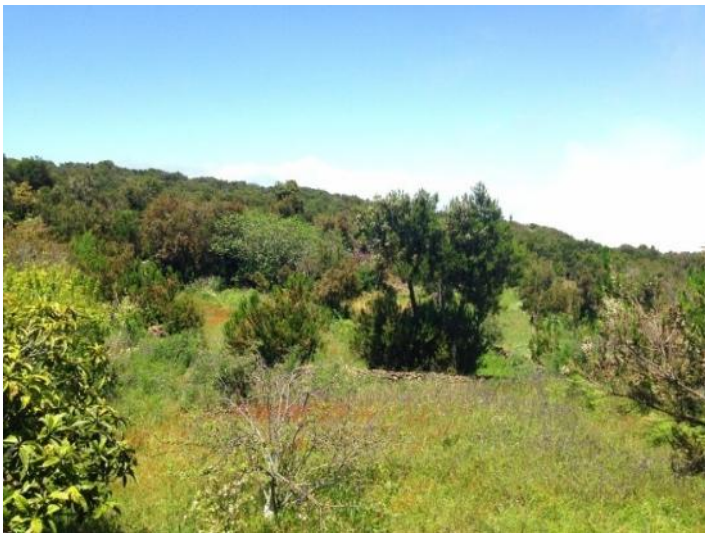
The rural garden