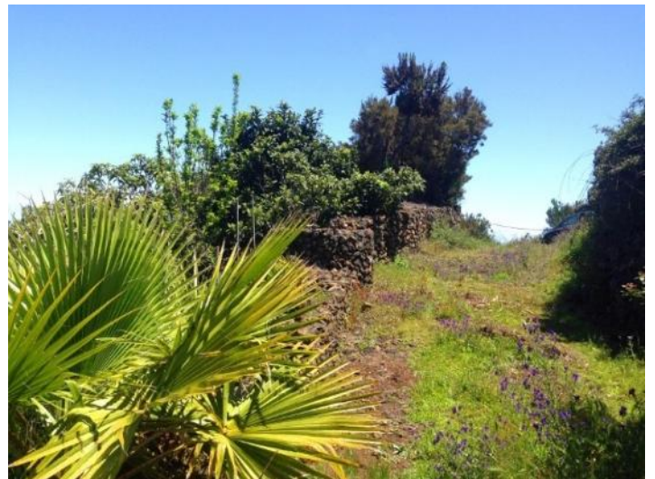
Fruit trees in the garden