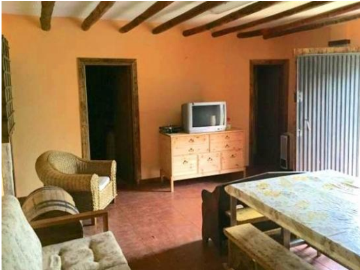
The living room