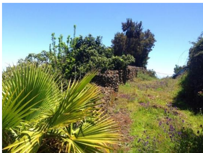
Fruit trees in the garden