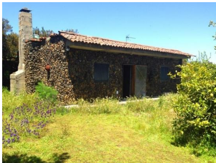
Another photo of the finca