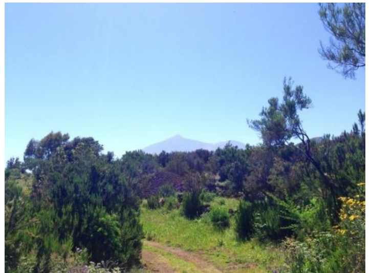
The small road