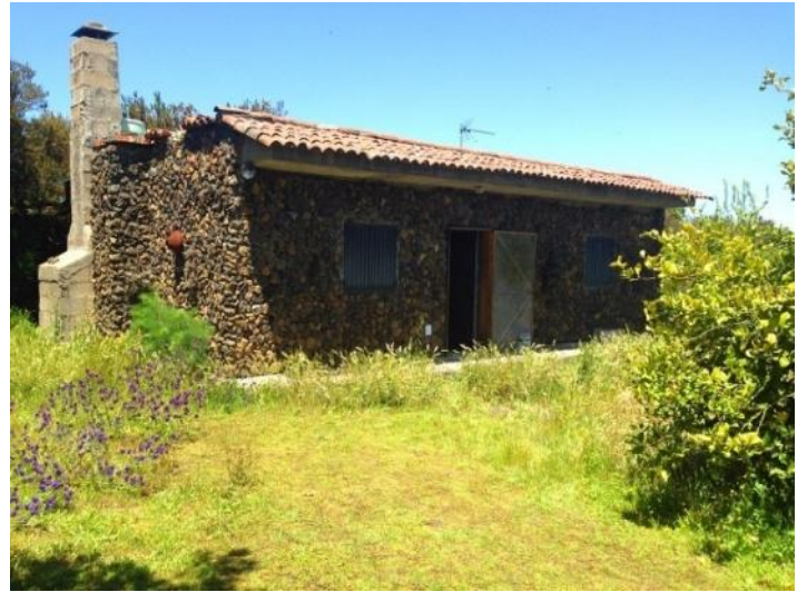
Another photo of the finca