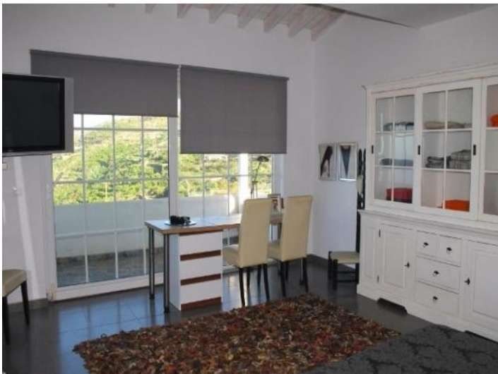
Fantastic views from the masterbedroom