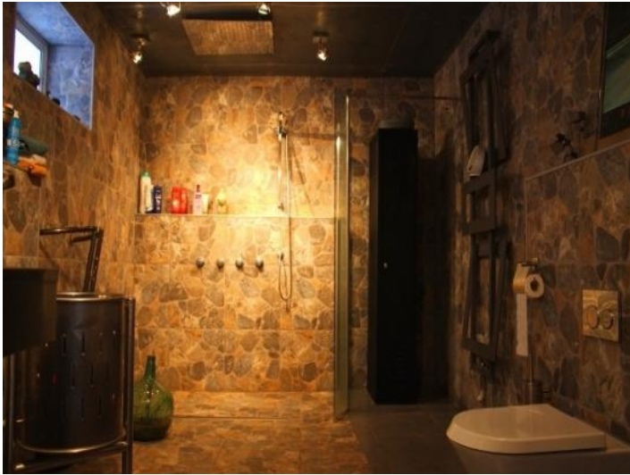
The fantastic bathroom with rainforest shower