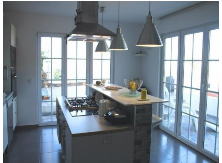
Modern kitchen with cooking island