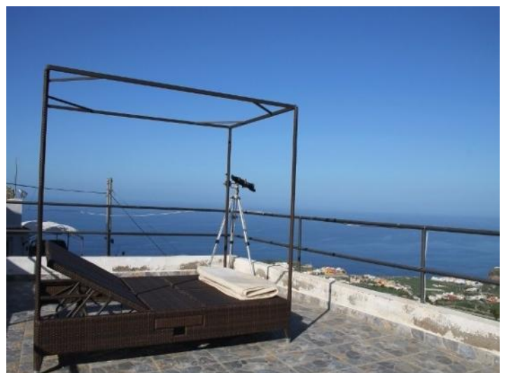
Terrace with sunbathing chairs and telescope