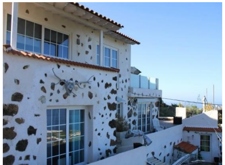
The house from the outside