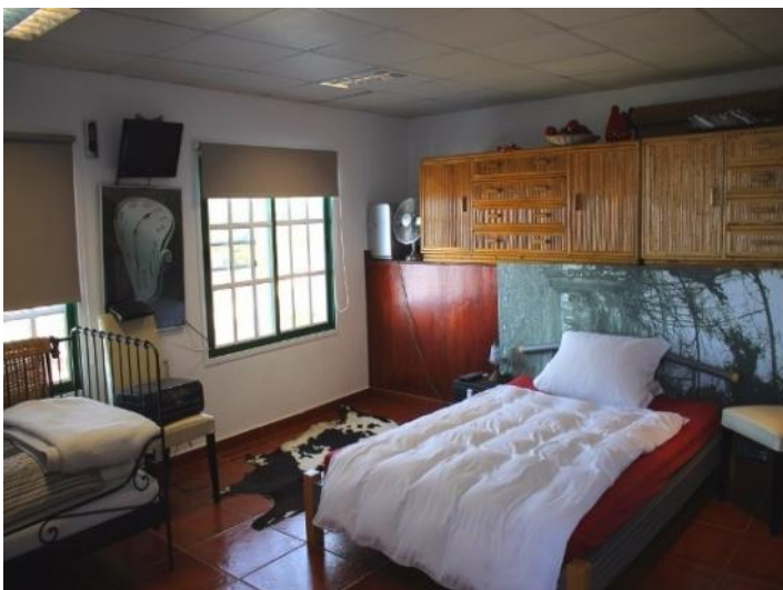
The guest apartment