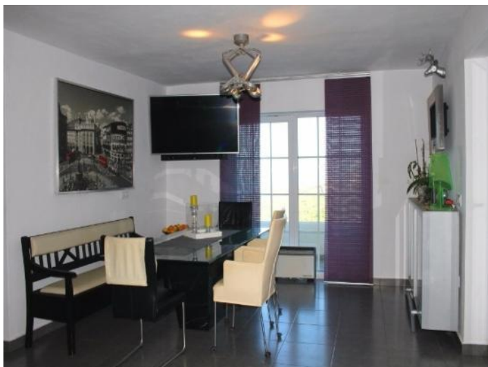
The spacious living room