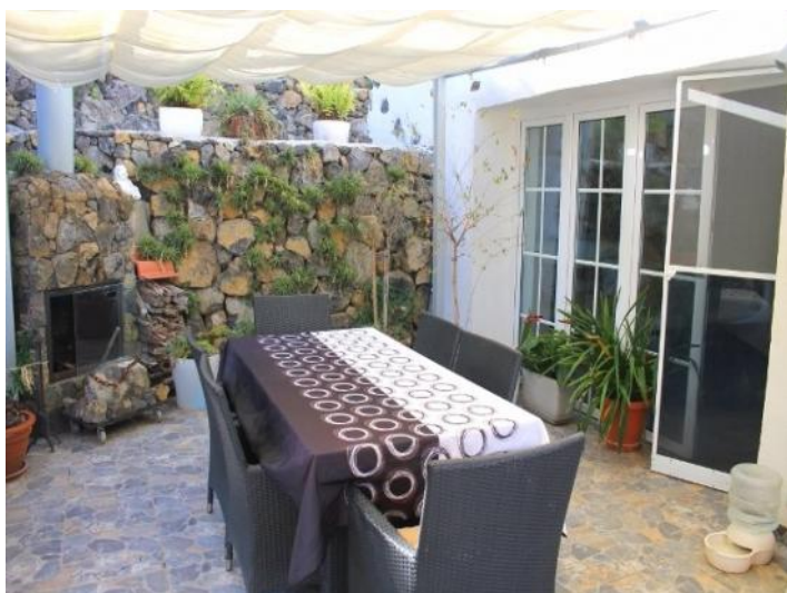
The terrace accessible from the living room