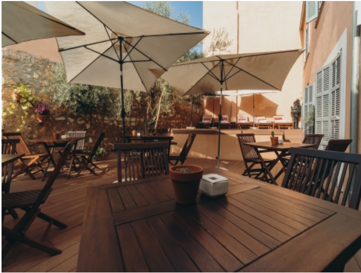
Terrace with sitting area