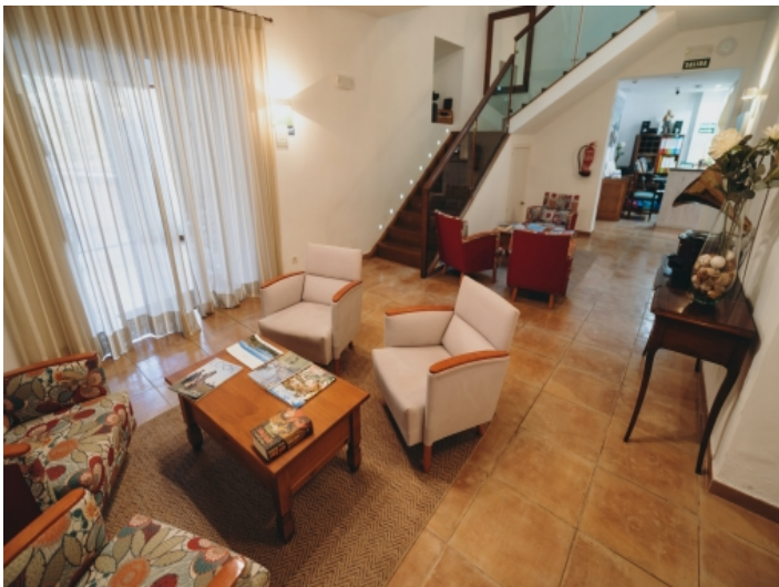
Entrance area and reception