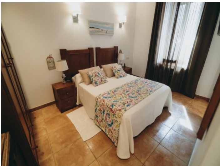
One of 8 double bedrooms