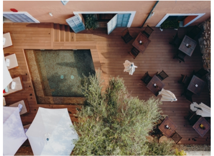
Terrace with pool and dining area