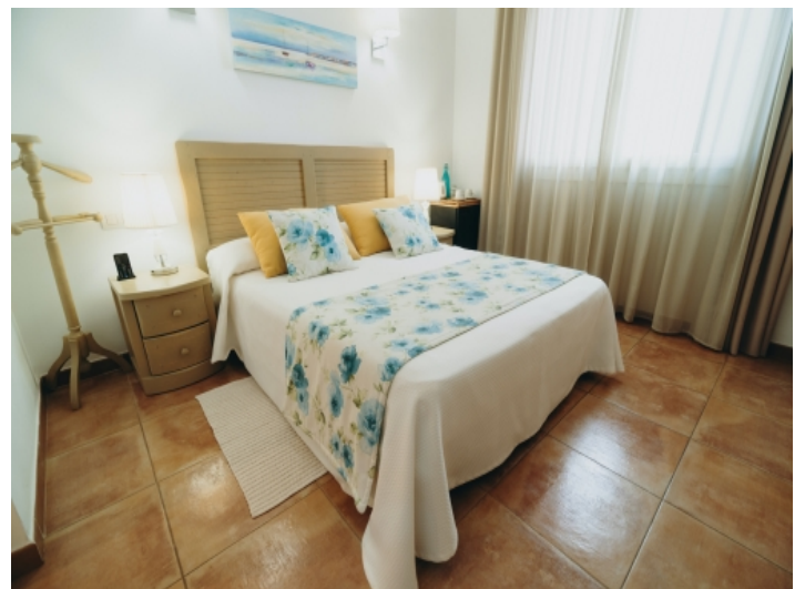
Eines von 8 Doppelzimmern