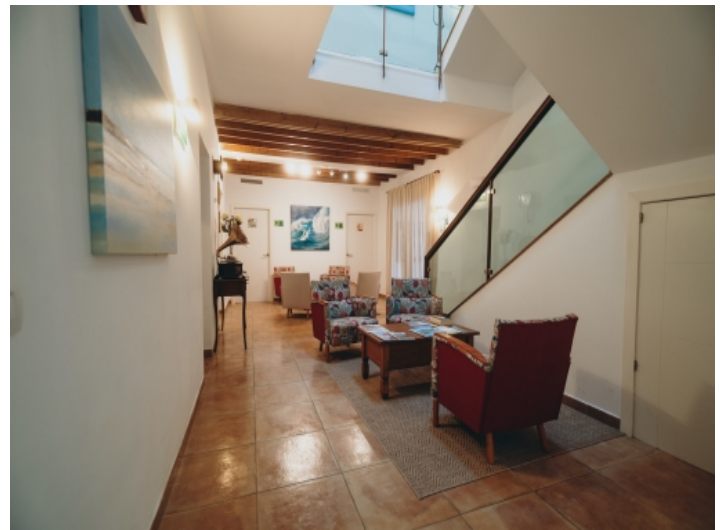
View of the entrance are