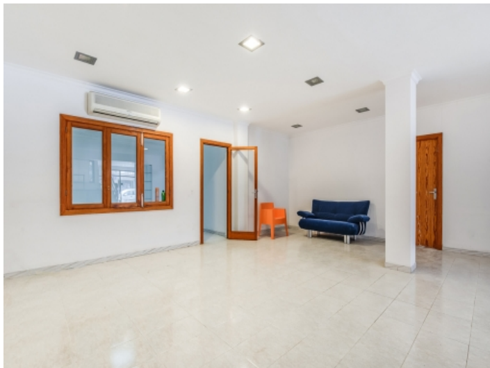
Access to a further room