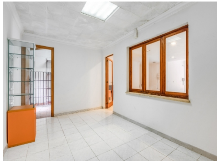
Further room and storage