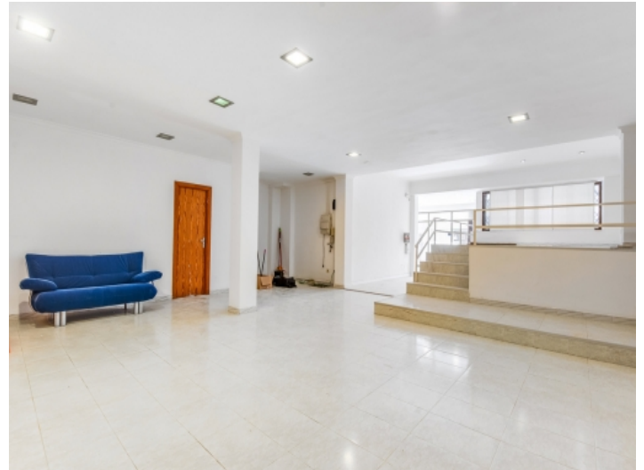
100 sqm surface