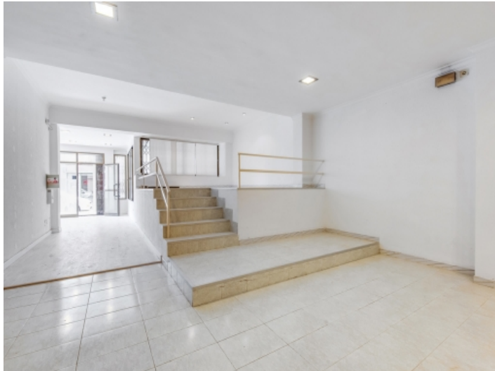
Entrance and interior view