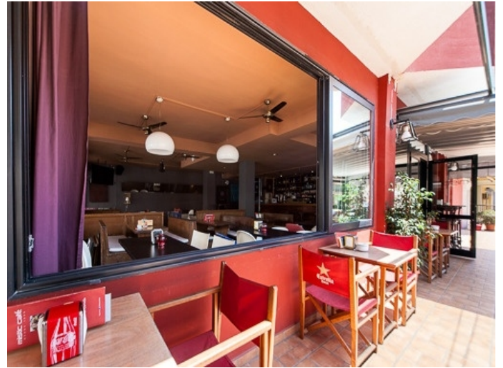
Views from the terrace to the inside area