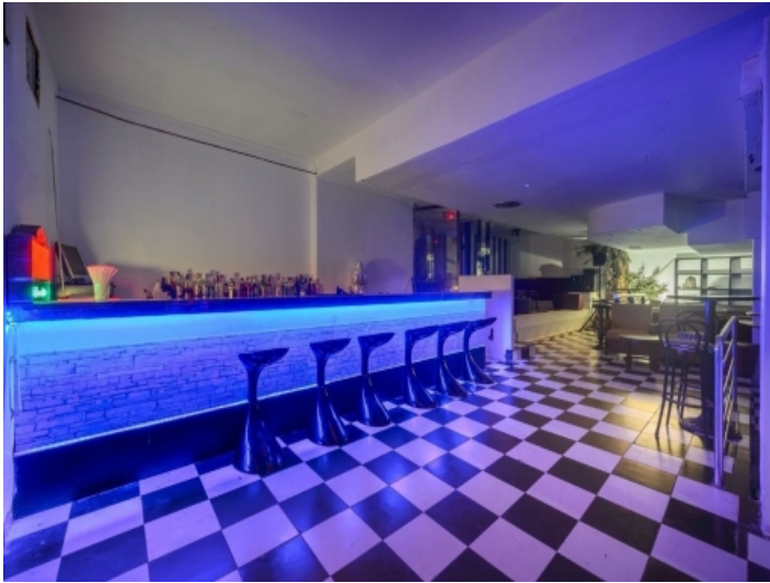
One of 3 bars