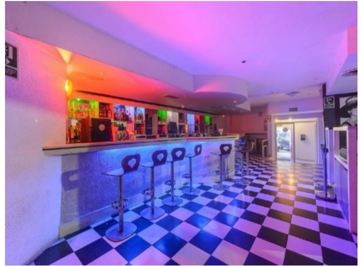
One of 3 bars