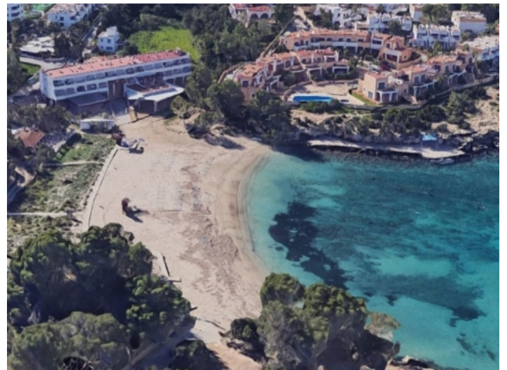
View of the beach