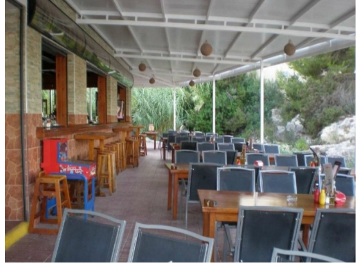
Covered dining area