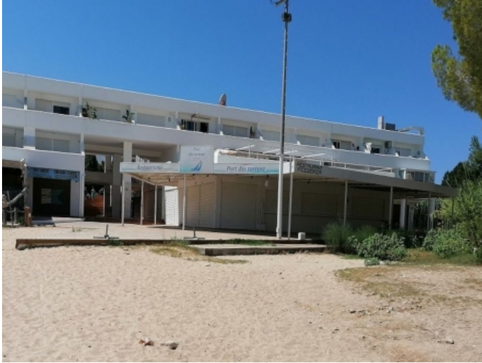
Exterior view of the restaurant