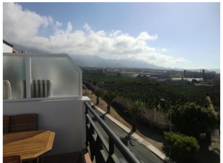
View of the roof terrace to the mountains