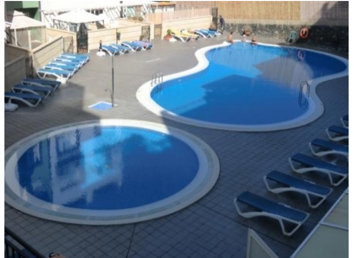
Large communal swimming pool offers plenty of space to