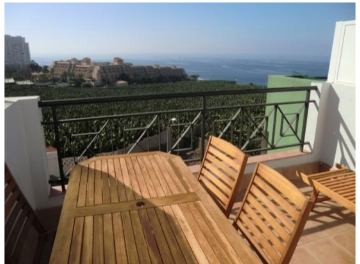
Terrace with wonderful view