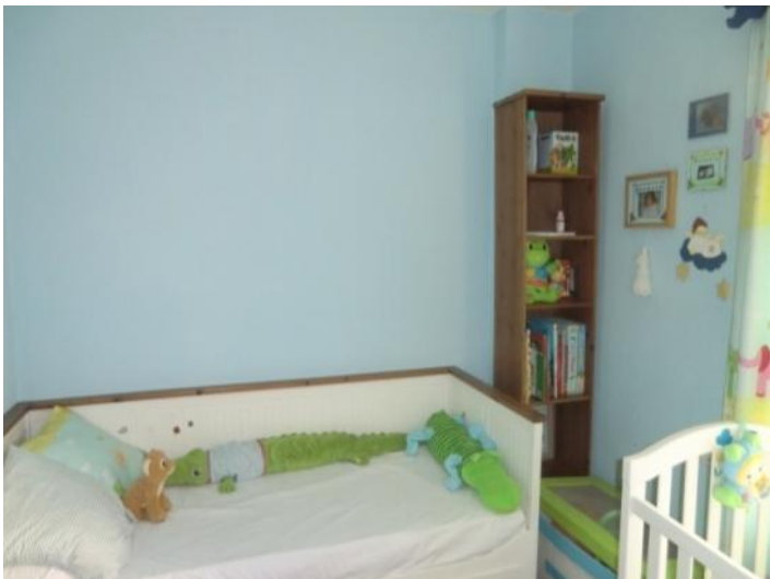
Another bedroom which is currently used as a nursery