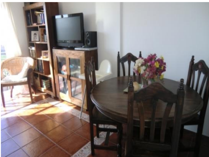
Living room with dining area