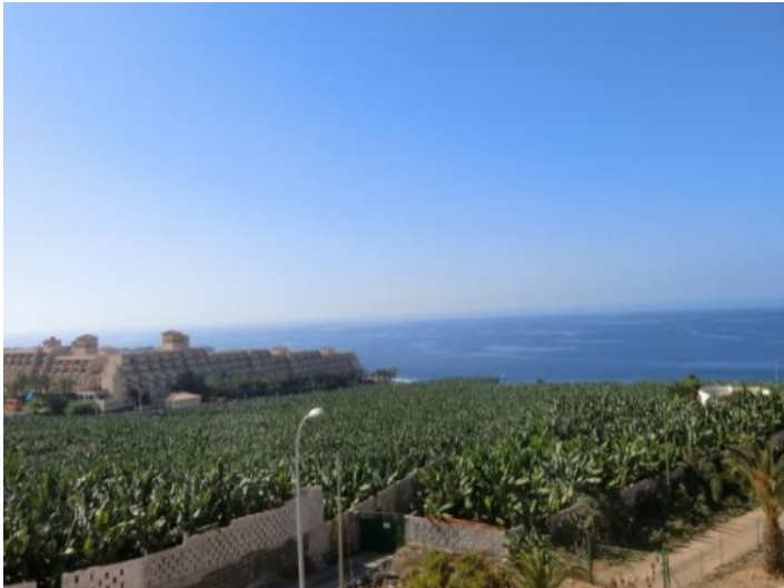
Fascinating sea view