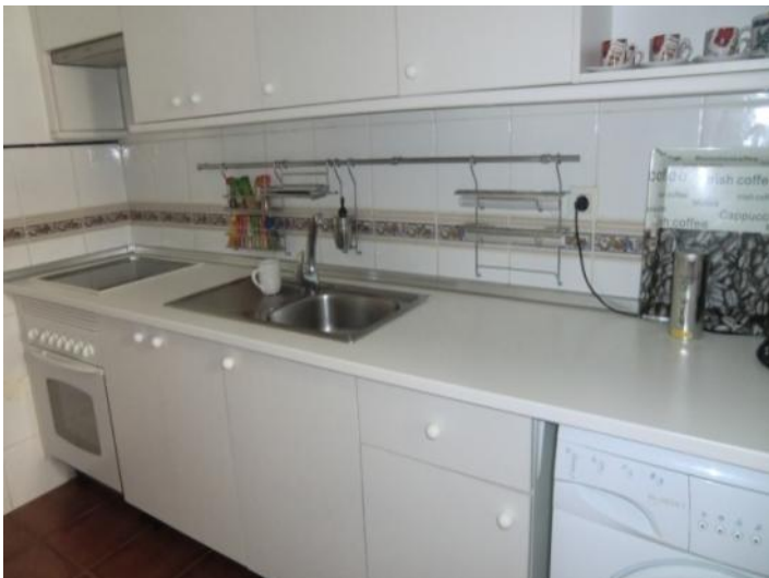
Bright and fully equipped kitchen