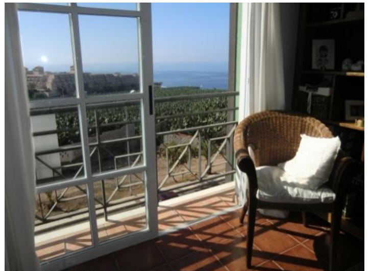
Large windows provide plenty of light