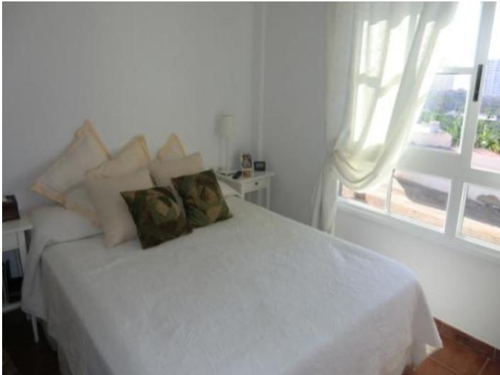
Friendly bedroom with large windows