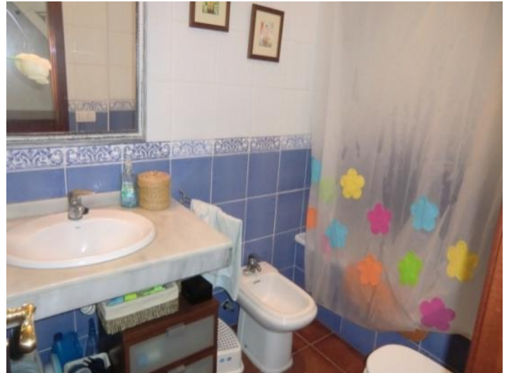
Beautifully tiled bathroom with bath tub