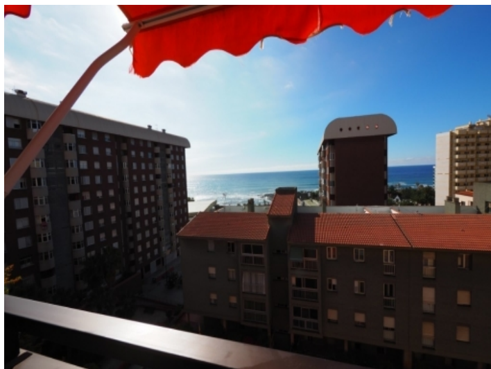
View from the window