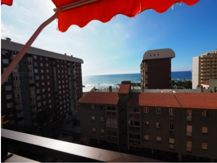
View from the window