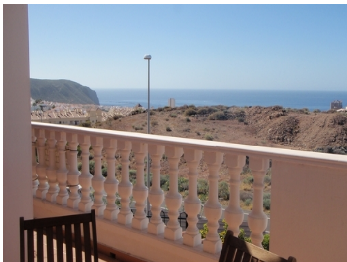
Terrace overlooking the Atlantic Ocean