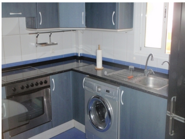
Fully equipped kitchen with washing machine