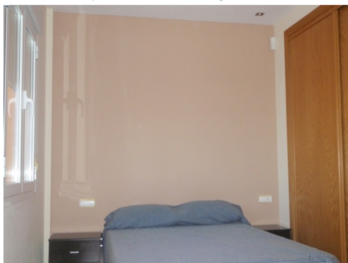
Bedroom with double bed and fitted wardrobe