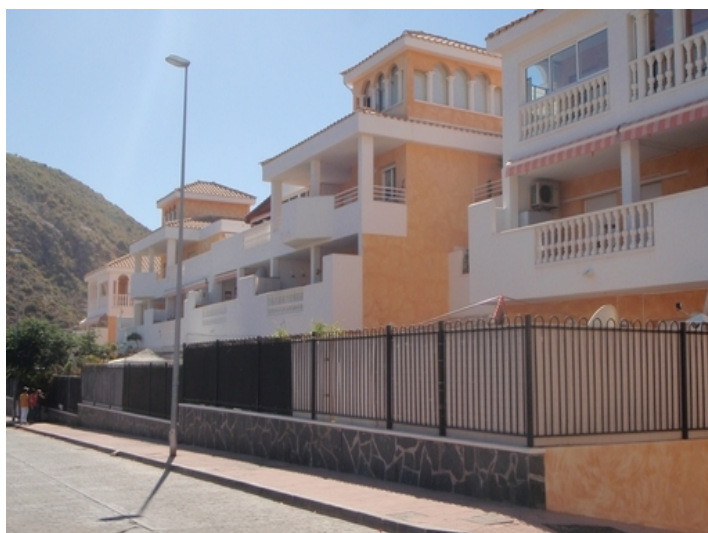
Exterior view of the apartment