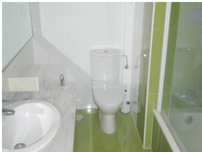
Bright bathroom with bathtub