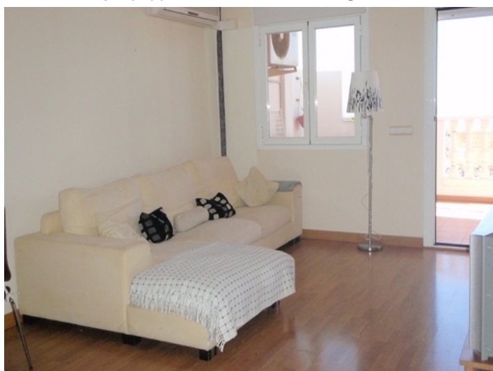
Bright and spacious living room