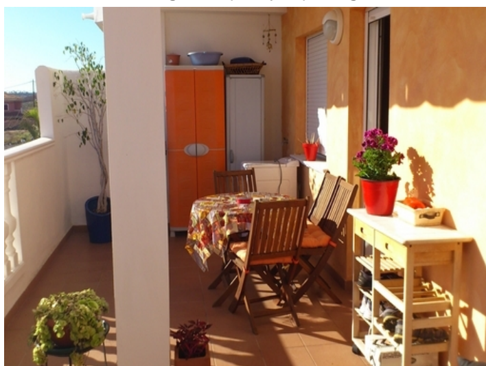
Cozy sun terrace