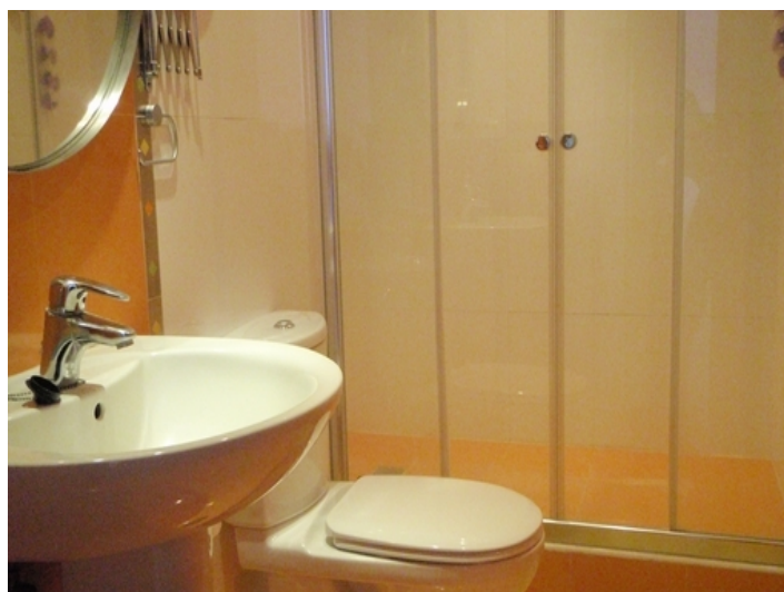
Stylish bathroom with large shower