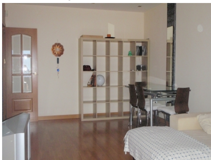
Large living room with table and shelf