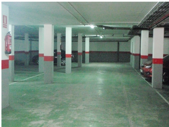
Garage with plenty of parking