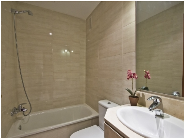
Bathroom with bathtub