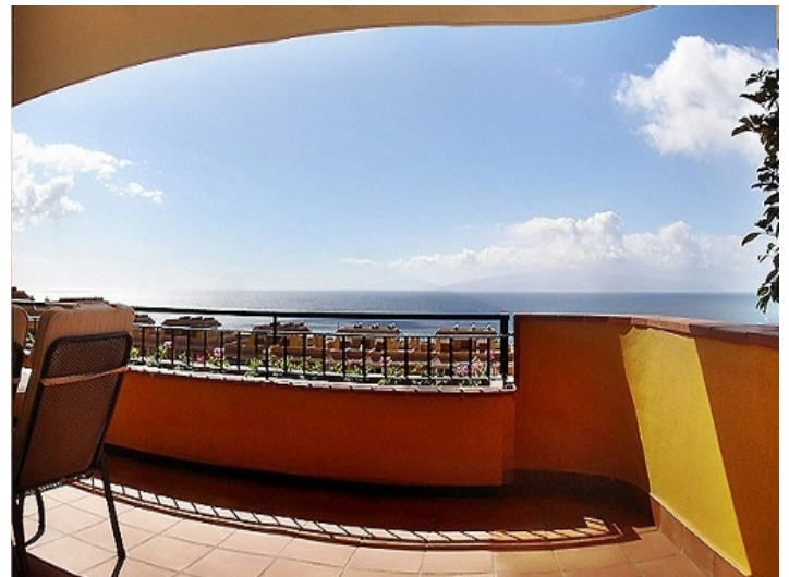
Large terrace with wonderful views