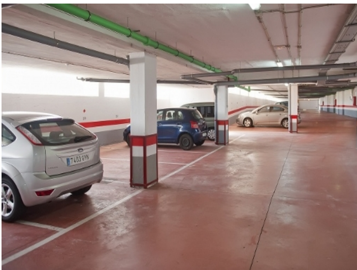
The spacious garage