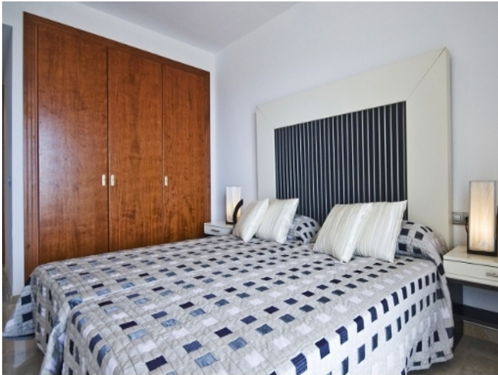
One of the bedrooms with fitted wardrobe