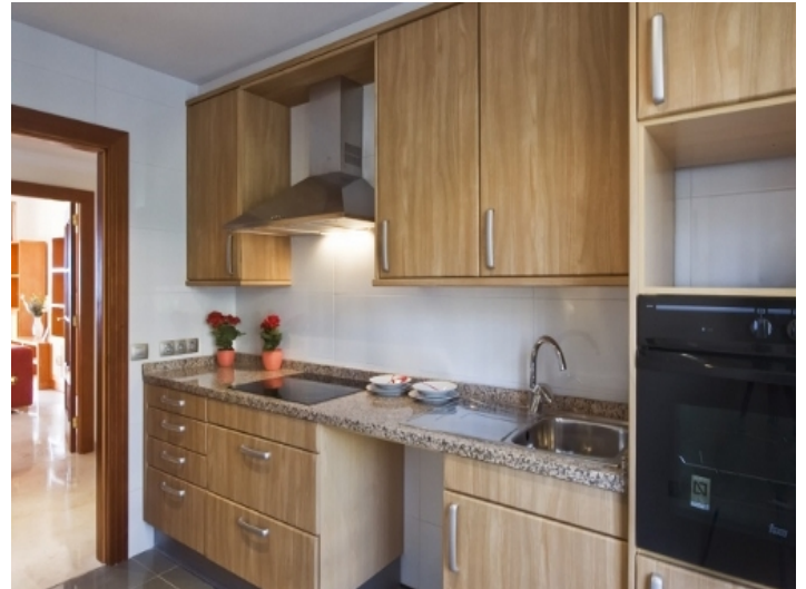
Nice designed modern kitchen