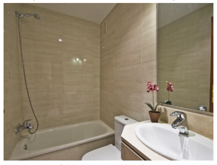
Bright bathroom with bathtub