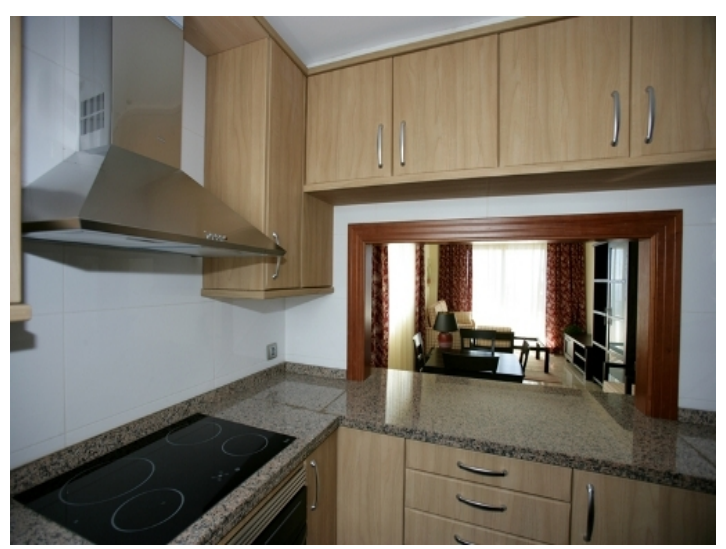
Elegant modern kitchen with view to the living room