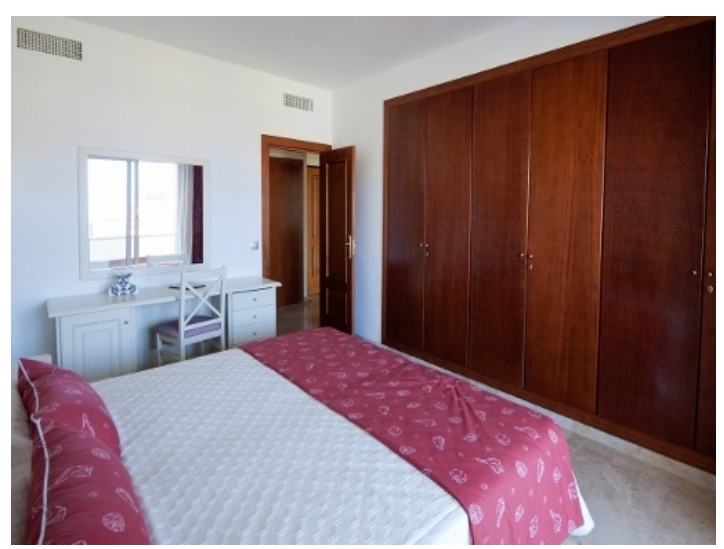
Bedroom with large fitted wardrobe