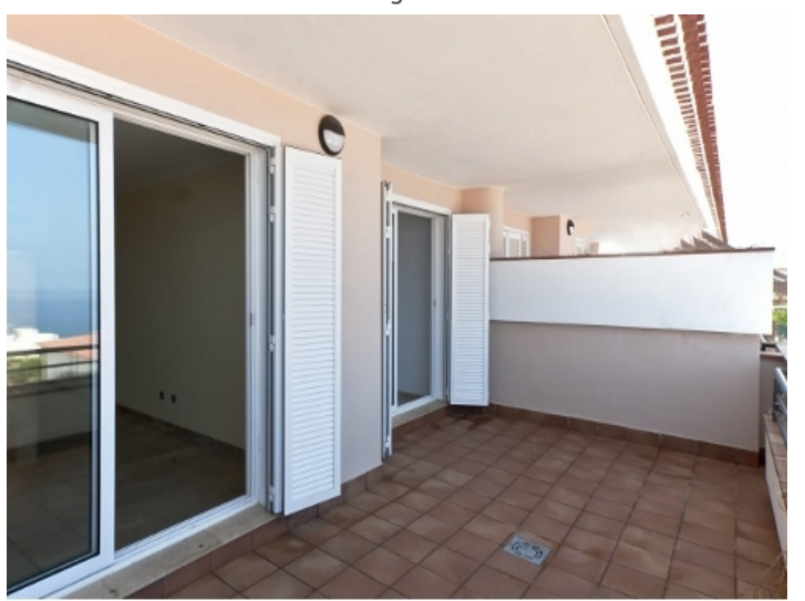
A large terrace with access to the living room and bedroom