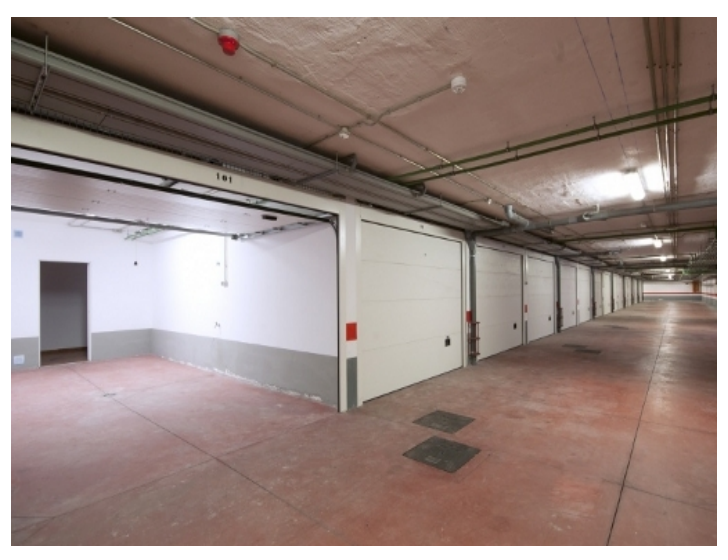
Underground parking with automatic gate