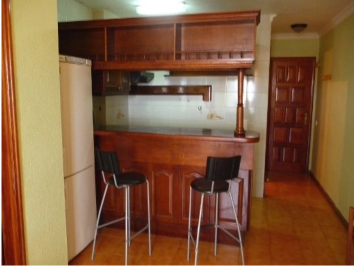
Open kitchen with bar