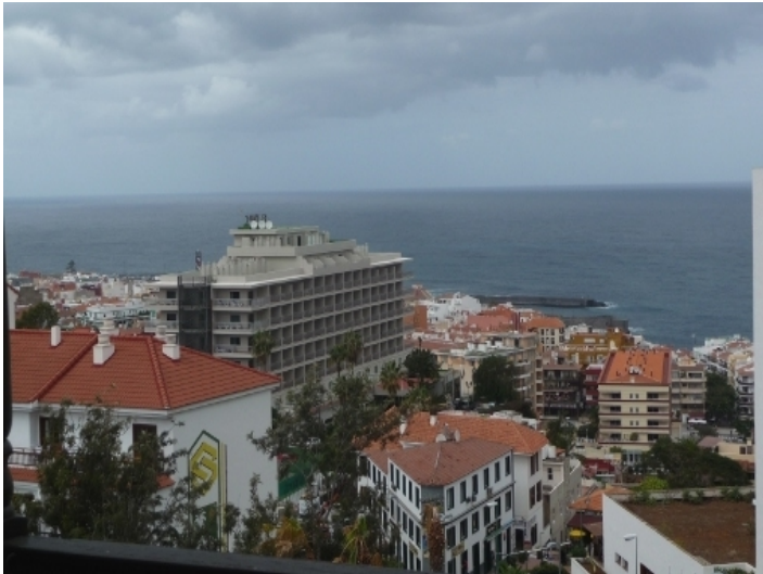
Sea view from the balcony