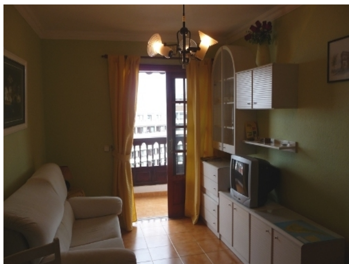
Bright living room with balcony