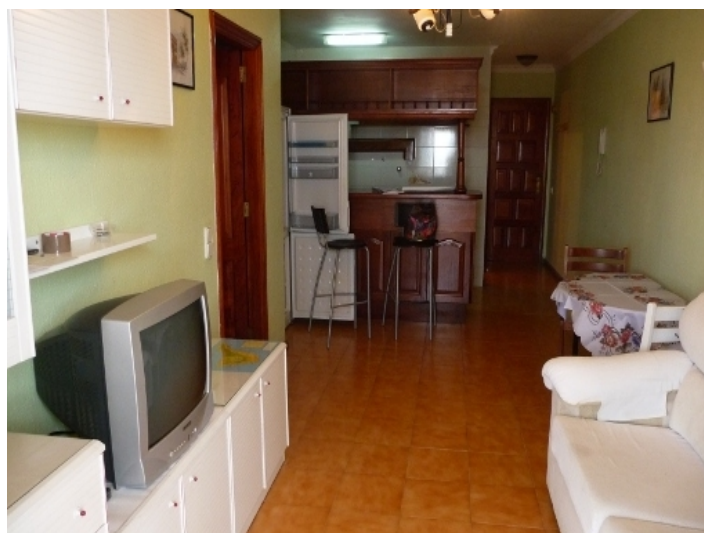
Living room with open kitchen