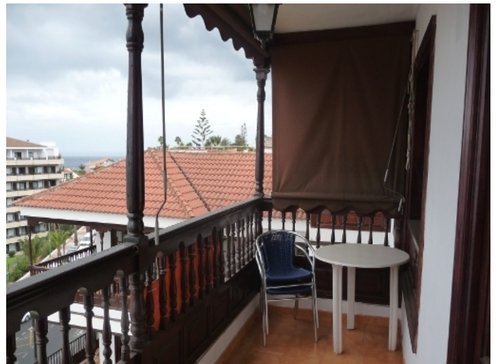
Balcony with afternoon sun