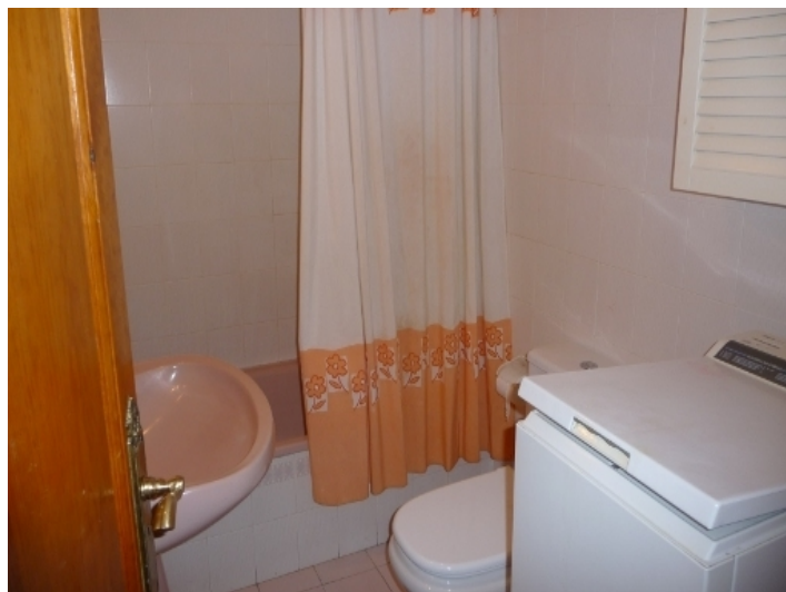
Bathroom with tub