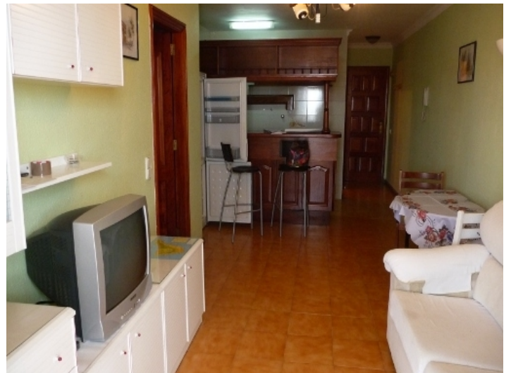
Living room with open kitchen