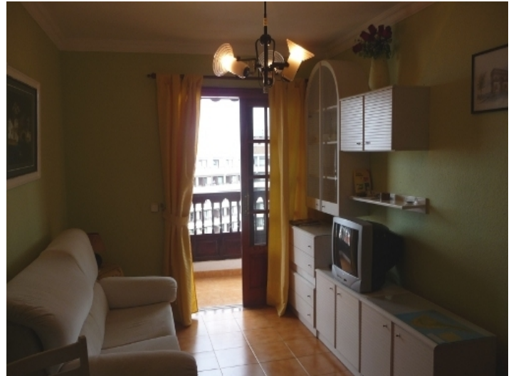
Bright living room with balcony