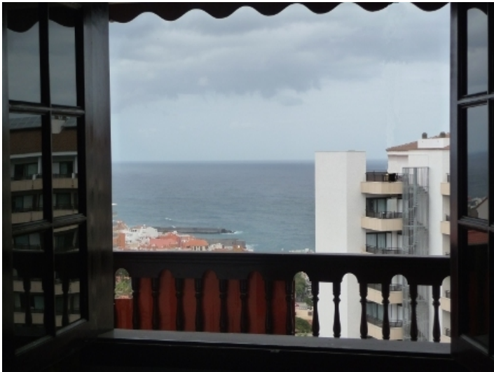
Sea view from the bedroom