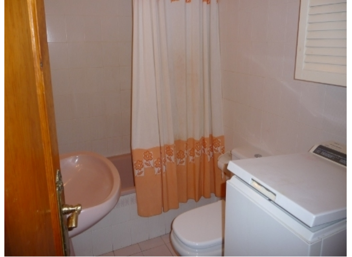
Bathroom with tub