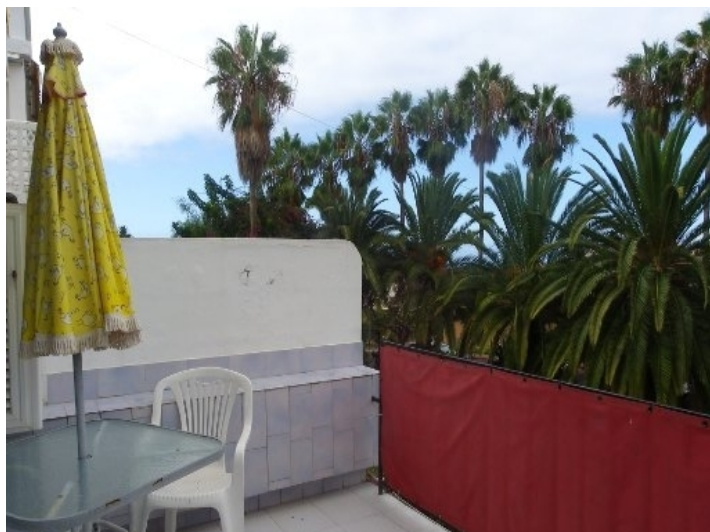
Inviting terrace overlooking the palm