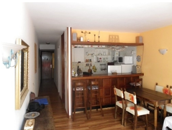
Open kitchen with dining room