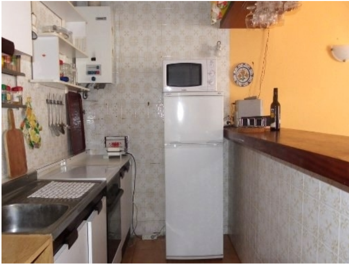
Kitchen with wooden bar