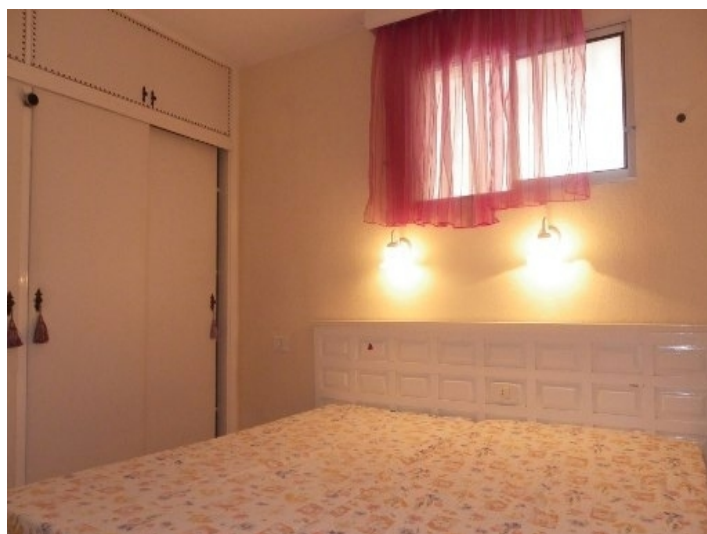
Bedroom with wardrobe