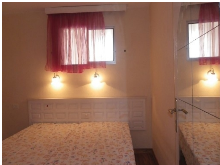
Another angle of the bedroom