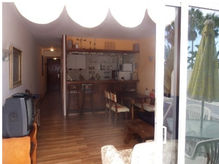
View from the terrace to the living room