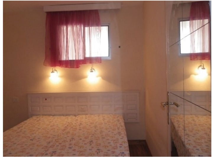
Another angle of the bedroom