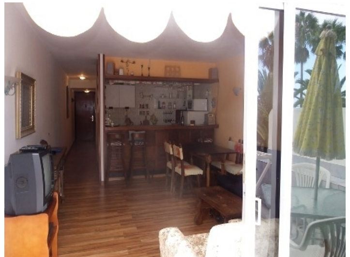
View from the terrace to the living room