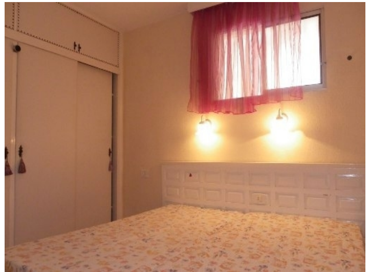
Bedroom with wardrobe