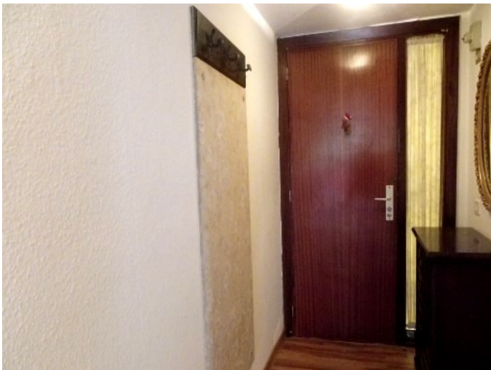
Entrance to the apartment