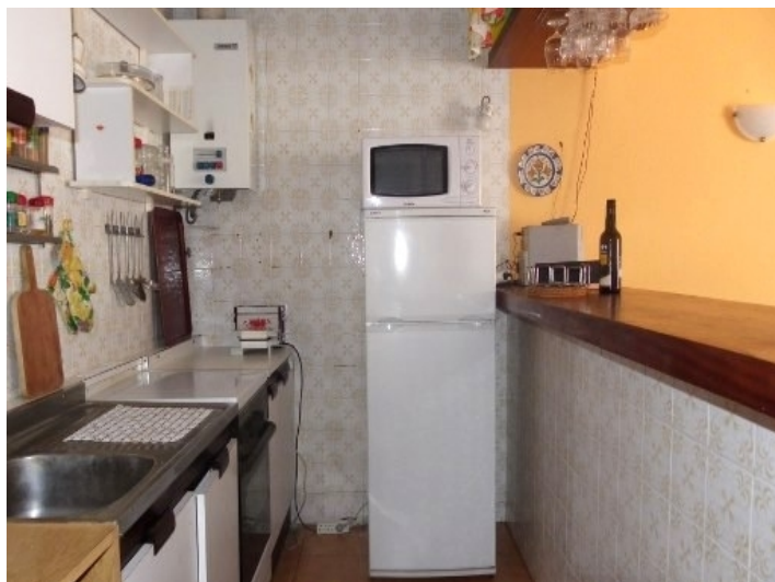
Kitchen with wooden bar