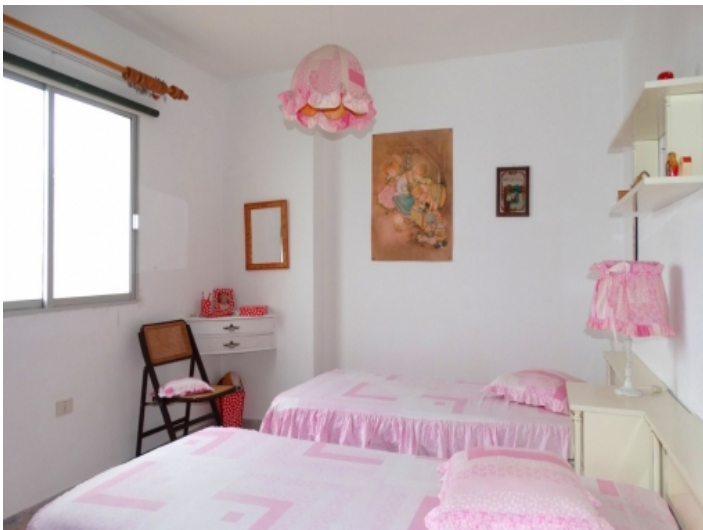
The second bedroom from a different