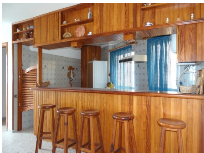
Kitchen with bar