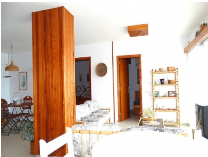
Salon with dinette