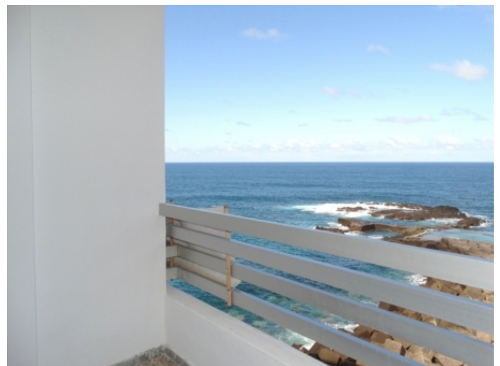
One of the two balcony terraces