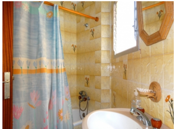
Bathroom in nice soft colors