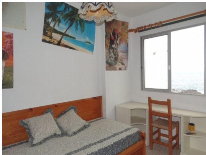
One of the bedrooms