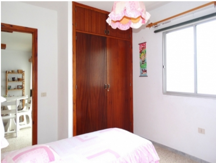
Bedroom with fitted wardrobe