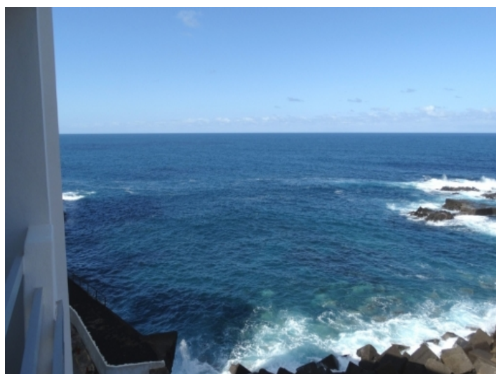
The Atlantic directly in front of the balcony