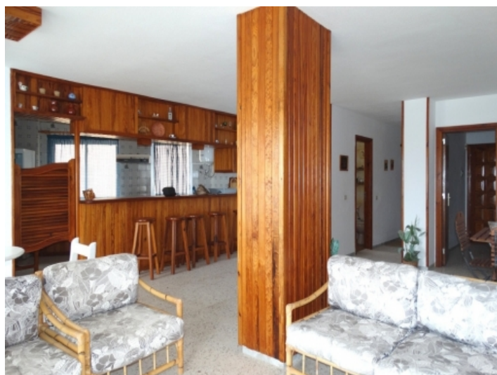
Living room and kitchen overlooking the entrance area