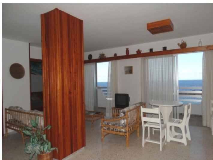
Salon with 2 of the bedrooms in the background