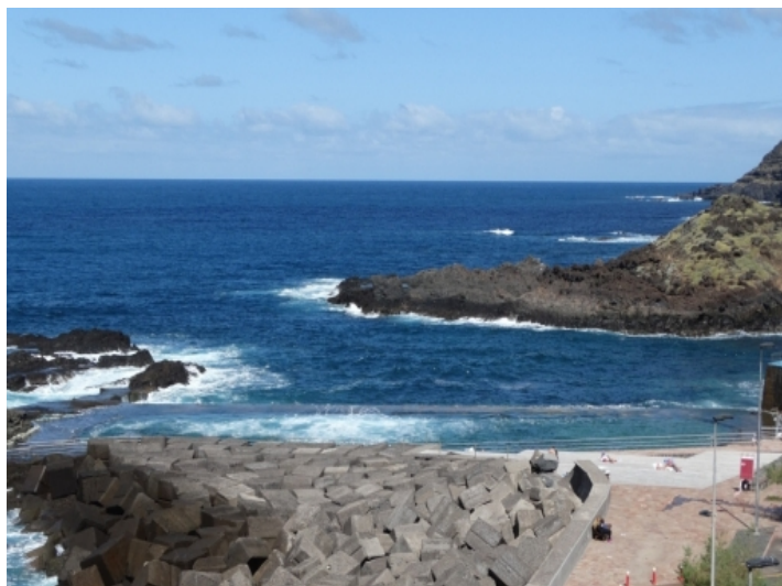
Overlooking the surf at the promenade