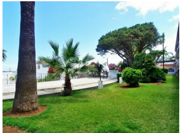
Lawn with palms, dragon trees and a stately canarian pine