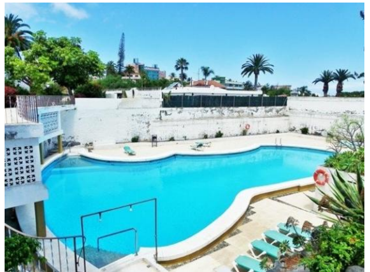
The large swimmingpool in the residence