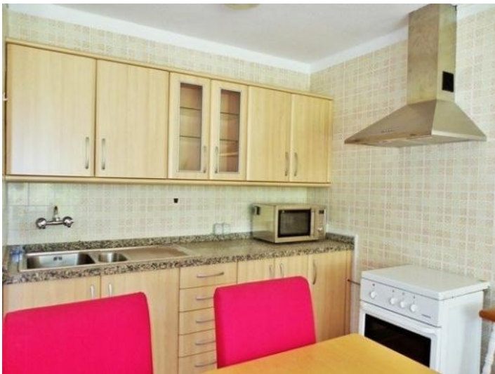
The fitted kitchen with extractor over the stove