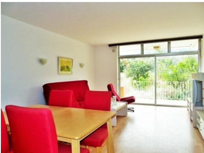
View out of the living room to the orchard