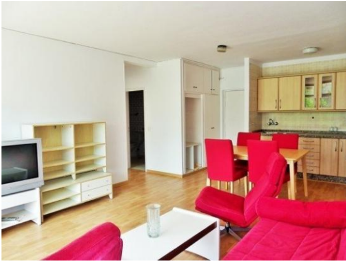
Large and cozy living room with a warm ambience