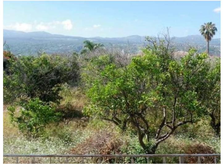
Quiet idyll with mandarin trees in front of the apartment