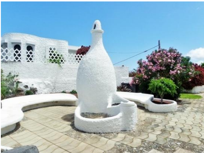
Barbecue zone with fireplace and benches