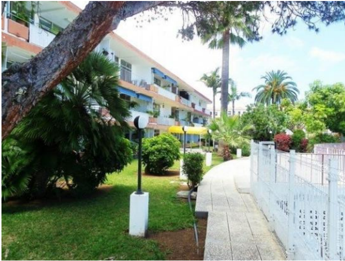
Front view of the residence, with a beautiful ingrown garden