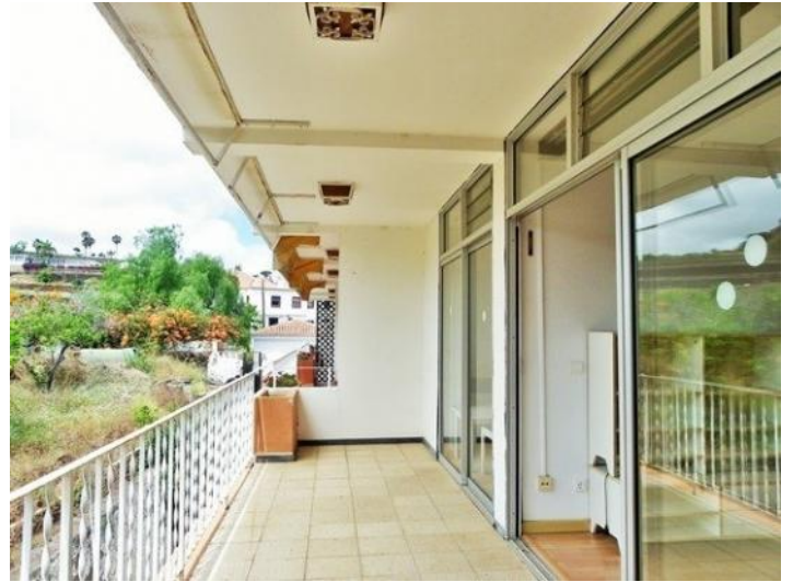
The large protected balcony in front of living room and bed