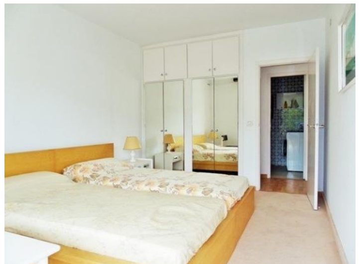
Built-in wardrobe and bathroom next to the bedroom