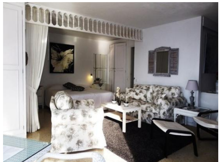
Good divided bedroom with a en-suite bathroom