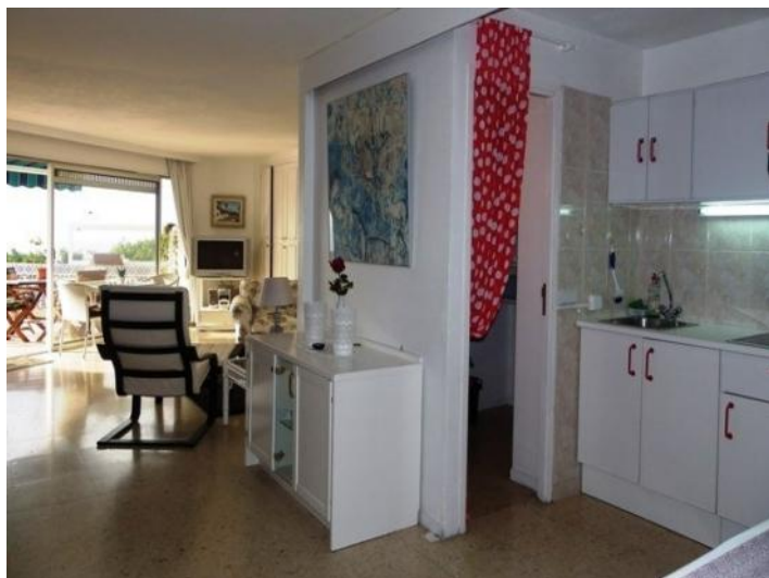
The kitchen with a pantry front of the salon