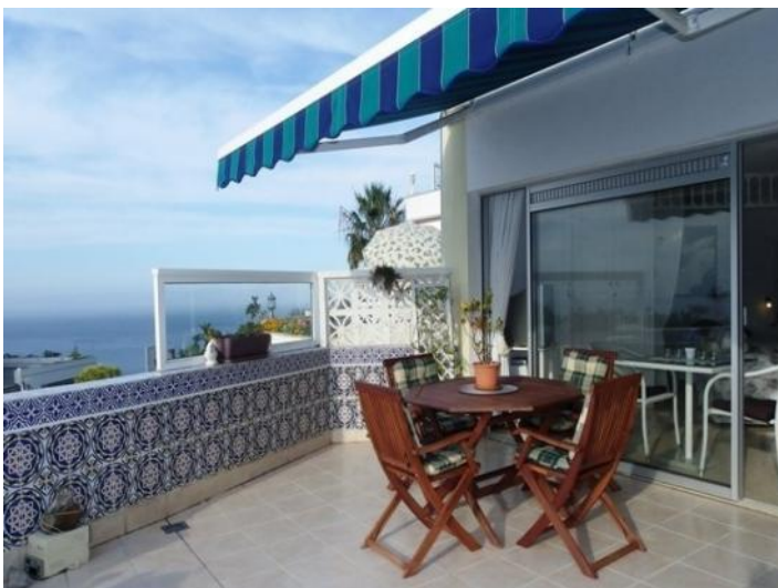
The terrace depending on the sun as a sheltered spot