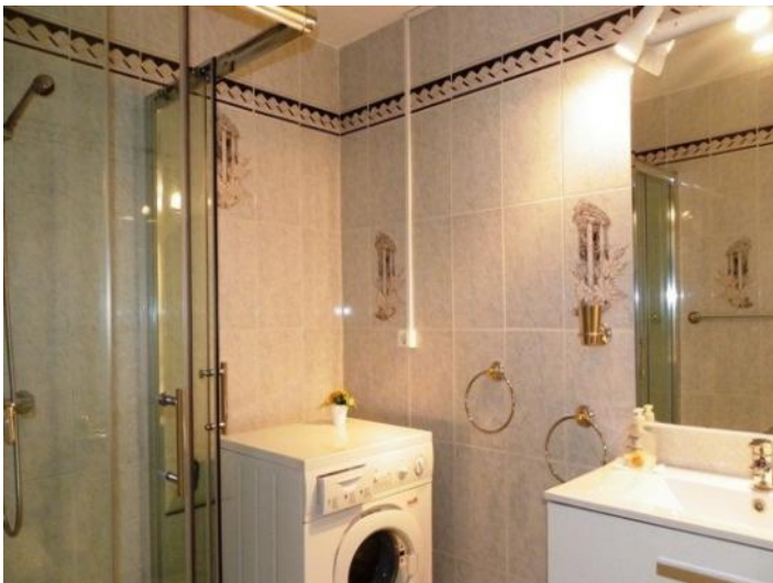
Elegant bathroom with shower cubicle new