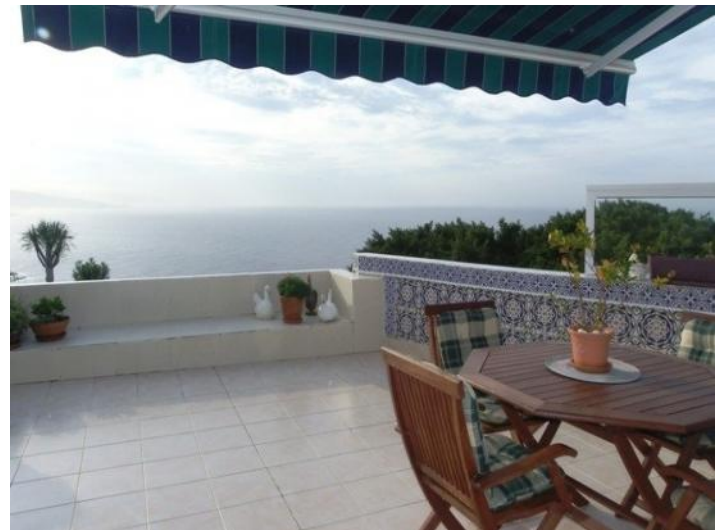
Extensive views of the Atlantic Ocean, the coast and Puerto