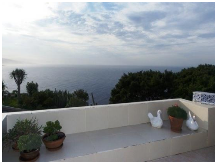
Beautiful shade to complement the seascape