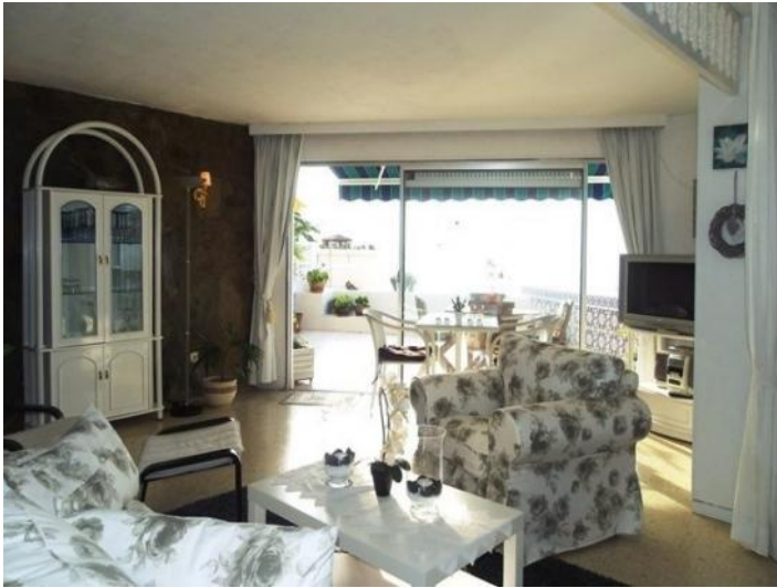
Natural stone wall beside the broad picture window