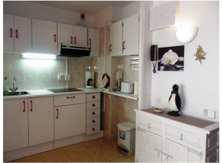
The white fitted kitchen with the entrance hall at the