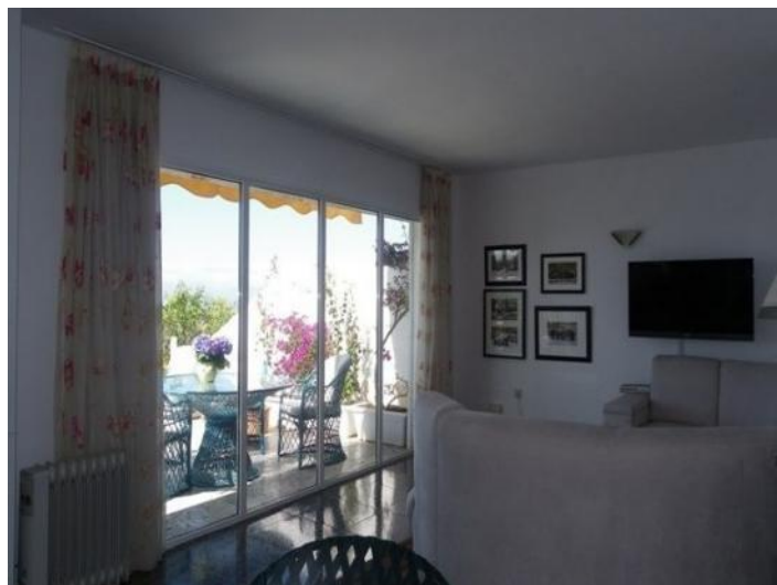
Bright living room with large sectional sofa in the front row