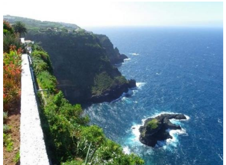
The romantic cliffs with Robinson Crusoe Island