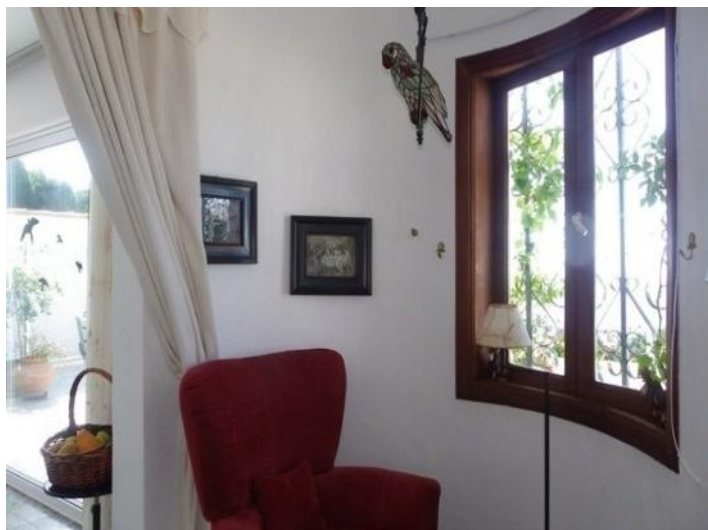
Cozy bay window at the salon