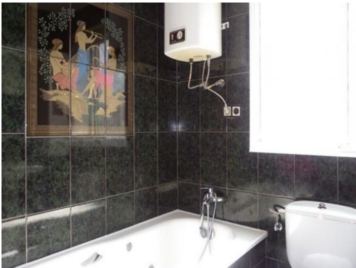
The second bathroom with bathtub