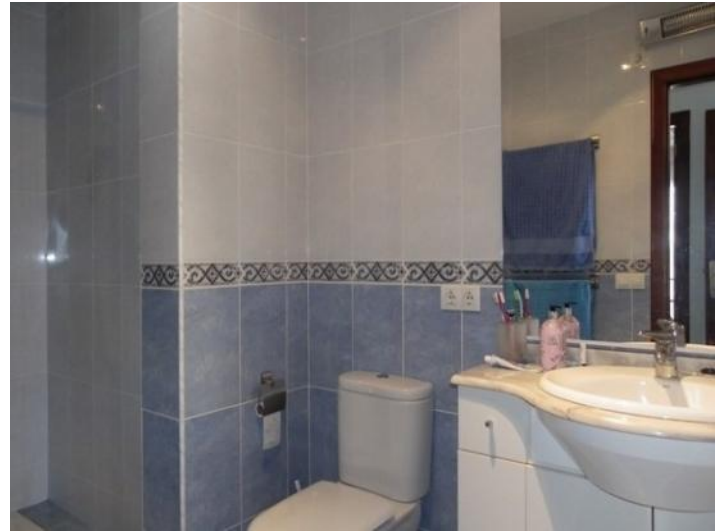
Bathroom with lots of space in the shower and large mirror