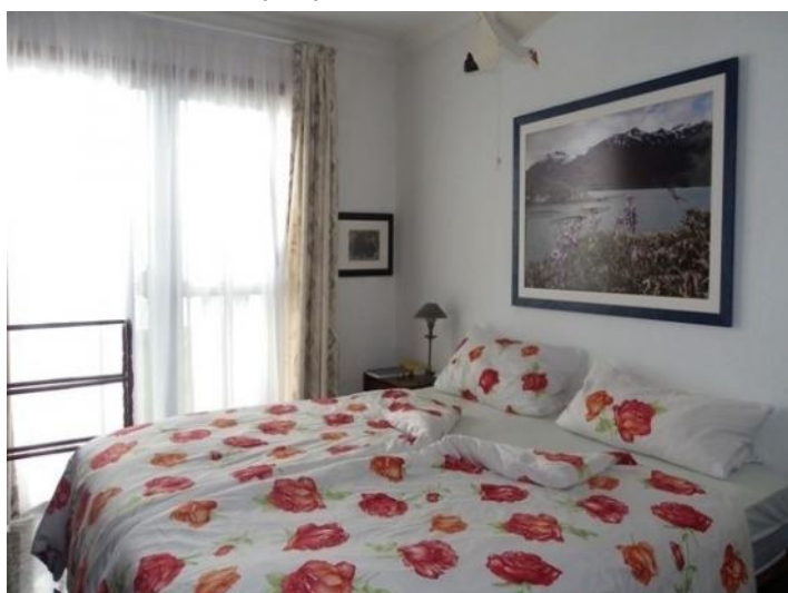
The bedroom has a bright ambience