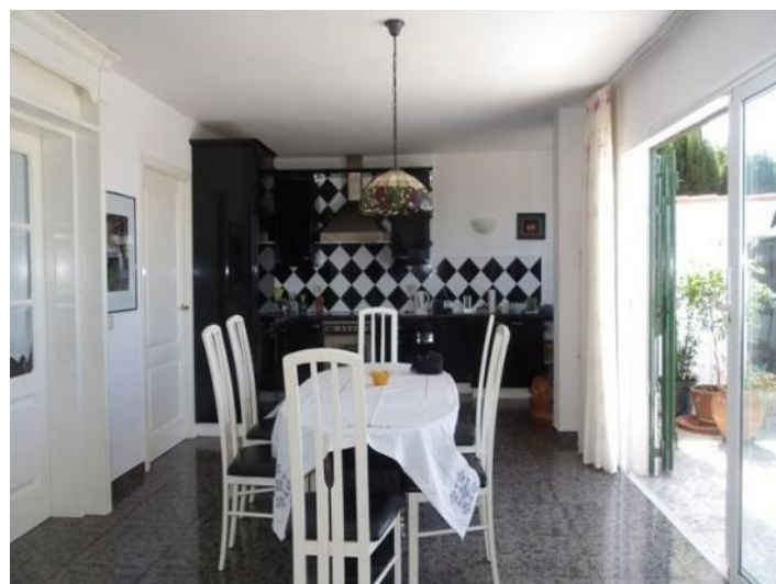
Separate dining area with stylish kitchen