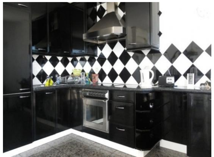
The modern kitchen with ceramic hob and extractor hood