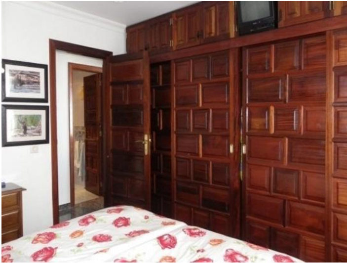
Plenty of space in the closet and TV in the master bedroom