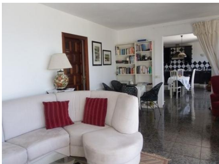
Spacious living area with panoramic sea views from the first