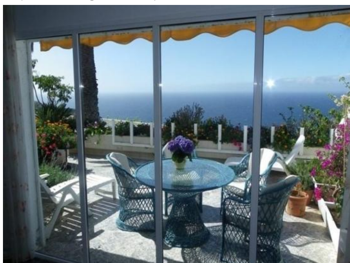
Terrace of 75 sqm subdividd in two areas