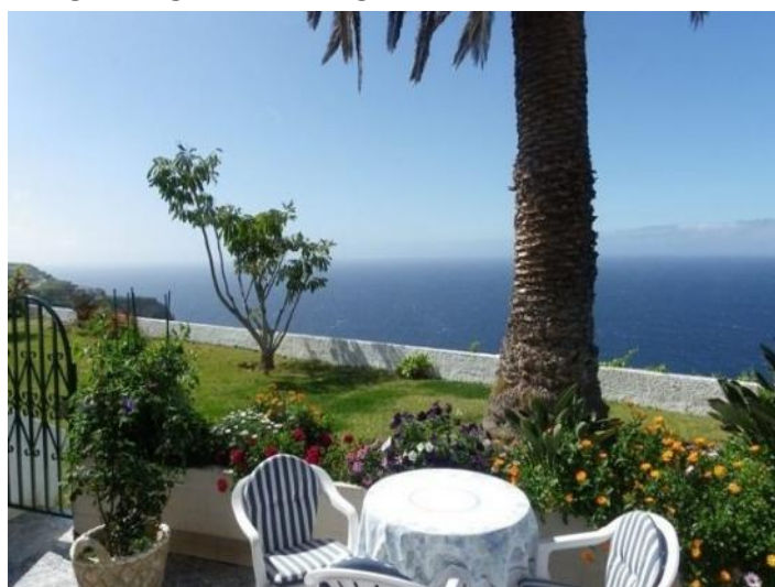
Wanderlust feeling with great Canarian palm