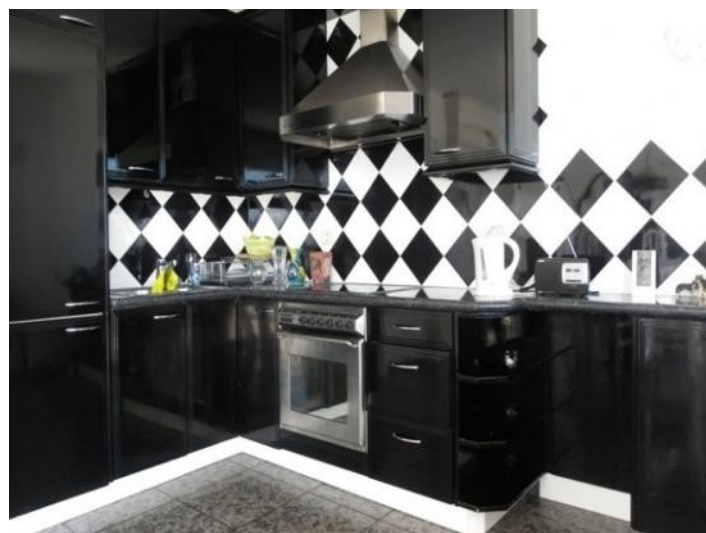
The modern kitchen with ceramic hob and extractor hood