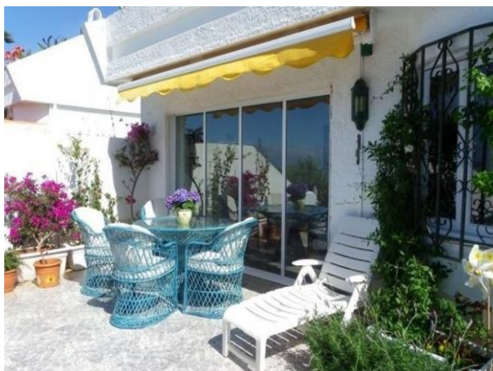
Protected seating area with awning right on the living room