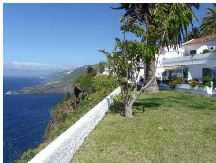
The well-kept garden right on the cliff