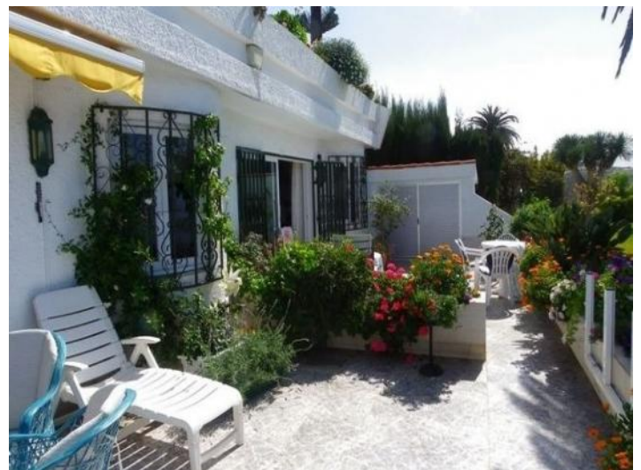
Majestic long terrace at the Community Garden