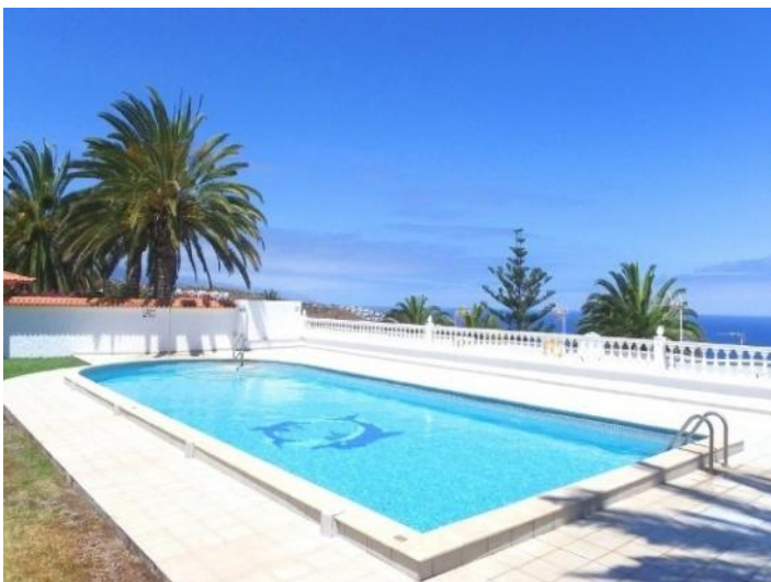
Large swimming pool with sea views to relax