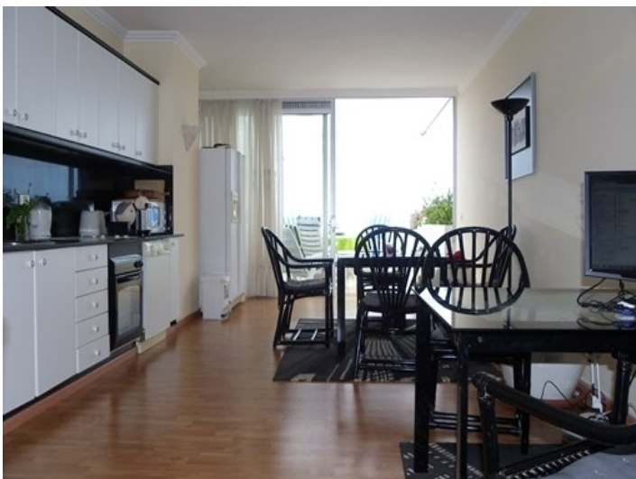
The open kitchen with dining area and access to the terrace