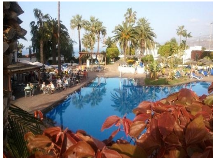
The large and well-maintained community pool