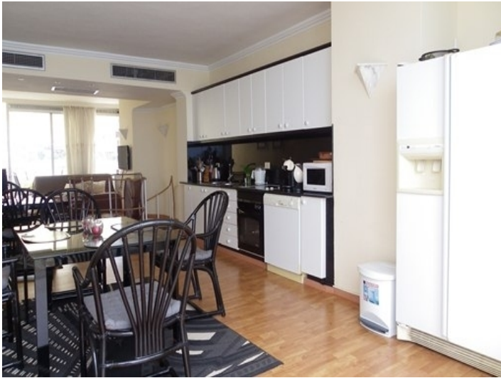
The light-flooded living area with open kitchen and two