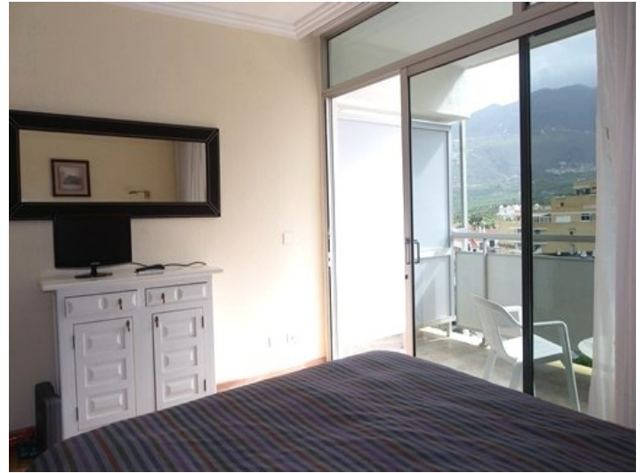
The bedroom - with terrace as well