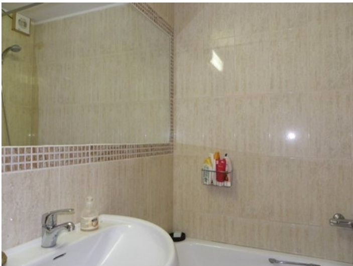
The modern bathroom with bath tub