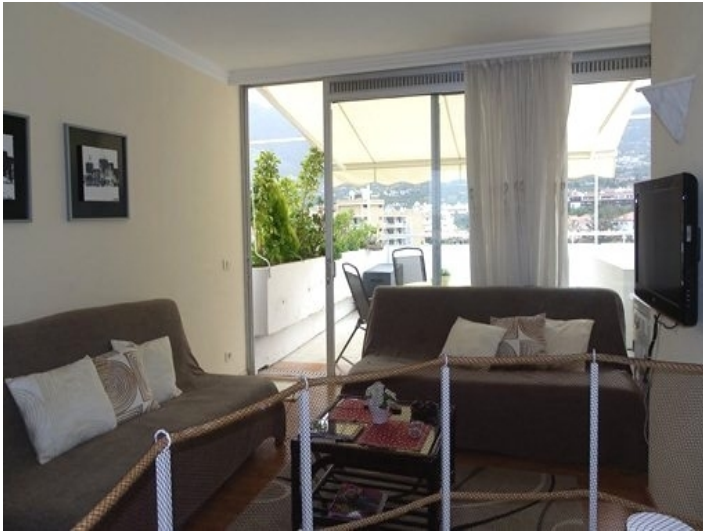
The comfortable living area with the south terrace in the