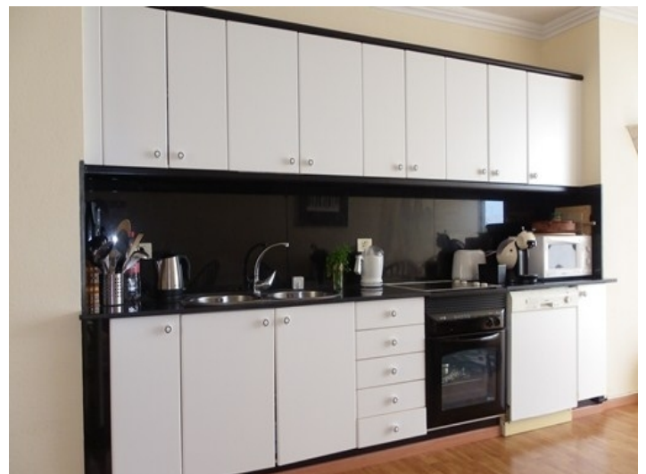
The modern, fully equipped kitchen