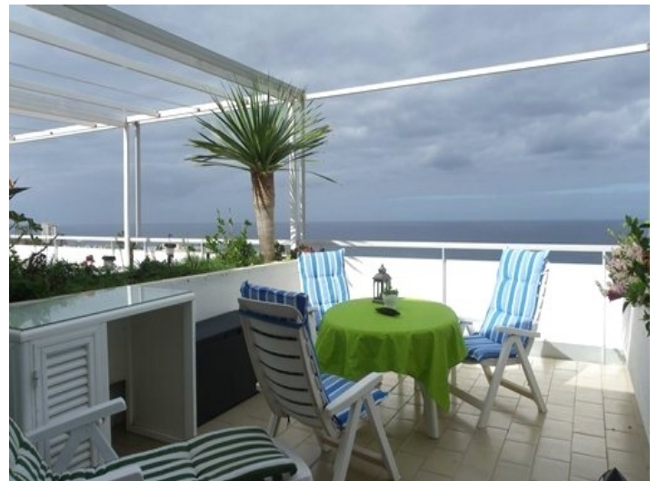
The sunny terrace with sea view