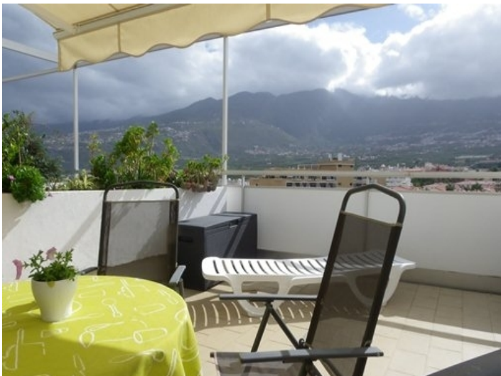
The lovely south facing terrace with stunning views of the