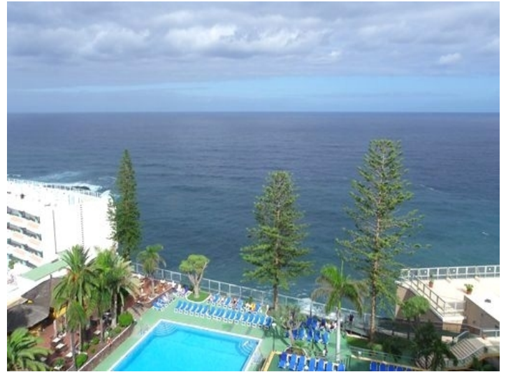
Stunning views of the Atlantic