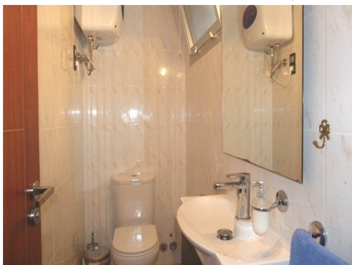
The guest bathroom