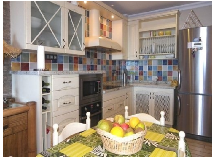
The open, fully equipped kitchen