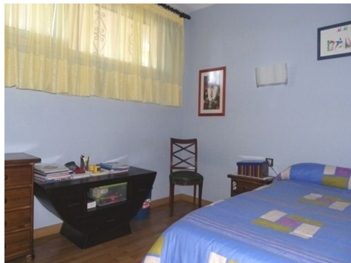
The second bedroom