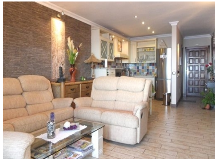
The living room with view to the kitchen