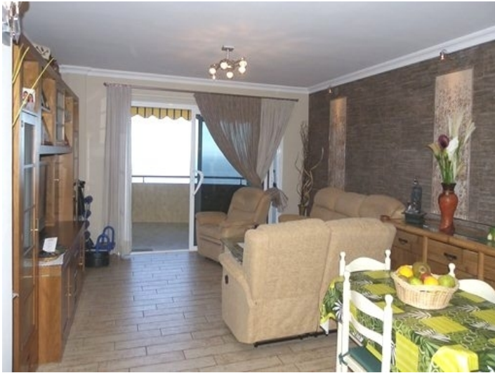
The living room with dining area and access to the terrace