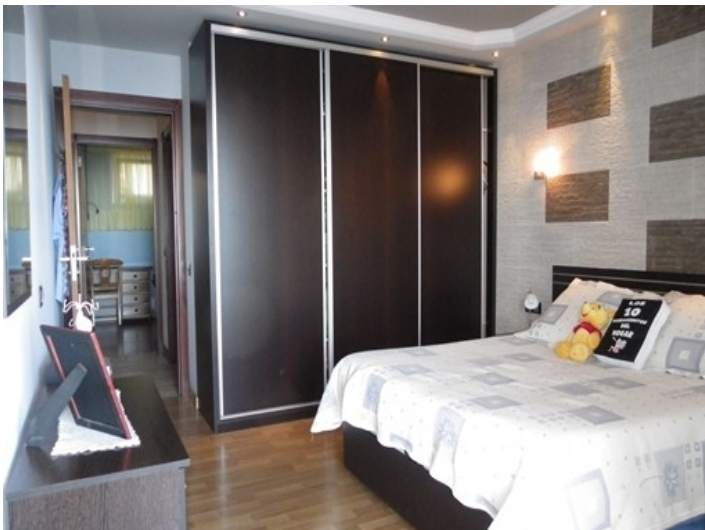
One of the bedrooms with double bed and large wardrobe