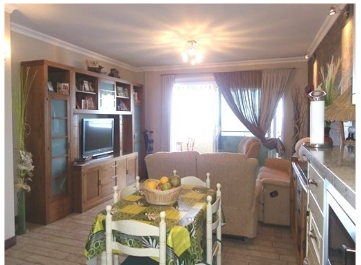
Alternative view of the living room