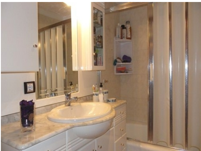
The bathroom with bathtub