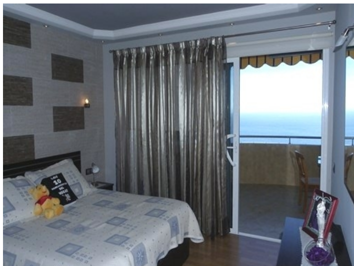
The master bedroom with ocean view and balcony access