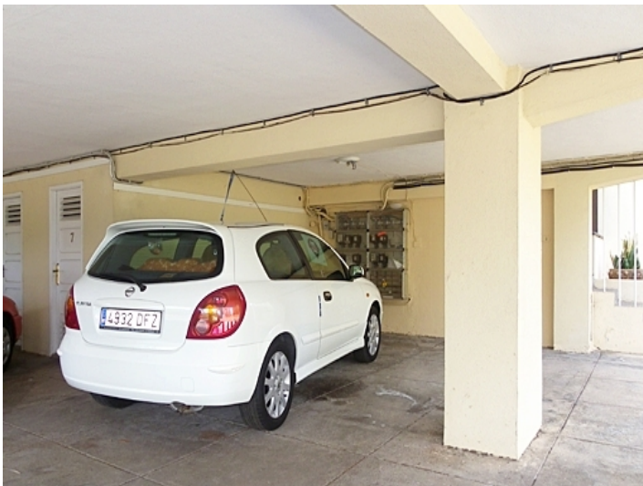
Carport directly at the entrance to the building