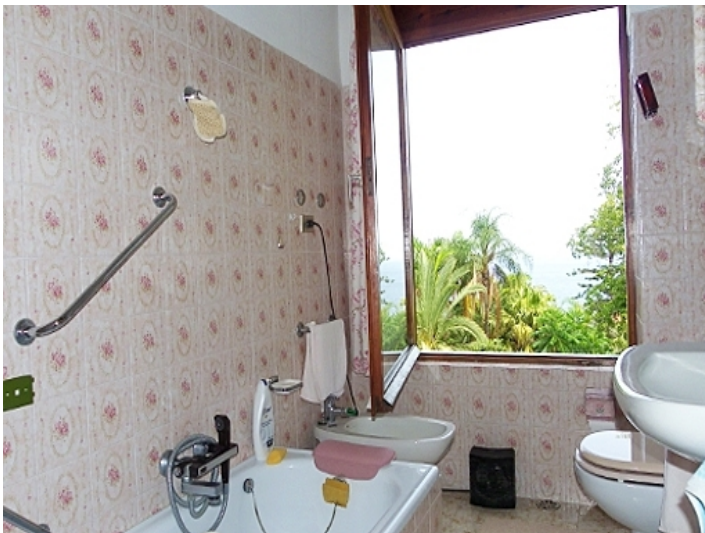
Bathroom with bathtub and sea view