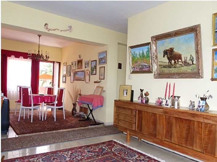
View from the living area to the dining area and the terrace