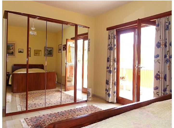
The master bedroom next to the terrace