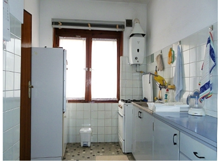
Bright and spacious kitchen