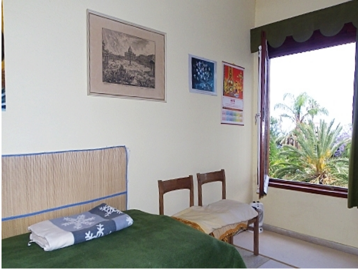
The second bedroom in front of the Park and the Atlantic