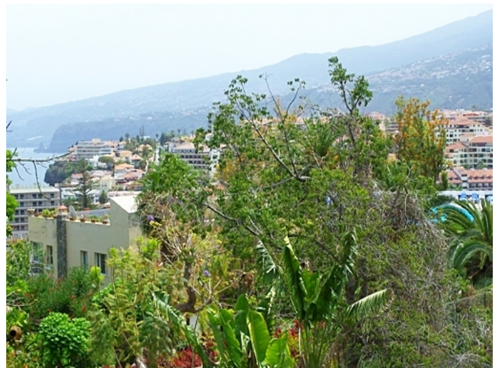
Side view to the sea, the coast and the mountains