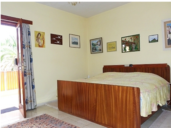
Another perspective of the master bedroom