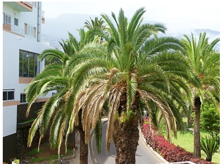
View to the Teide and palms, from the terrace