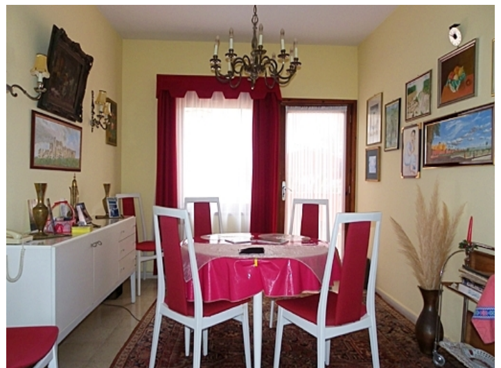
Dining area with exit to the outside area