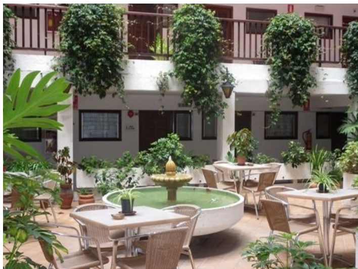
Cosy atmosphere in the patio