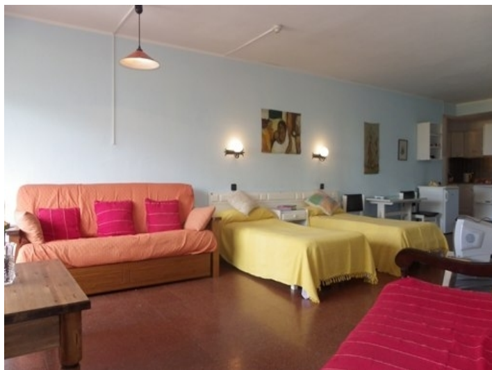
The room in the long shot with the kitchen in the background