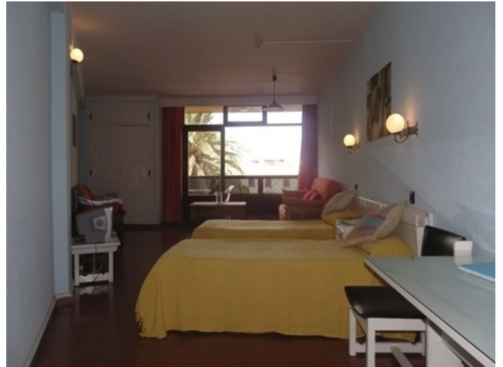
Spacious living and bedroom with balcony