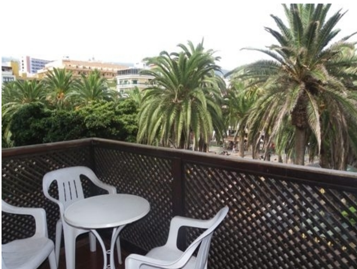
Balcony overlooking Plaza del Charco and Teide