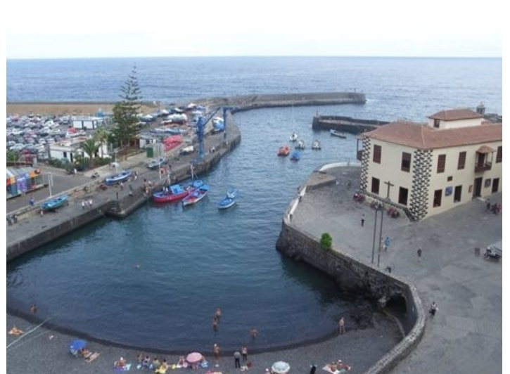
Beautiful view from the rooftop terrace overlooking the