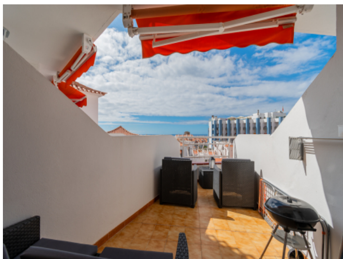
Balcony with views