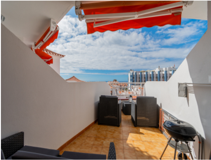
Balcony with views