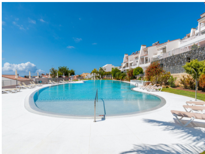
Superb pool area