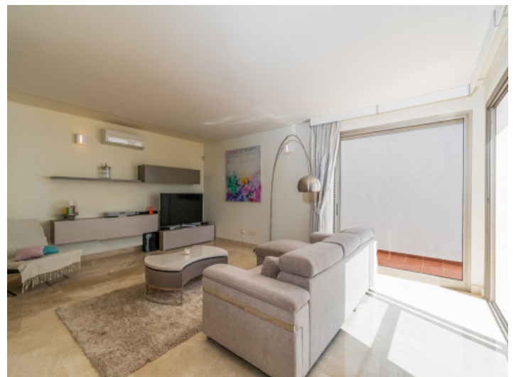
Large living area