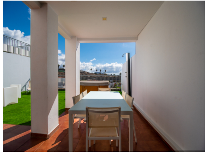
Covered terrace with outdoor dining area