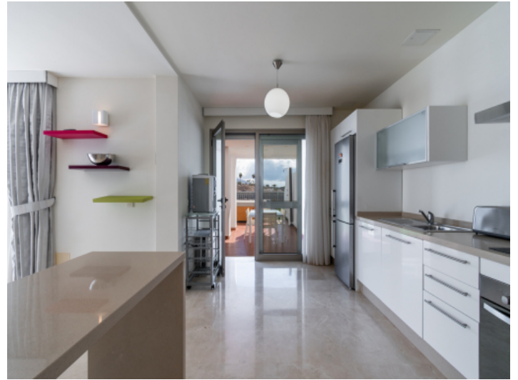
Kitchen with access to a terrace