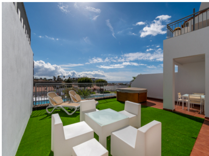
Sunny terrace with seating