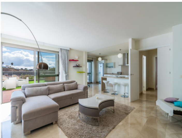
Elegant living area