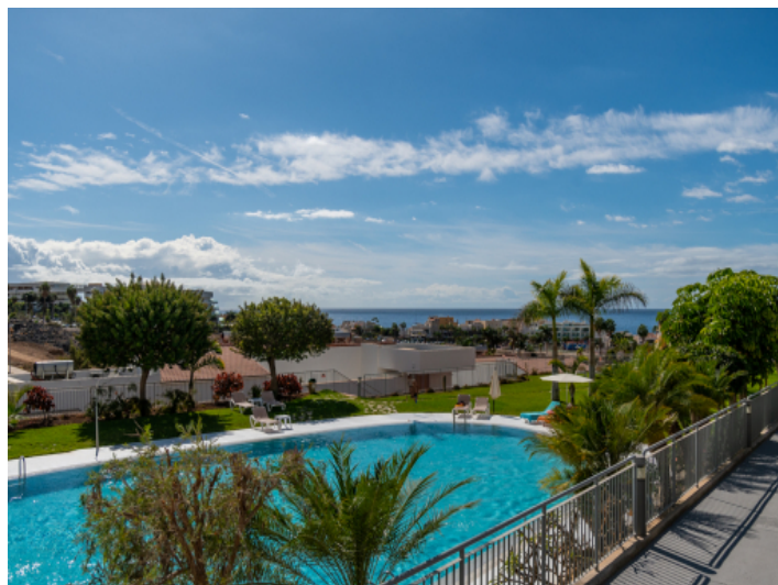
Fantastic sea views