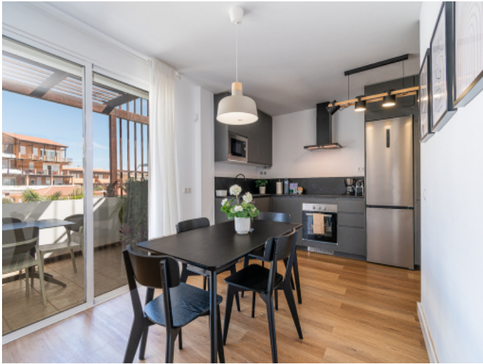
Bright dining area