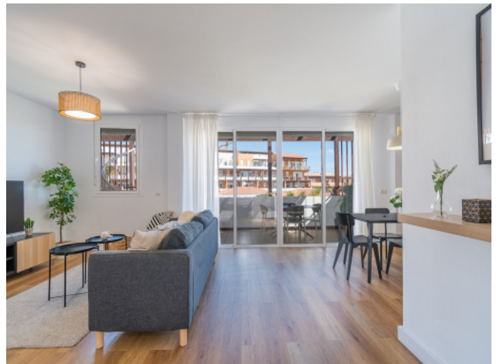
Living area with access to a terrace