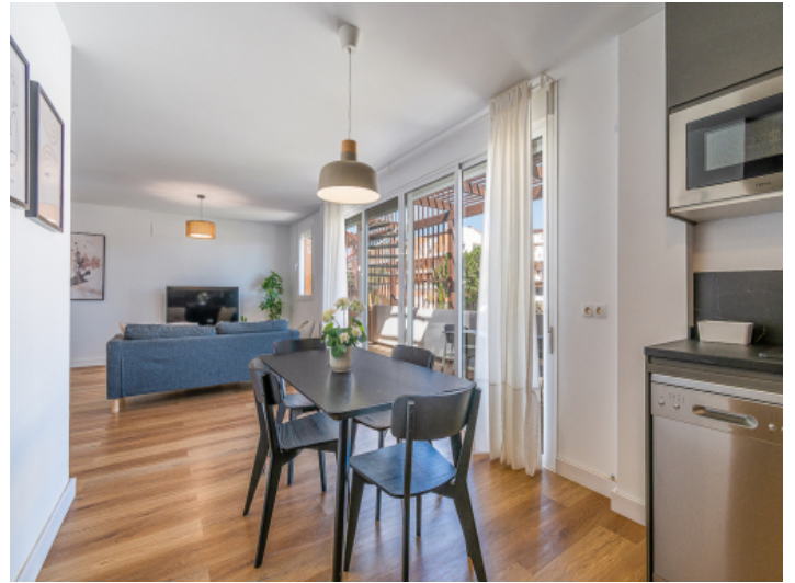
Dining area adjacent to the kitchen