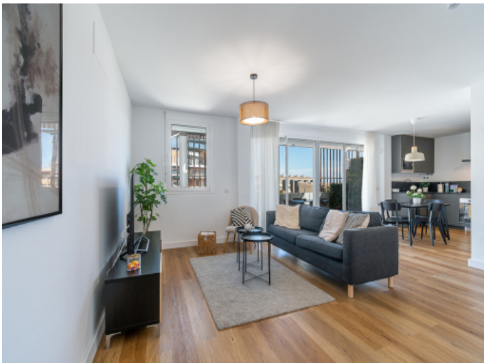
Lovely living area