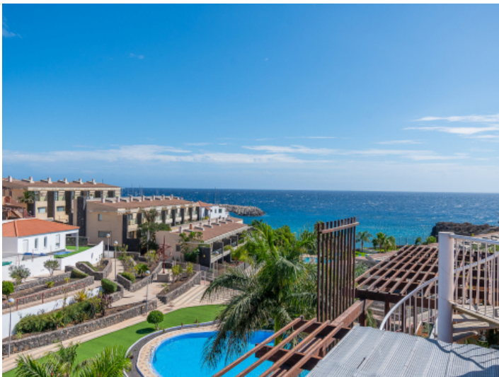
Views from the roof terrace