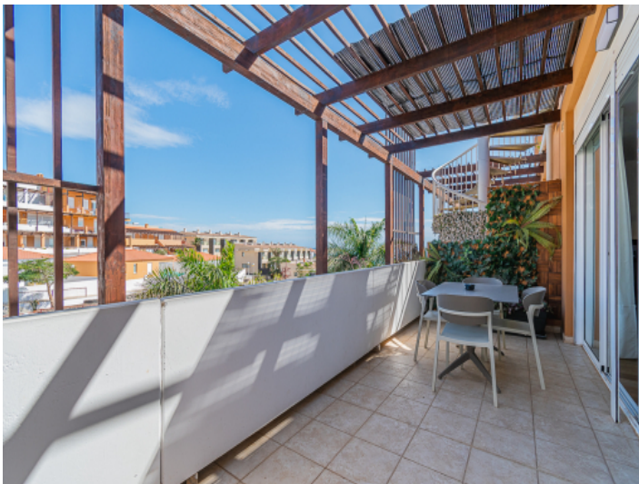
Terrace with outdoor dining area