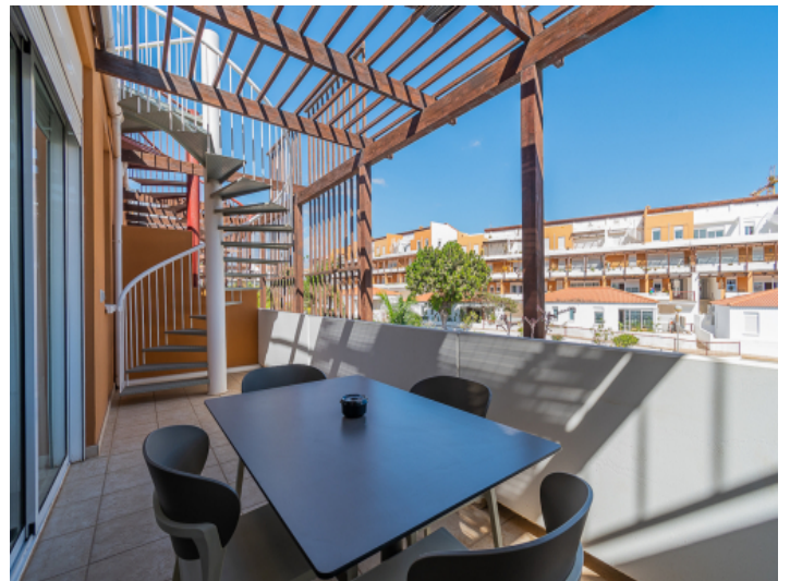
Terrace with outdoor dining area