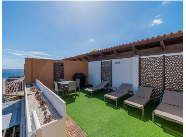
Fantastic roof terrace